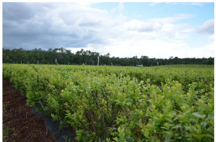
Figure 5. Regrowth following summer hedging and topping (mid-June).