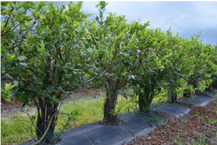
Figure 2. ‘Farthing’ plant previously trained to a narrow crown with cartons.

In addition to promoting vegetative growth, hedging can help reduce disease pressure by removing inoculum (e.g., rust and Septoria) from the field. It will also open up the plant canopy to allow for better air flow (promoting faster foliage drying and therefore less fungal disease) and better coverage when spraying fungicides and insecticides. Hedging can also remove damaging insects from the plant’s top growth, including blueberry bud mites and wax scale. Because hedging can create an entry point for disease pathogens such as Botryosphaeria (stem blight), it is important to spray a fungicide, such as captan, immediately after hedging to minimize the opportunity for plant infection (Figure 6).