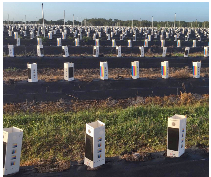
Figure 1. Cardboard cartons on young blueberry plants.

cultivars) reduce the need for pruning of suckers emerging from the bottom of the plant. However, once the cartons are removed, continued pruning at the base of the plant is needed to maintain a narrow crown.