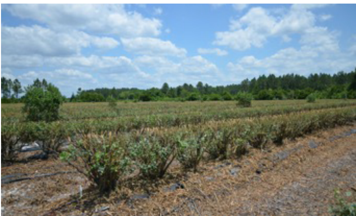
Figure 3. Blueberry field following mechanical hedging and topping done soon after completion of the harvest season.