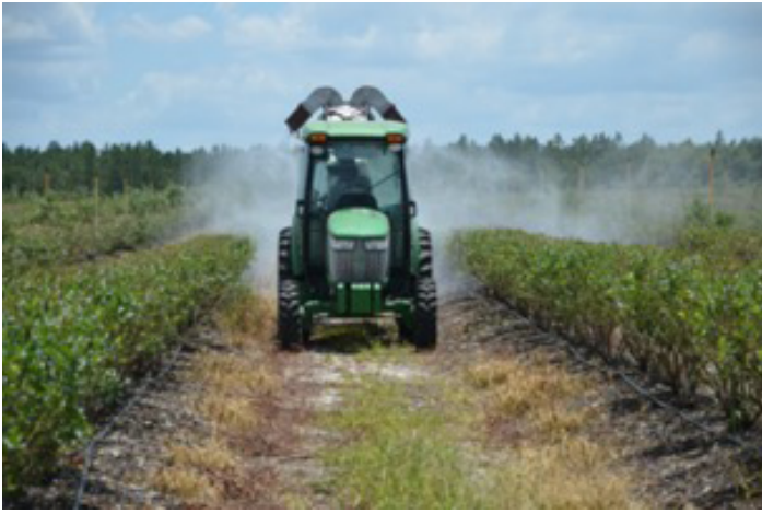
Figure 6. Fungicide application immediately following summer pruning.