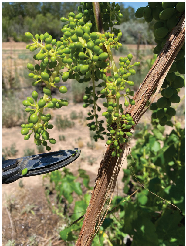
Figure 3. Cluster at correct stage for berry thinning; when the berries are pea-sized or slightly smaller, remove the lower half of the cluster.