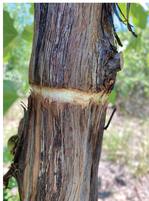
Figure 4. Double-blade girdling knife and girdling pliers (left). Main trunk of grapevine with approximately 4-mm-wide strip of phloem and bark removed, i.e., “girdled” (right).