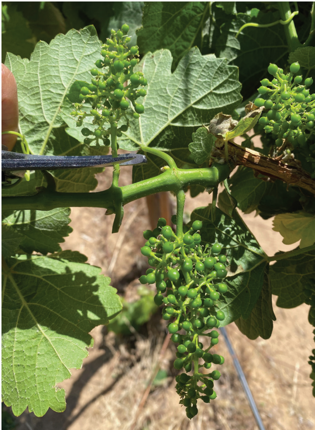
Figure 2. Thinning clusters (one per shoot) to achieve about 20–40 clusters per vine, depending on overall size of the vine.

annual opportunity to determine crop load. If you plan to use additional practices later in the season, such as trunk girdling or cluster thinning, leave an additional amount of fruiting wood on the vine when you prune. Doing so will allow you to select better clusters at thinning time (Figure 1).