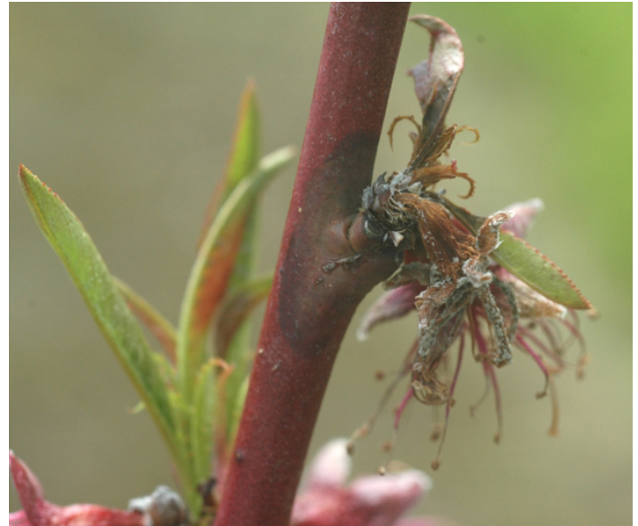
Figure 5. Blighted blossom and shoot and twig canker on a peach tree.

potential to girdle and kill a shoot, resulting in twig blight. At this point, the leaves on the blighted twig will wilt and turn brown, but they can remain attached to the branch for a few weeks (Bush et al. 2015).