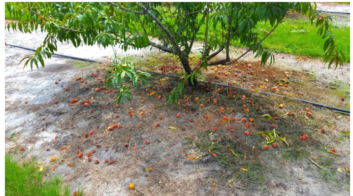
Figure 8. Without proper management, losses from brown rot infection can be 100 percent.

Weak, dead, and cankered branches and twigs should be pruned throughout the winter and spring. Pruning the canopy to create more space between branches can help reduce inoculum by increasing sunlight and airflow. The use of microjet irrigation versus rain/overhead irrigation is recommended to avoid wetting fruits, flowers, branches, and twigs (Rungjindamai et al. 2014). Opening the canopy can improve chemical treatment coverage overall, which will show better results as well as use resources more effectively. Thinning fruits along the branch is extremely important because fruits making contact with each other show a higher incidence of infection due to increased contact with inoculum. Fruits that appear stunted should be thinned as well to remove another possible source of inoculum (Bush et al. 2015). Follow UF/IFAS recommendations to avoid excess nitrogen fertilizer, because too much nitrogen can lead to the greater susceptibility of the tree to disease (Byrne et al. 2012).