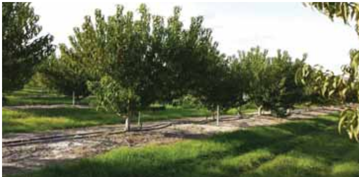
Figure 1. Peach trees in a commercial orchard in central Florida.

This document provides basic information and guidelines on water requirements and irrigation strategies for peaches ( Prunus persica L.) grown in Florida (Figure 1). Several considerations should be made when irrigation is planned for peach production, such as cultivar selection, type of irrigation system, and freeze protection. Irrigation management requires knowledge of soil properties, phenological stages of the plant, rainfall amounts throughout the year, and reference evapotranspiration (ET o ).