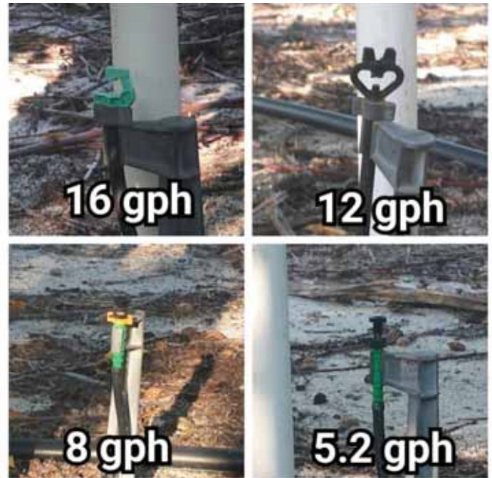
Figure 3. Examples of micro-sprinkler heads used for irrigation in peaches.

Peach trees in Florida are irrigated using micro-sprinklers, usually one emitter per tree. Several micro-sprinklers with different flow rates and irrigation coverage are available in the market (Figure 3). As a general rule, the micro-sprinkler should cover 50% or more of the area under the tree canopy. However, up to 80% irrigation efficiency can be achieved by a well-maintained and managed micro-sprinkler irrigation system (Haman et al. 2005). Growers in Florida commonly irrigate early in the morning to reduce losses due to evaporation or wind, with two or three irrigation events per week. Micro-sprinklers are also used for freeze protection, which has become a common practice for many growers as an alternative to the traditional overhead high-volume sprinklers that growers have to remove for pruning (Figure 4).