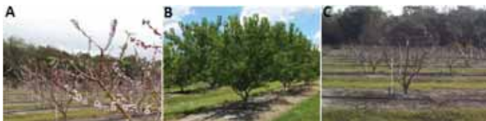
Figure 5. A) Peach trees flowering during spring; B) vegetative growth during late May–November; C) dormant trees during mid-December to early January.

During these months (mid-December to early January), irrigation is less critical than during the other two stages because the trees are without leaves and growth has stopped (Figure 5C). Crop evapotranspiration is at its lowest rate and soil water depletion of more than 50% of available soil water is acceptable.