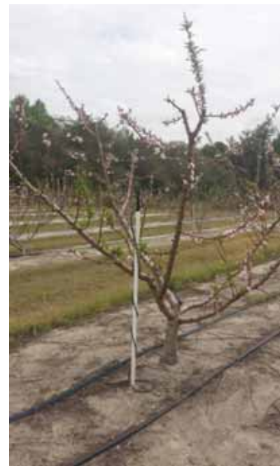
Figure 4. Micro-sprinkler irrigation system used for water supply and freeze protection.