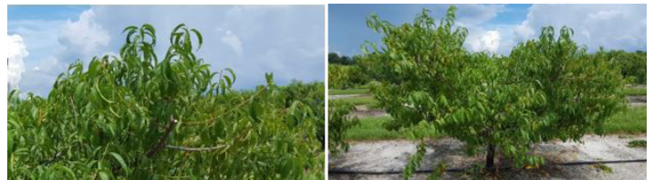
Figure 10. Manual lateral thinning.

Step 5: To keep the height lower, head back the main terminal shoots on many branches to remove apical dominance, usually to a lateral (Figure 10). Reduce the lateral branches by \frac{1}{3} as well if they are long.