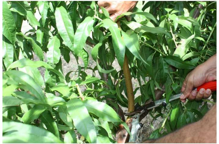
Figure 8. Remove strong water shoots in the center, while leaving weak lateral growth to protect scaffold sunburn.

Step 4: Head back (manually or mechanically) branches with excessive blind nodes, which are sections of branches with no growing buds or leaves (Figure 9). Remove some laterals if growth is excessive. Remove any dead branches as well.