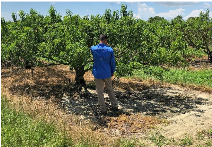
Figure 2. Ten-year-old peach tree 'UFSun' grown in Fort Pierce, Florida.

One of the goals of summer pruning is to bring the canopy size under control by encouraging a larger number of lateral branches growing along a greater span of the main scaffolds, effectively keeping the root-to-shoot balance intact on a smaller framework (Figure 2). This smaller framework favors efficient crop production because harvestable fruit is within arm's reach, thinning can be done from the ground, and spray treatments can have better coverage. Keeping the canopy size more compact will also reduce the need for ladders and allow harvesting from ground level, which improves picking efficiency. The amount of pruning required in winter is greatly reduced and pruning cuts in winter take longer to heal than cuts made on actively growing shoots in the summer. This lowers the overall incidence of disease infiltrating pruning cuts.