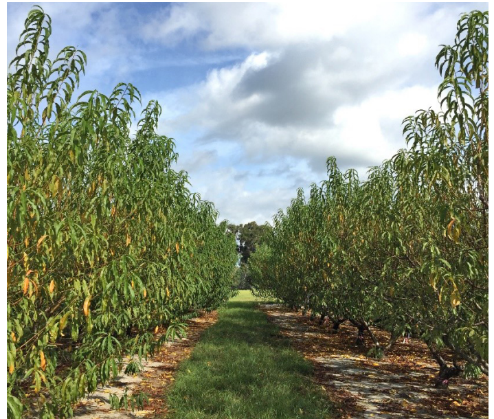
Figure 1. 'UFSun' peach cultivar growth after the harvesting period in June.

After the harvest season in any peach orchard, large or small, while daily picking may have ceased, the focus quickly shifts to how to manage the trees to support the subsequent year's crop. The strong apical dominance of peach trees will cause them to continuously put energy into upward growth, which ultimately shades out and hinders the development of fruiting wood in the lower portion of the canopy. Low-chill peach trees growing under Florida conditions can become vigorous and large. They have a short period of winter rest and a long growing season after the harvesting period, extending up to 200 days. Water sprouts also develop rapidly in the summer, causing denser vegetation and restricting airflow. Especially in subtropical peach-growing regions, summer pruning is a management strategy that can be applied to help restructure the canopy, direct the tree's resources into fruit production, and improve the efficiency of fieldwork. Without summer pruning, peach orchards in subtropical regions will continue to grow vigorously and, if left unmanaged, will reach a point at which ladders will be required to harvest and maintain the trees (Figure 1). Summer pruning can be a means of reducing overall tree size, redistributing fruiting wood for easier harvesting, reducing disease pressure, and increasing fruit quality.