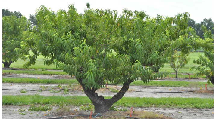
Figure 11. A finished example of summer-pruned peach tree 'Tropicbeauty' grown in Citra.