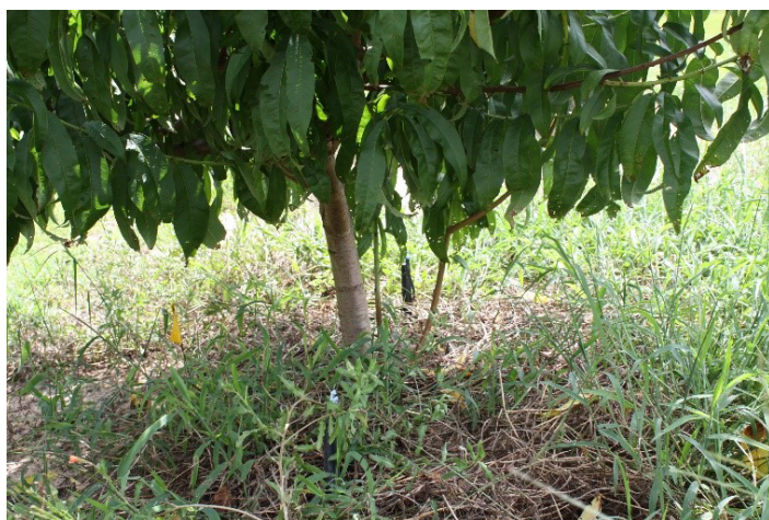
Figure 7. Remove all growth, including suckers, within two feet of the ground.

Step 3: Remove overly vigorous branches that are growing upright higher up where the main lateral branches split from the trunk in the center of the canopy. These branches are referred to as water shoots, which continue growing for much of the season when other lateral branches have slowed growth. Also, remove branches that are rubbing or crossing into the middle (Figure 8). Some smaller lateral branches should be left or cut in half to provide shade to the trunk to help prevent bark cracking by sunburn.