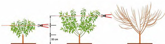
Figure 4. First manual topping is applied at about 40 inches (100 cm) above the soil. Center: Second manual topping is applied about 60 inches (150 cm) above the soil. Right: tree shape at the end of the first year.

Summer pruning is performed to favor branch induction of shoots through pinching or cutting the upper parts, sometimes multiple times in a year. The first manual (first-year) topping is implemented when the shoots exceed 40 inches (100 cm) from the soil. The second manual topping is done when the shoots exceed 60 inches (150 cm) from the soil (Figure 4). Mechanical topping is generally applied when the shoots exceed 7 feet (200 cm) from the soil, and manual pruning is done to thin the main branches down to four to five in number (Figure 5). However, it is highly recommended to leave some weak lateral growth in the inside of the canopy to protect limbs from sunburn.