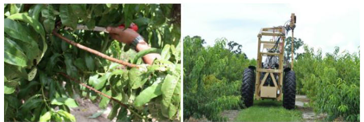
Figure 9. Prune back branches with excessive blind nodes to the growth point.

Step 5: To keep the height lower, head back the main terminal shoots on many branches to remove apical dominance, usually to a lateral (Figure 10). Reduce the lateral branches by \frac{1}{3} as well if they are long.