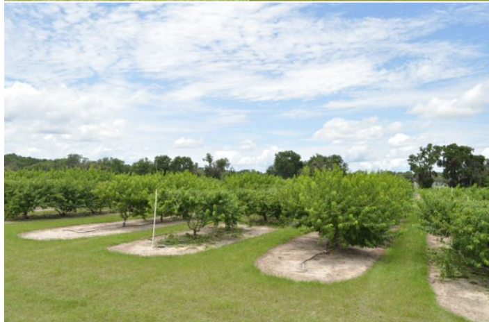
Figure 6. Top back the tree to a manageable height.