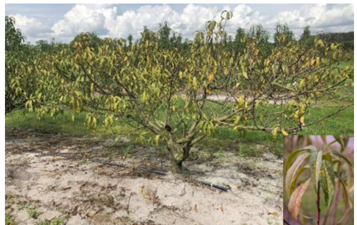
Figure 3. Peach tree 'UFSun' infected with peach rust.

Foliar diseases are more common during the summer when vegetative growth gets dense and causes increased humidity and decreased airflow. Peach rust ( Tranzchelia discolor ) is considered an important postharvest fungal foliar disease in the Florida climate, where summer rainfall provides favorable conditions for peach rust development (Figure 3). If not managed, this disease causes early defoliation with a significant negative impact on next season's flowers and fruit ( https://edis.ifas.ufl.edu/hs1263 ). All currently available peach cultivars in Florida are susceptible to the disease. Increased airflow associated with pruning will help reduce disease pressure. Altering the canopy structure this way can also improve the penetration of foliar sprays used to address disease or pest issues.