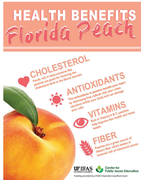
Figure 3. Health benefits of peaches.

Peaches are considered part of a healthful diet; they are high in micronutrients and fiber (1.9 grams for a small peach) while also being low in fat (.33 grams for a small peach) and sugar (10.9 grams for a small peach) (Food and Drug Administration [FDA], 2015; United States Department of Agriculture, Agricultural Research Service [USDA, ARS], 2016). Peaches contain several nutrients that support healthy lifestyles and diets, especially micronutrients such as hydroxycinnamates, procyanidins, flavonols, and anthocyanins (Tomás-Barberán et al., 2001). Peaches are also rich in potassium (247 milligrams for a small peach) as well as vitamins A (424 IU for a small peach) and C (8.6 milligrams for a small peach) and are cholesterol free (USDA, ARS, 2016). These nutrients, vitamins, and minerals have been shown to contribute to overall human health (Tomás-Barberán et al., 2001). Figure 3 highlights some of the health benefits of peaches.