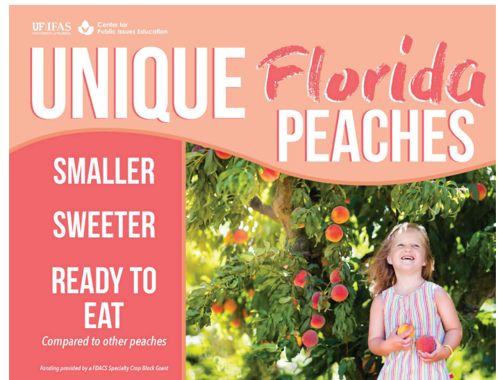
Figure 1. Florida peach characteristics.

leave you with recommendations to keep your Florida peaches fresh as long as possible.