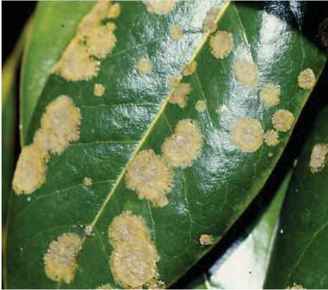
Algal leaf spot of magnolia ( Magnolia grandiflora ) in Kurtistown, Hawai'i caused by Cephaleuros virescens

as well some citrus ( Citrus spp.) cultivars. Cephaleuros species do not affect certain key subsistence crops in the Pacific, such as banana ( Musa spp.) and taro ( Colocasia esculenta ), although coconut and breadfruit are hosts for leaf spots.