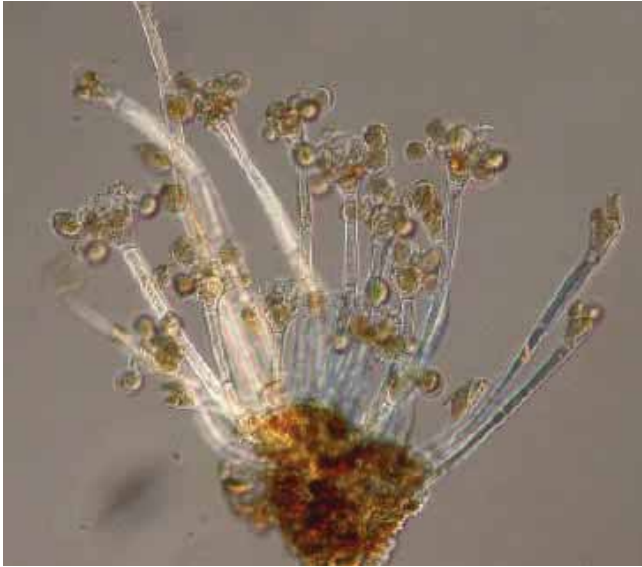
Cephaleuros parasiticus thallus and sporangiophores. Upon making a slide mount in a drop of water, zoospores may be released immediately (Photo: Fred Brooks, from material collected in American Samoa.)