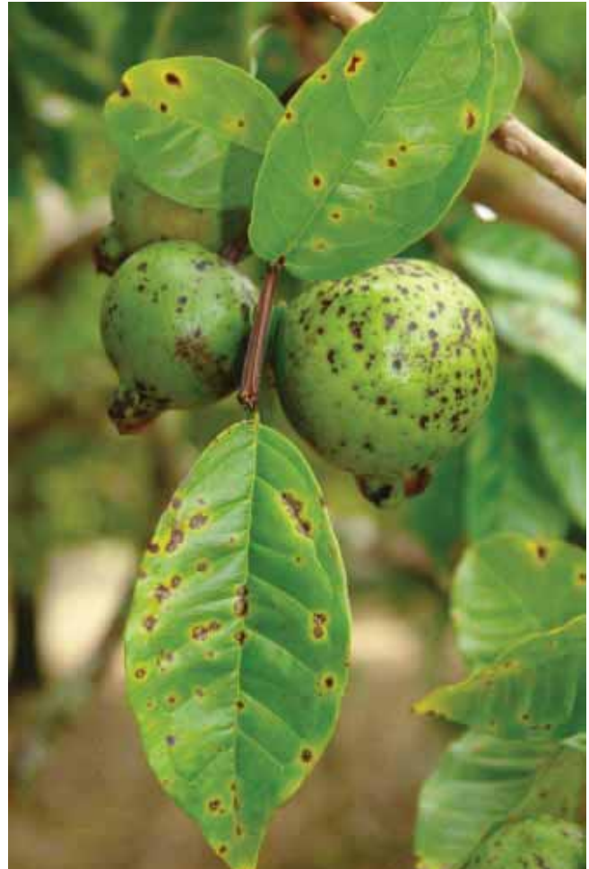
Algal leaf and fruit spot of guava caused by Cephaleuros parasiticus

Hosts are inoculated when sporangia or thallus fragments with sporangia are deposited on susceptible host tissues. Infection occurs and symptoms develop under moist conditions when motile zoospores are released from