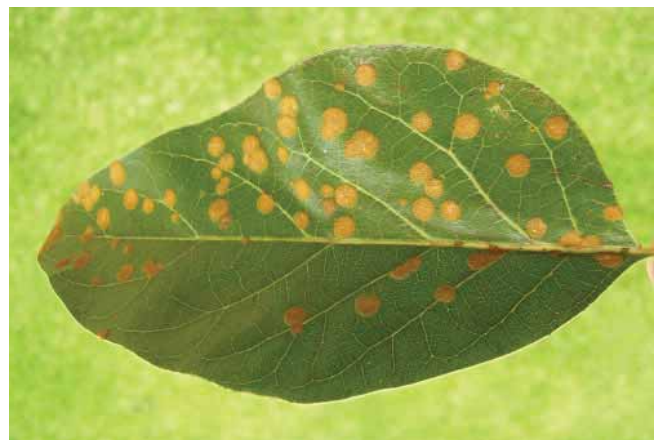
Algal leaf spot of avocado ( Persea americana ) in Hilo, Hawai'i, caused by Cephaleuros virescens

The disease is called algal leaf spot, algal fruit spot, and green scurf; Cephaleuros infections on tea and coffee plants have been called "red rust." These are aerophilic, filamentous green algae. Although aerophilic and terrestrial, they require a film of water to complete their life cycles. The genus Cephaleuros is a member of the Trentepohliales and a unique order, Chlorophyta, which contains the photosynthetic organisms known as green algae.