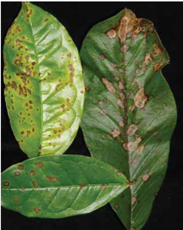
Guava cultivars may express symptoms differently. Here, leaves of three Psidium cultivars growing in a UH-CTAHR collection in the Hilo area display their unique reactions to association with Cephaleuros parasiticus .

Finding a number of different algal species on a leaf is common in shaded, moist environments. Most of the algae are not parasitic on plants. If you can easily rub off algae with your fingers, they are probably not plant parasitic.