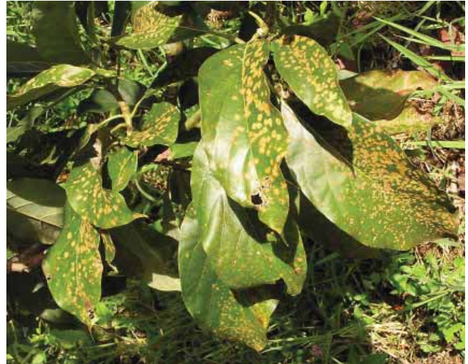
Typical raised, velvety, coppery brown algal spots on leaves of avocado ( Persea americana ) caused by Cephaleuros virescens . The spots consist of the brightly pigmented thallus of the plant parasitic algae.

Most fruit damage from Cephaleuros in Hawai'i probably occurs on guava and is associated with C. parasiticus . The damage to guava fruits is limited to the