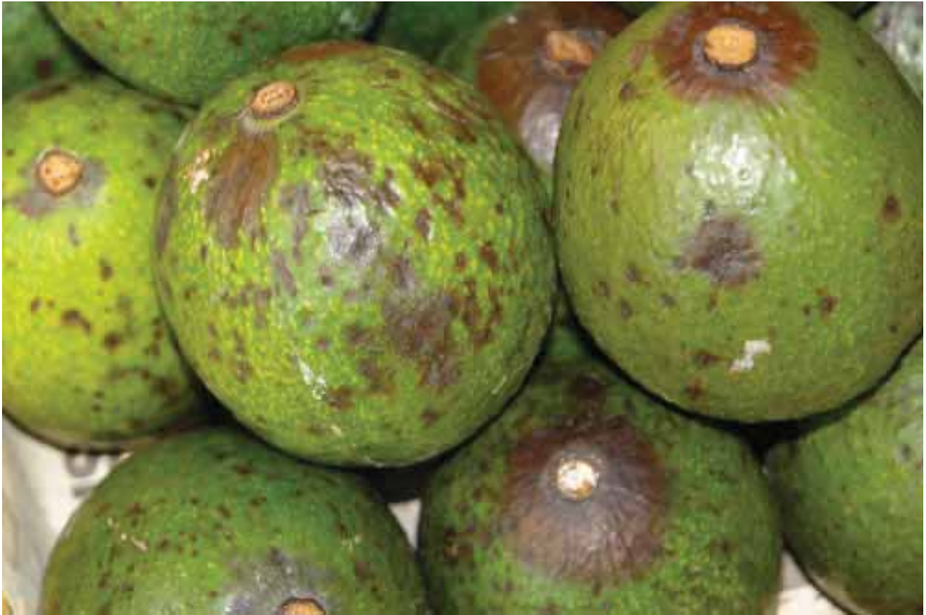
Anthracnose lesions on ripening avocado fruits in a farmer's roadside fruit stand near Kailua-Kona on Hawai'i. Plant-pathogenic fungi other than C. gloeosporioides can cause the stem-end rot symptoms shown here.

West Indian types) or thick, warty, and hard (Guatemalan types). The edible fruit flesh varies in fibrousness, color (greenish to yellowish), oil content, and flavor (mild and watery to rich and nutty). The avocado center of origin is Meso-America. Archaeological evidence indicates that humans have cultivated the avocado for at least 10,000 years. However, commercial development of avocado as a crop did not begin until the 20th century, following introduction of avocado plants to California.