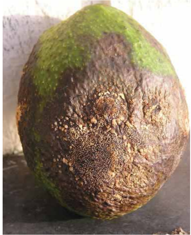
Large avocado anthracnose lesions; the fruit at right has masses of salmon-colored spores typical of the pathogen, C. gloeosporioides

The site of infection is primarily the fruits, but infections may also appear on leaves and stems. Unlike the form of anthracnose that infects mango, C. gloeosporioides does not attack avocado flowers.