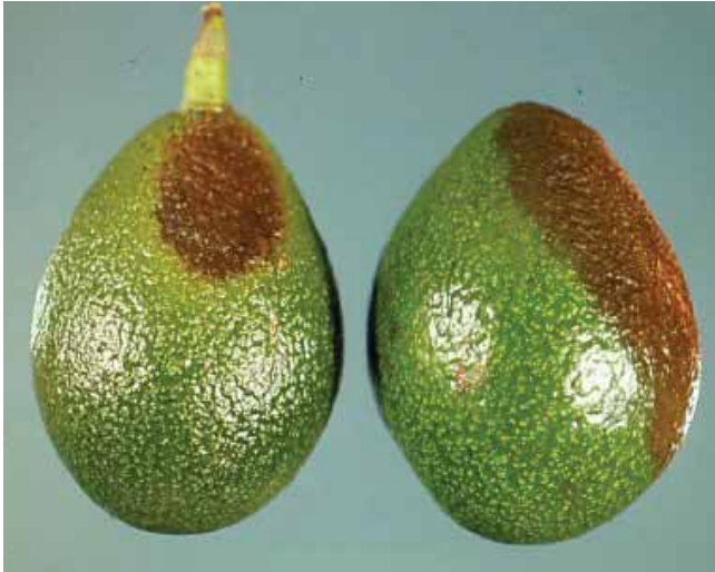
Anthracnose lesions on avocado