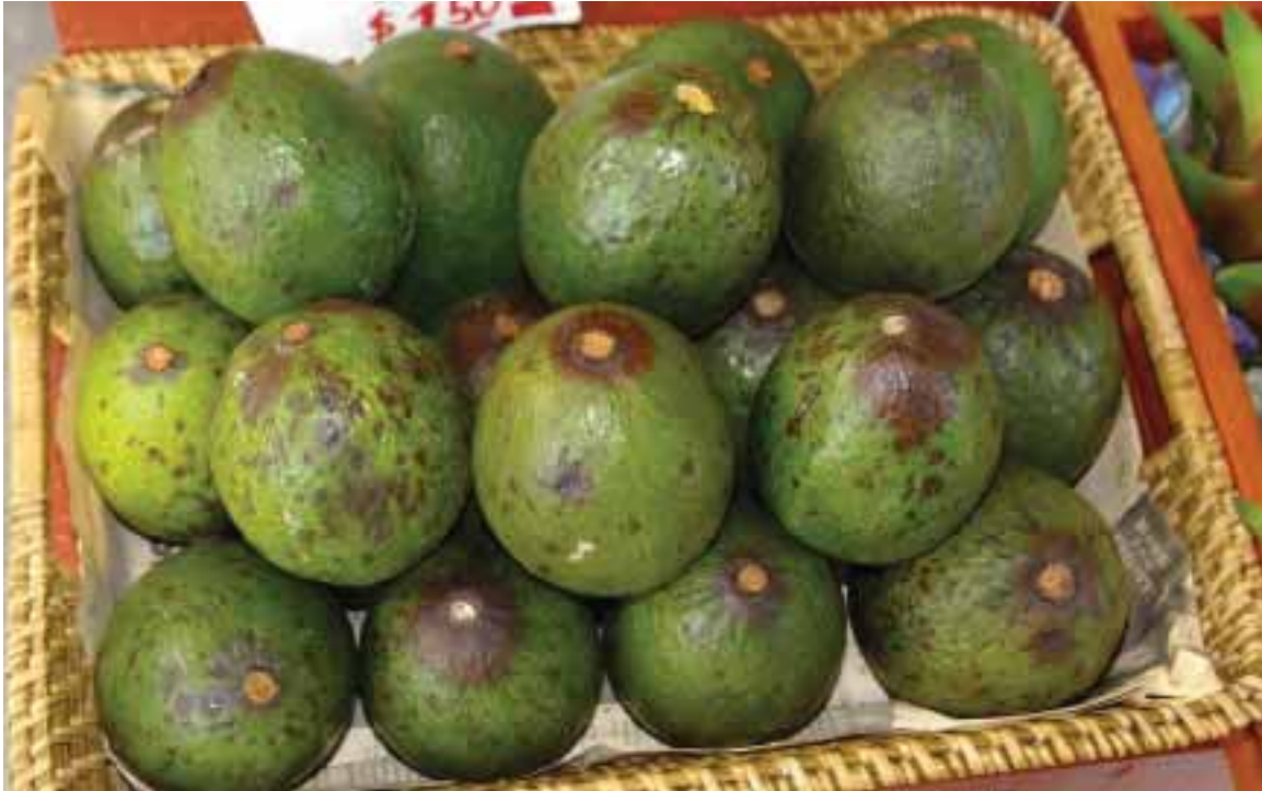
Spots and stem-end rots typical of anthracnose in a farmer's market near Kailua-Kona

pounds present in unripe skin usually inhibit pathogen growth. During and after fruit ripening, the pathogen grows rapidly through the peel and into the pulp of fruits.