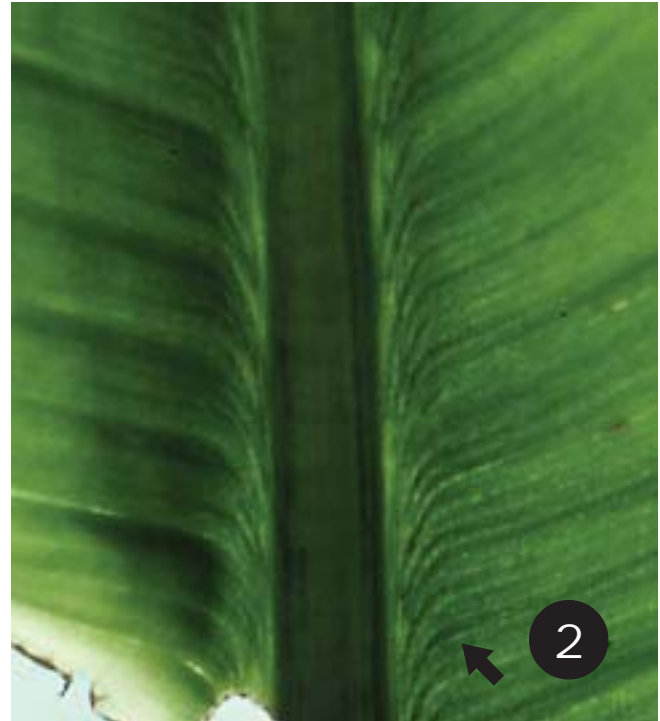
The “hooking” symptom of BBTV, where the veins of the leaf blade extend into the normally clear area along the leaf midrib and point down toward the base of the leaf.

Control methods used are likely to vary depending on whether you are a homeowner or a commercial banana grower. Commercial growers may prefer to use pesticides and are usually knowledgeable about their proper use, while homeowners may prefer not to use pesticides.