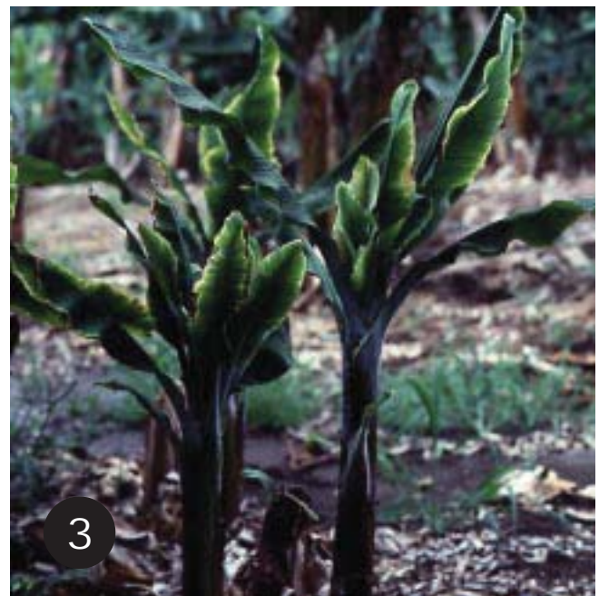
Young banana plants showing advanced symptoms of BBTV, including yellowed leaf margins and narrow, stiff, erect leaves “bunched” together at the top of the stem.

Aphids can be killed by spraying them with soapy water, and some insecticidal soaps are legally registered as pesticides. Insecticidal soaps have the advantage of being relatively non-toxic to people, birds, and other animals. The spray solution should be directed to the places where the aphids are most likely to be hiding or feeding. This includes the leaf petioles and the “pockets” where the petioles separate from the pseudostem. In particular, aphids can be found feeding on young suckers and down inside the whorl of the latest, unfurled leaf. After spraying the aphids, do not disturb the plant until the next day.