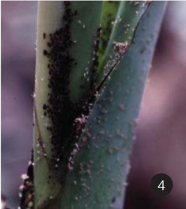
Aphids congregate and feed on the unfurled leaves of young banana plants.