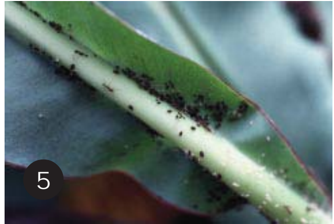
Aphids and ants, which tend them, on the petiole and lamina of the underside of of a young banana plant leaf.

Several commercial insecticidal soaps are registered for use in Hawaii. Consult your local garden shop for suitable products. In many situations, home-mixed soap sprays may be as effective as the commercial products, but they may contain additives toxic to plants. In addition, these home remedies are not legally registered as pesticides.