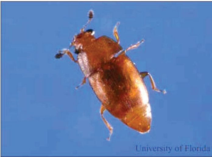
Figure 3. A yellowbrown sap beetle, Epuraea luteolus (Erichson), collected on strawberry.