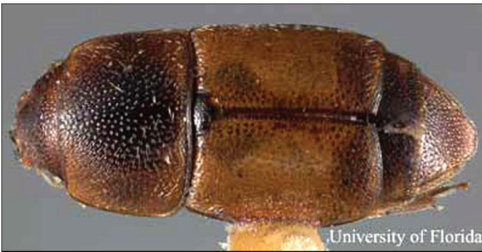
Figure 4. Adult Carpophilus fumatus Boheman, collected on strawberry.