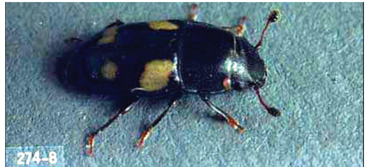
Figure 1. Adult Glischrochilus quadrisignatus (Say), a picnic beetle.

numbers of sap beetles on a host plant can prove economic in terms of crop damage caused by the feeding beetles, but impact on crop value is primarily due to the contamination of products ready for sale by adults and larvae. In addition to damage caused by feeding, sap beetles have also been recognized as vectors of fungi (Dowd 1991).