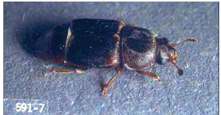
Figure 5. Adult Carpophilus lugubris Murray, the dusky sap beetle.

The dusky sap beetle adult, Carpophilus lugubris , is about 2.8 mm long with short elytra. The adult is uniform dull black in color.