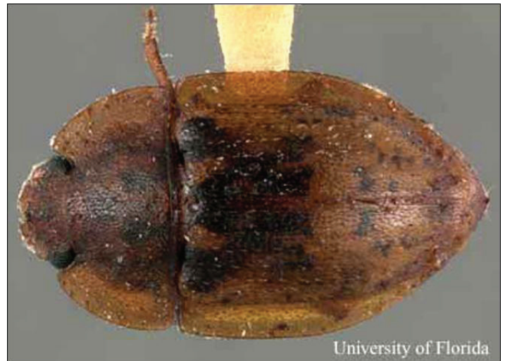
Figure 11. Pinned adult Lobiopa insularis (Cast.), collected on strawberry.