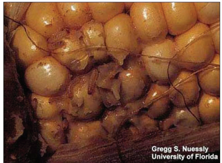
Figure 9. Sap beetle ( Carpophilus spp.) larvae feeding at base of sweet corn ear. Note legs and light brown head on larvae as opposed to the maggot shape of cornsilk fly larvae (next figure). http://entnemdept.ufl.edu/creatures/field/cornsilk_fly.htm

Credits: Gregg S. Nuessly, University of Florida