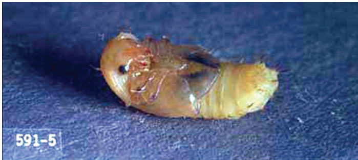
Figure 7. Pupa of Carpophilus lugubris Murray, the dusky sap beetle.

Pupae are white, turning cream colored and later tan before adult emergence. The pupa is typical exarate (furrowed) averaging 4.4 mm in length and 2.0 mm in width (Parsons 1943).