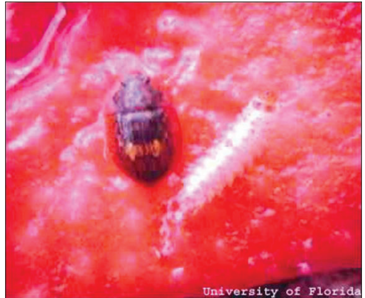
Figure 10. Adult (left) and larva (right) of the large sap beetle (picnic beetle, nitidulid) Lobiopa insularis .

Stelidota geminata , the strawberry sap beetle, migrates each spring from overwintering sites. Temperature plays a key role in regulating spring migration of Stelidota geminata (Gertz 1968, Weiss 1979). First generation beetles develop in the strawberry fields. Dowd and Nelson (1994) reported early migration peaks in both raspberry and corn at the end of the strawberry season which may indicate that these sites are utilized by the beetle for over-wintering. Stelidota geminata was not found to overwinter in strawberry plantings. However, Lobiopa insularis (Cast.) is the most frequently observed sap beetle in Florida strawberries (Price 2004), although several other smaller species inhabit the fields.