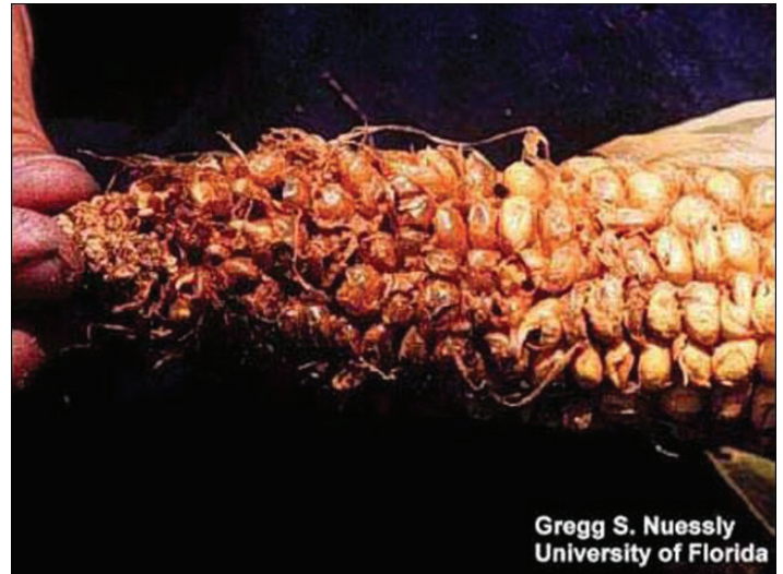
Figure 13. Sap beetle ( Carpophilus spp.) larval and adult damage to entire sweet corn ear.

varieties of corn, Bt corn and non- Bt hybrid corn. Dowd's study showed that direct damage can be induced by dusky sap beetles. In Ohio, the strawberry sap beetle attacks ripe, nearly ripe, or decaying strawberry fruit by boring into the berry and devouring a portion in the field. In the Florida study (Potter 1995) Epuraea luteolus apparently feeds on decomposing fruit material. The study however did not demonstrate the economic impact, if any, on strawberry fruit production. The presence of Epuraealuteolus on strawberry fruit may be more of an issue of contamination by beetles and possibly larvae.