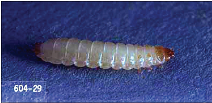
Figure 6. Larva of Carpophilus lugubris Murray, the dusky sap beetle.

equipped with hardened projections from the end of the abdomen that are species specific.