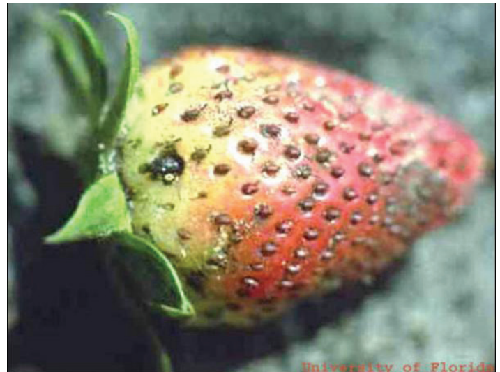
Figure 14. Sap beetle feeding on strawberry.

Sap beetles can also vector mycotoxin producing fungi to corn and strawberries (Dowd and Nelson 1994). Maize sap beetles appear to be well adapted for vectoring mycotoxigenic fungi, including species in the genera Aspergillus ,