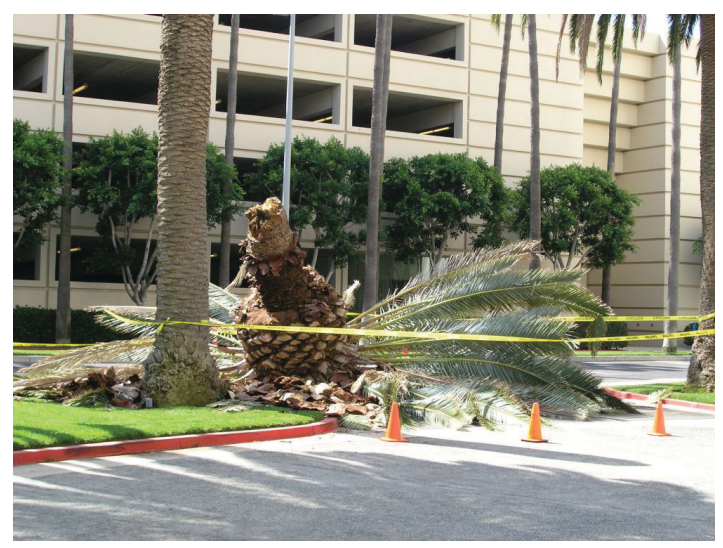
Figure 3. The canopy of this Phoenix canariensis fell off of the trunk due to Thielaviopsis trunk rot.

In the situation where the canopy falls off the trunk, the rot occurs below the bud at the base of the canopy in the woody tissue. This is also an area with little, if any, lignified plant tissue. When the trunk rot is farther down the trunk, this means that the fungus has rotted the trunk tissue until the palm can no longer structurally support itself. Examination of a cross-section through a diseased trunk illustrates that the rot is located only on one side of the trunk (Figures 4 and 5). This is in contrast to Ganoderma butt rot, in which the fungus is at the trunk base and rots from the center of the trunk to the outside. Ganoderma butt rot is discussed at http://edis.ifas.ufl.edu/pp100.