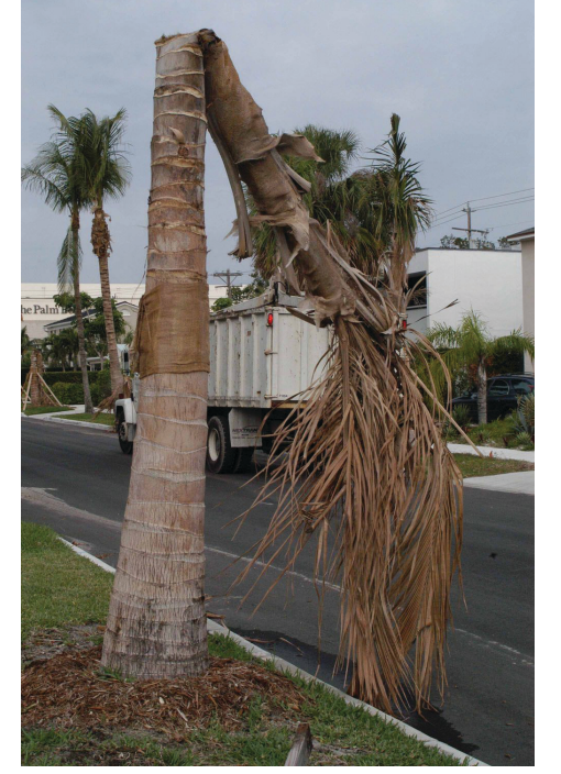
Figure 2. Cocos nucifera trunk collapsed upon itself due to Thielaviopsis trunk rot.