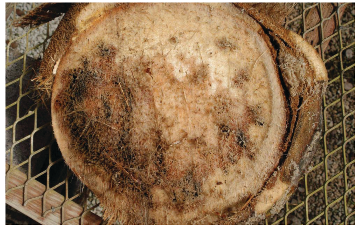
Figure 5. Cross-section of Cocos nucifera trunk illustrating that the rot caused by Thielaviopsis paradoxa occurs on only one side of the trunk and moves from the outside to the inside of the trunk.

Stem bleeding is a common symptom of Thielaviopsis trunk rot observed on Cocos nucifera (coconut). This stem bleeding is a reddish-brown or brown or black stain that runs down the trunk from the point of infection (Figure 6). Since any trunk wound may result in stem bleeding, close examination of the point of infection is required. If the stem bleeding is due to Thielaviopsis paradoxa and the disease has progressed significantly, the tissue immediately surrounding the wound (infection point) will be quite soft in comparison to surrounding trunk tissue. You will be able to push your finger past the pseudobark and into the truck tissue. Palms other than coconuts, especially those with a smooth trunk, may also exhibit stem bleeding, but it seems to be most common in coconut. Eventually, the trunk will collapse on itself at the point of infection. Because the fungus cannot degrade lignin, the trunk fibers are left nearly intact, while the tissue surrounding the fibers is degraded, resulting in "stringy" black tissue (Figure 7).