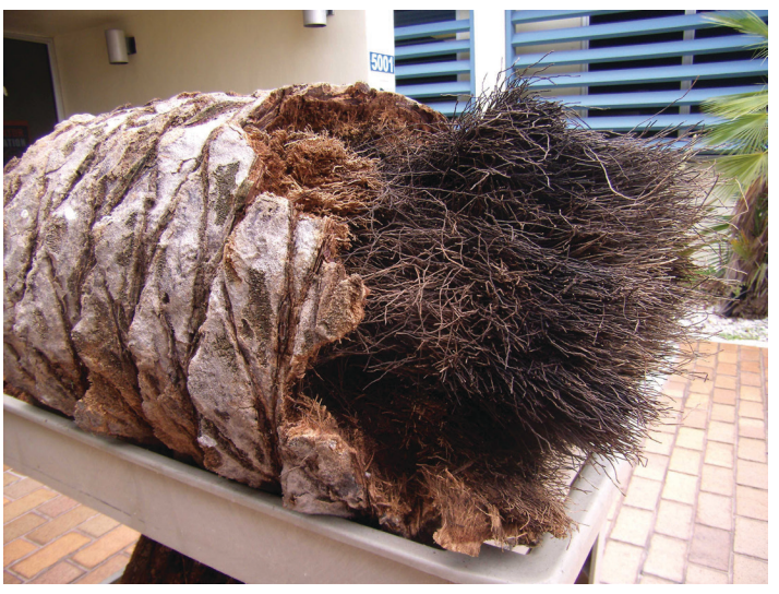
Figure 7. The only tissues remaining in this Phoenix dactylifera trunk section are the fibers (strings). The fungus has degraded the rest of the trunk tissue.