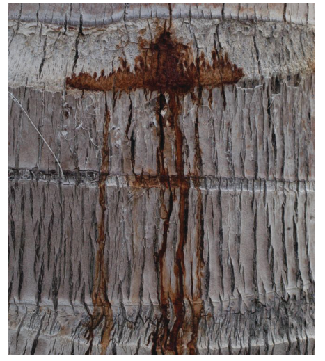
Figure 6. Stem bleeding on a Cocos nucifera due to infection from Thielaviopsis paradoxa .

Stem bleeding is a common symptom of Thielaviopsis trunk rot observed on Cocos nucifera (coconut). This stem bleeding is a reddish-brown or brown or black stain that runs down the trunk from the point of infection (Figure 6). Since any trunk wound may result in stem bleeding, close examination of the point of infection is required. If the stem bleeding is due to Thielaviopsis paradoxa and the disease has progressed significantly, the tissue immediately surrounding the wound (infection point) will be quite soft in comparison to surrounding trunk tissue. You will be able to push your finger past the pseudobark and into the truck tissue. Palms other than coconuts, especially those with a smooth trunk, may also exhibit stem bleeding, but it seems to be most common in coconut. Eventually, the trunk will collapse on itself at the point of infection. Because the fungus cannot degrade lignin, the trunk fibers are left nearly intact, while the tissue surrounding the fibers is degraded, resulting in "stringy" black tissue (Figure 7).