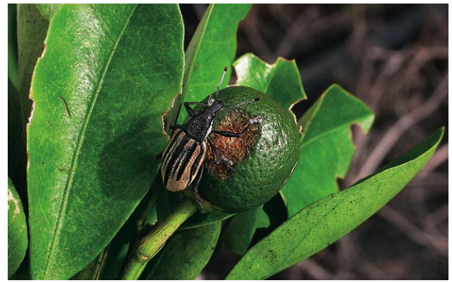
Figure 12. Citrus fruit feeding.