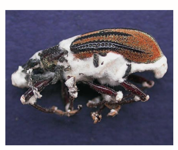
Figure 24. Adult Diaprepes killed by fungi.

In field trials, the entomopathogenic fungus Beauveria bassiana applied as a soil drench killed larvae and newly emerging adult root weevils (fig. 24), but the fungus had limited persistence in the soil