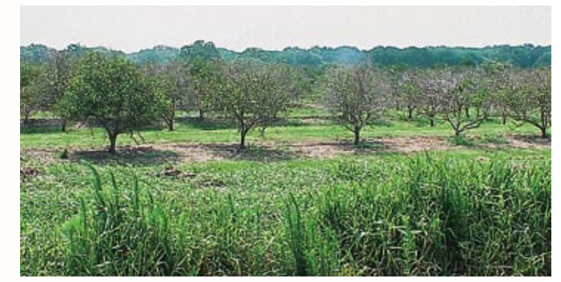
Figure 18. Citrus trees declining due to a heavy infestation of Diaprepes root weevil in Osceola County, Florida.

resistance or tolerance to feeding by Diaprepes root weevil larvae. Many citrus trees do not show symptoms of decline (e.g., leaf yellowing, wilting, defoliation, etc.) until extensive damage has been done to the root system (fig. 18). Damage is particularly serious in groves where trees are planted in poorly drained soils that