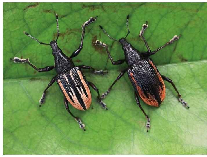
Figure 1. Diaprepes root weevil adults vary in color and striations.

Diaprepes root weevil feeds on more than 270 species of plants from 59 plant families (Simpson et al. 1996). Some of the more common hosts are citrus (all varieties), peanut, sorghum, guinea corn, corn, Surinam cherry, dragon tree, sweet potato, sugarcane, panicum grasses, coffee weed (sesbania), and Brazilian pepper. Because of its broad host range, the Diaprepes root weevil poses a great threat to citrus and ornamental plant industries in California.