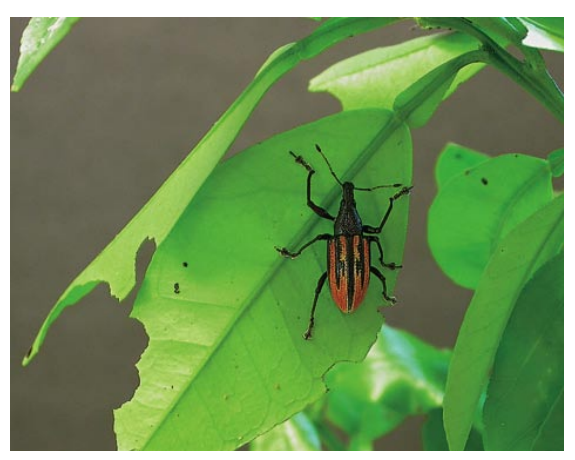
Figure 19. Inspect notched leaves, such as the citrus leaves shown here, for the presence of Diaprepes adults.