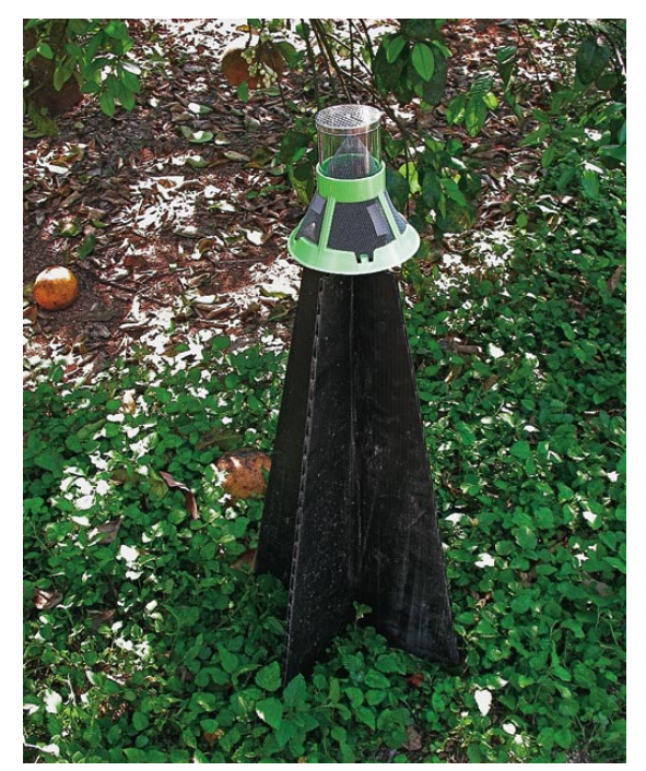
Figure 21. A Tedders ground trap captures adults as they emerge from pupating in the soil.

are optimal for larval development (McCoy 1999). The feeding activity of the larvae may also make the plant more susceptible to root rot organisms such as Phytophthora spp. (Graham et al. 2002).