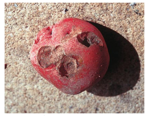
Figure 15. Larval feeding on potato.