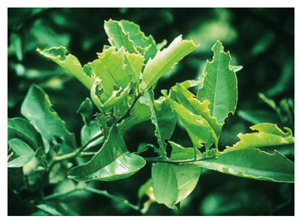
Figure 8. Citrus leaf feeding by Diaprepes adults.