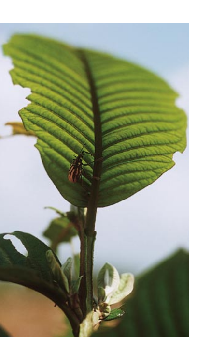
Figure 10. Guava leaf feeding.