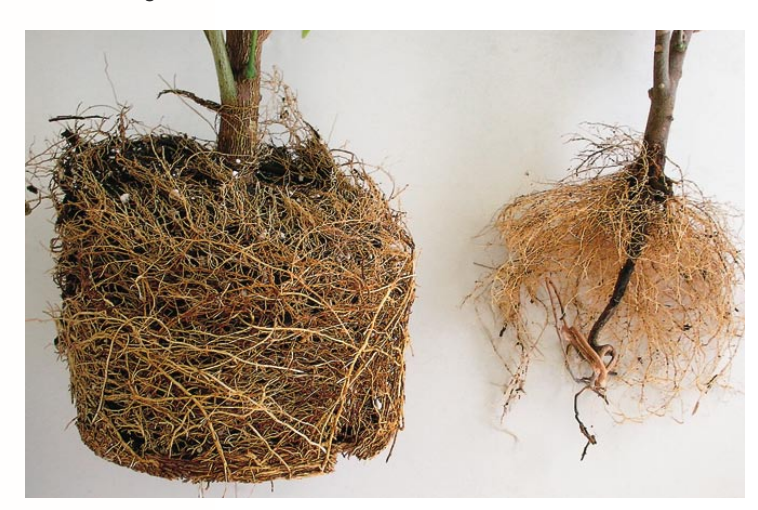
Figure 16. Loss of root hairs due to Diaprepes feeding (right), compared with normal roots (left).