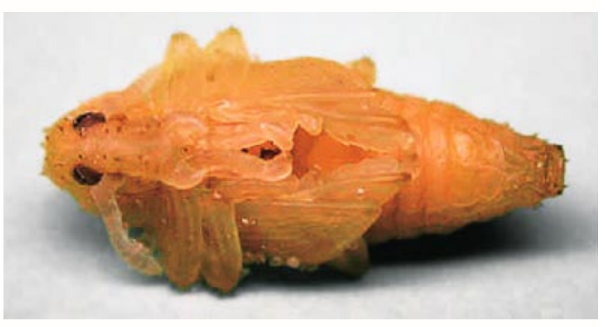
Figure 7. The pupal stage of Diaprepes can be found in the soil.

Adult weevils are capable of strong flight for a short duration and distance. Once the weevils land, they tend to stay on that