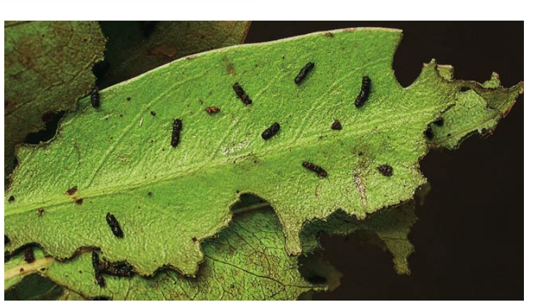
Figure 13. Frass (excrement) left behind by feeding adults.