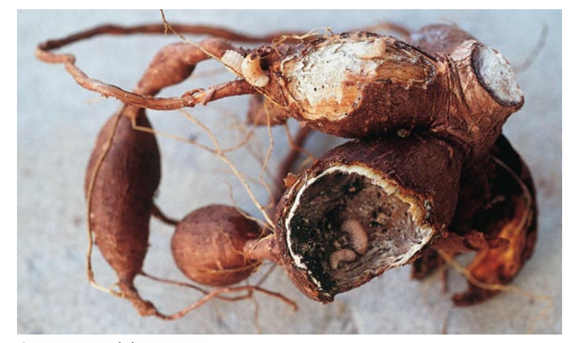
Figure 14. Larval damage to cassava root.