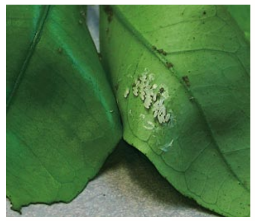
Figure 4. Cluster of Diaprepes eggs deposited between leaves.