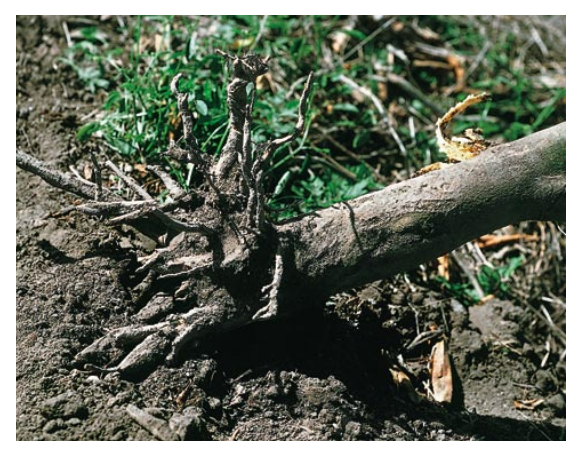
Figure 17. Eventually, Diaprepes may girdle the crown of citrus.