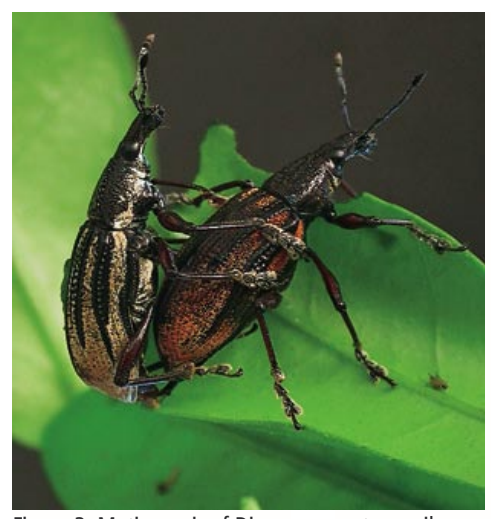
Figure 3. Mating pair of Diaprepes root weevils.