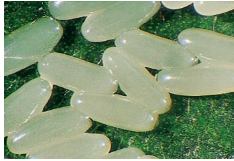
Figure 5. Diaprepes eggs are slightly over 0.04 inch (1 mm) long.