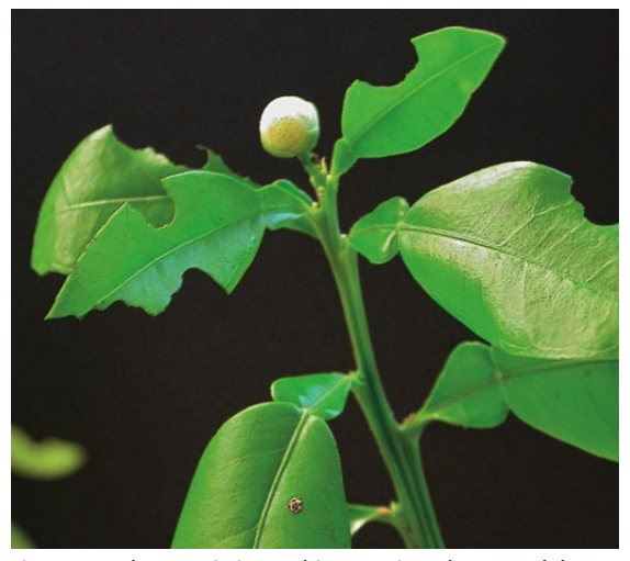
Figure 20. Characteristic notching on citrus leaves. Adults may hide in sheltered parts of the plant during the day.