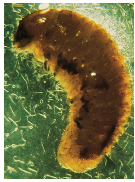
Figure 23. Diaprepes larva killed by nematodes.

2001 (Hall et al. 2001). Two of the parasites, Aprostocetus vaquitarum (fig. 22) and Quadrastichus haitiensis , have become established. The levels of parasitism in southern Florida range from 70 to 80 percent. However, in central Florida, parasitism is only 5 percent. This variability may be due to differences in winter temperature or differences in application of various pesticides.