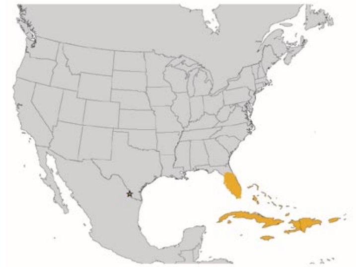
Figure 2. Current distribution of Diaprepes root weevil. Note population in South Texas.