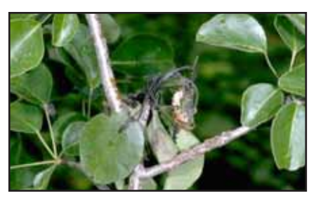
Figure 3. Flower clusters infected with fire blight bacteria.

son, giving the tree a scorched appearance, hence the name "fire blight." Infections can extend into scaffold limbs, trunks, or root systems and can kill highly susceptible hosts. Less susceptible varieties might be severely disfigured. Once infected, the plant will harbor the pathogen indefinitely.