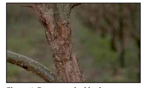
Figure 6. Brown cracked bark covers an overwintering fire blight canker.

into the wood surrounding overwintered cankers that have become active in spring. If the bark is cut away from the edge of an active canker, reddish flecking can be seen in the wood adjacent to the canker margin. This flecking represents new infections the bacteria cause as they invade healthy wood. As the canker expands, the infected wood dies, turns brown, and dries out; areas of dead tissue become sunken, and cracks often develop in the bark at the edges of the canker (Fig. 6). The pathogen