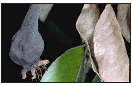
Figure 2. Blackened fruit is typical of fire blight infection.