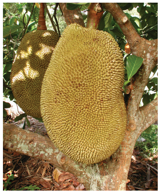
Figure 5. 'Black Gold' jackfruit.