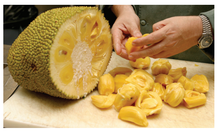
Figure 1. Cleaning a ripe jackfruit.

Importance: Jackfruit is important in India and other Asian countries like Sri Lanka, southern China, Malaysia, and Myanmar. There is limited production in Australia, Mauritius, Brazil, Surinam, Jamaica, Mexico, Hawaii, and south Florida.