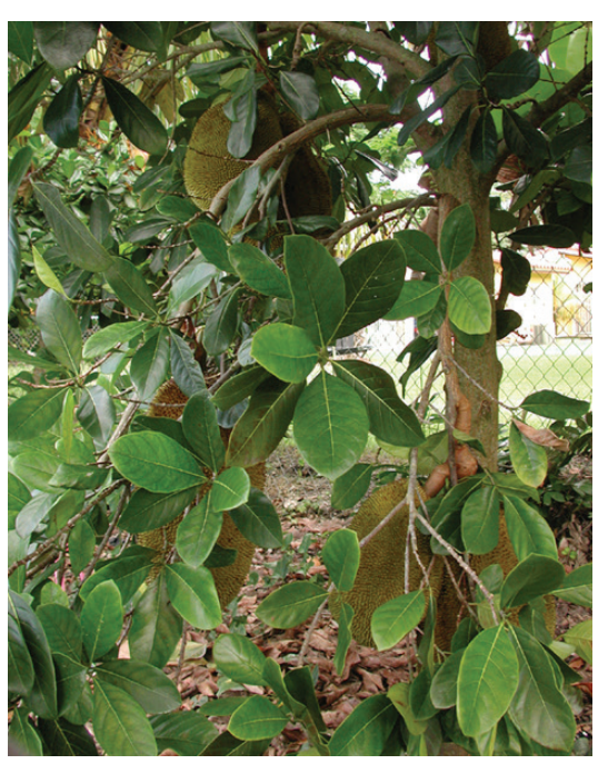
Figure 3. Jackfruit leaves.

Fruit. The jackfruit is a multiple fruit i.e., composed of the coherence of multiple flowers (Figures 1 and 5). Fruit is moderately large to very large, weighing from 10 to 60 pounds (4.5–27.3 kg). A few cultivars are small fruited, weighing 3 to 10 pounds (1.4–4.5 kg) each. The skin is extremely rough and thick. Fruit skin color is green when immature and green, greenish-yellow to brownish-yellow when ripe. The inside of the fruit contains the edible, sweet, aromatic, crispy, soft, or melting pulp that surrounds each seed. Between the seeds and edible pulp is the inedible "rag". Pulp color varies from amber to yellow, dark yellow,