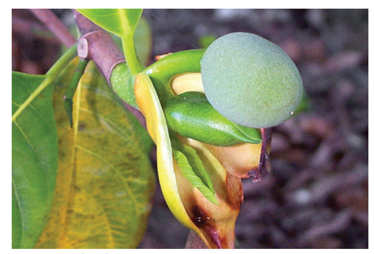
Figure 4. Jackfruit flowers.

Season of bearing. The main fruiting season is in summer and fall. Some fruit may ripen at other times, but usually not in winter and early spring.