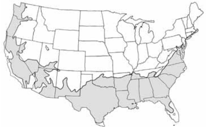
Figure 2. Range

Availability: somewhat available, may have to go out of the region to find the tree