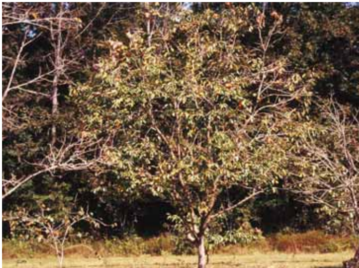
Figure 1. Young Diospyros kaki : Japanese persimmon

Japanese persimmon is a species related to common persimmon ( Diospyros virginiana ), but is native to Asia (China, Japan). It can grow to about 30 feet when mature. This is an excellent fruit tree for ornamental use and makes an excellent specimen. The tree is a sight to behold when leaves have fallen in autumn, displaying the bright yellow-orange fruits throughout the canopy. Similar to common persimmon, its preference is for a moist, well-drained soil in full sun locations. The tree has good drought tolerance. Japanese persimmon develops an attractive red fall color, but the 2- to 4-inch-diameter fruits can be a big mess when they fall from the tree.