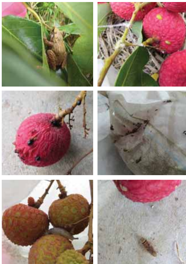
Various creatures living in or on or visiting bagged lychee fruit.

Survey participants were also provided with the average wholesale price of lychee from 2006 to 2008 (NASS 2009) of $2.84 per pound and were asked to select the highest price per pound that they would pay for bagged and for unbagged lychee following the visual and taste section of the survey. On average, participants stated that they would pay $3.47 per pound for bagged fruit and slightly less ($3.39 per pound) for unbagged fruit. According to previous research conducted by Ken Love (2008), bagged lychee fetched $3.50/lb. and unbagged fruit received $2.75/lb.