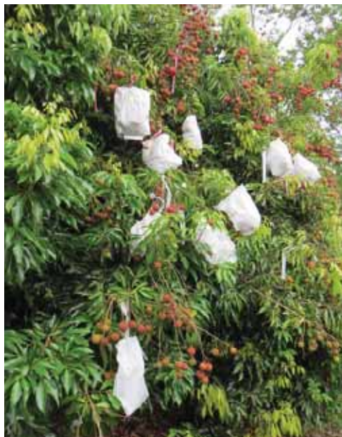
Lychee fruit can be protected from birds and insect pests with bagging, allowing for more delectable fruit for human consumption.

During development, lychee fruit are affected by several major pests including moths ( Cryptophlebia spp.), fruit