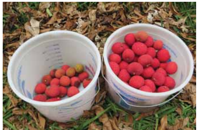
These buckets contain harvests from thirty unbagged (left) panicles and thirty bagged (right) panicles. A much greater amount of fruit was harvested from bagged panicles.