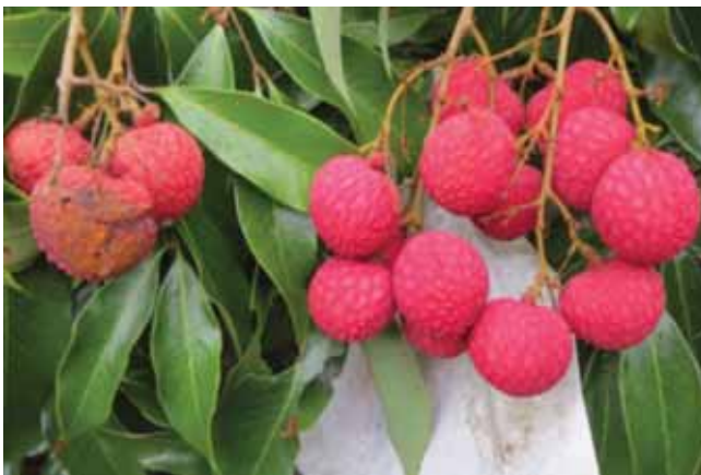
Unbagged (left) panicle and bagged (right) panicle of similar age just before harvesting.

With proper field management and a purchase price of $2.50/lb, there is potential to earn $173 per tree or $8,484 per acre with bagging compared to $69 per tree and $3,372 per acre for unbagged lychee. At $6.00/lb, growers can achieve upwards of $613 per tree or $30,026 an acre. By bagging their lychee fruit, growers can gain an estimated 2.5 to over 3 times more in returns at the stated