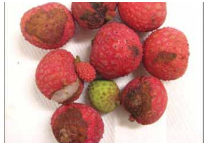
Examples of culled fruit.

Conventional harvesting of lychee requires a picker to scour trees for the ripest individual fruits or clusters