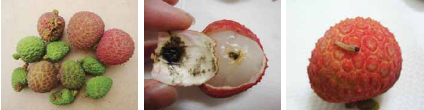
Left: Immature and mature fruit with telltale signs of Cryptophlebia spp. caterpillar frass. Middle: Damage on the skin and flesh caused by Cryptophlebia spp. Right: Early instar of Cryptophlebia spp. Below: Mediterranean fruit fly. Inset photo: fruit fly eggs deposited in lychee fruit flesh.

positor, the pointy tip on her abdomen. This allows for deterioration of the fruit flesh and the introduction of bacteria and fungi into the wound. Fruit fly-stung fruits tend to ooze, bubble, and froth at the puncture site. According to Jones et al. (n.d.), lychee is a poor host for fruit fly, and very few to low numbers of adults are recovered from efforts to rear out larvae in lychee. Nonetheless, fruit flies do cause damage to lychee fruit.