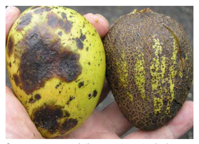
On common mango and other mango types, two basic symptom types for mango anthracnose are sunken black lesions (above, left) or the "tear stain" effect (above right and below, left), linear necrotic regions lending an alligator-skin effect, often associated with cracking of the epidermis (below).