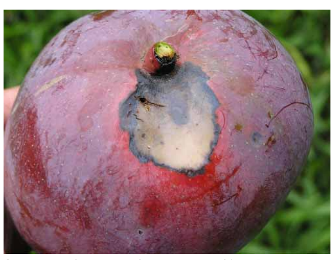
Symptoms of mango anthracnose on cultivar 'Rapoza': tancolored centers and blackened margins.