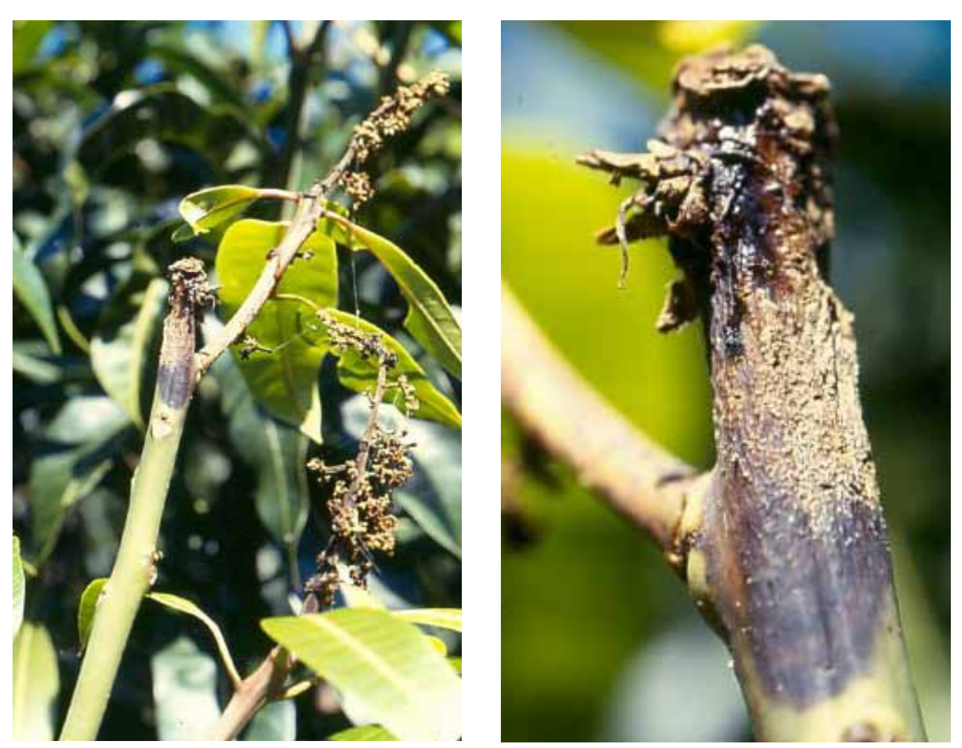
Stem, branch, and twig symptoms. Twig dieback occurs when severe, elongated, blackened lesions form on stems and twigs die back apically. In these photos, abundant sporulation of the pathogen covers the most decomposed points of the infection.

but off-season flowering is common. Growers may have to use fungicide sprays to control anthracnose and/or powdery mildew on these varieties in some locations.