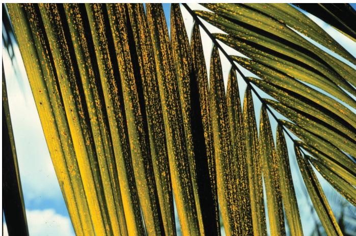
Figure 3. Potassium-deficient older leaf of Dictyosperma alba (hurricane palm) showing translucent yellow-orange spotting.

Magnesium deficiency may occur on palms held for long periods of time in the same container, since the dolomite incorporated into the potting substrate initially is usually exhausted after about six months. It will also be seen on palms growing in substrates to which insufficient dolomite has been added. Symptoms of Mg deficiency are most severe on the oldest leaves and appear as broad yellow bands along the periphery of the entire leaf, or in some fan palms, around each leaflet (Figures 5 and 6). In all cases,