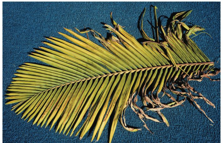
Figure 10. Manganese-deficient new leaf of Archontophoenix alexandrae showing most severe symptoms towards the leaf base.