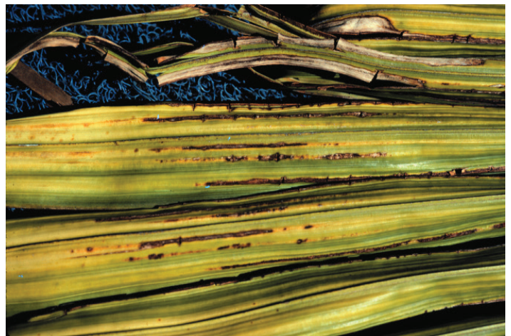
Figure 9. Leaflets on youngest leaf of Archontophoenix alexandrae (Alexandra palm) showing longitudinal necrosis.