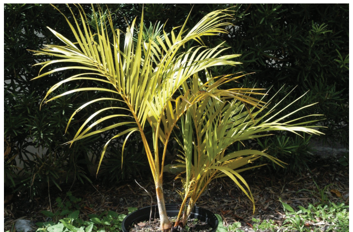
Figure 1. Nitrogen-deficient container-grown Dypsis lutescens (areca palm) showing typical discolored leaflets and golden petioles and leaf bases.

Nitrogen deficiency symptoms in palms begin first on the oldest leaves as a uniform light green coloration. The golden-colored petioles and leaf bases commonly observed on container-grown Dypsis lutescens are caused by N deficiency (Figure 1). As symptoms progress, the entire canopy except for the spear leaf becomes uniformly chlorotic (sometimes nearly white in color) and growth rate is reduced sharply (Figure 2). Palms can linger in a chronic N-deficient state for some time.