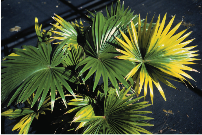
Figure 6. Magnesium deficiency in Livistona rotundifolia showing broad yellow bands around the periphery of entire leaves.

Symptoms of Fe deficiency occur only on the youngest leaves, but in a chronic state, the entire palm crown may be chlorotic. Newly emerging Fe-deficient leaves are either uniformly yellow-green to nearly white, or may have slightly greener veins (Figure 7). In a few species, such as Syagrus romanzoffiana , Rhapis spp., and some Licuala spp., these chlorotic new leaves may have diffuse 1/8-inch green spots scattered throughout the leaf (Figure 8).