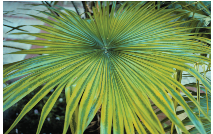
Figure 5. Magnesium-deficient older leaf of Livistona rotundifolia showing broad yellow bands along the margins of individual leaflets.

Iron deficiency is relatively common in container-grown palms, especially those grown in the same container for long periods of time. Over time, most organic substrate components such as bark or peat decompose to poorly aerated muck. It is poor soil aeration that is responsible for the vast majority of Fe deficiency, since under anaerobic conditions, roots cannot respire and produce the energy needed to actively take up Fe from the soil. Root rot diseases or soluble salts injury, which reduce root surface area, are also commonly expressed above ground as Fe chlorosis.