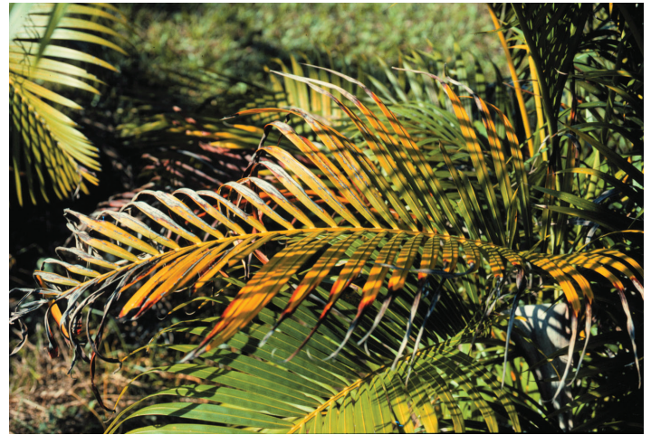
Figure 4. Potassium-deficient older leaf of Dypsis lutescens (areca palm) showing discoloration and marginal and tip necrosis.

the central portion of the leaf or leaflet remains distinctly green. Potassium deficiency differs from Mg deficiency in that with K deficiency there is a gradual transition from green at the base of an old leaf, through yellow or orange discoloration in the middle, and finally to leaflet tip necrosis at the end of the leaf. Magnesium deficiency never causes leaflet tip necrosis and, if this is observed on an obviously Mg-deficient leaf, it is because K deficiency is also present on that leaf.