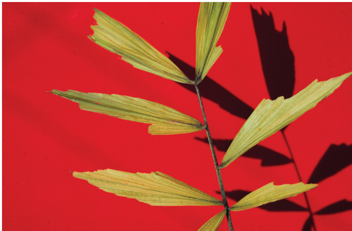
Figure 7. Iron-deficient new leaf of Caryota mitis (clustering fishtail palm) seedling.

The only other nutrient deficiency occasionally encountered in container production of palms is Mn deficiency. In mild form, its symptoms are identical to those of Fe deficiency except that interveinal or longitudinal necrotic streaking will be superimposed on the chlorotic leaflets of new leaves (Figure 9). As the deficiency increases in severity, the distal parts of affected leaflets will become completely necrotic and curled. Manganese deficiency symptoms are most severe towards the bases of new leaves and least so towards the tip (Figure 10).