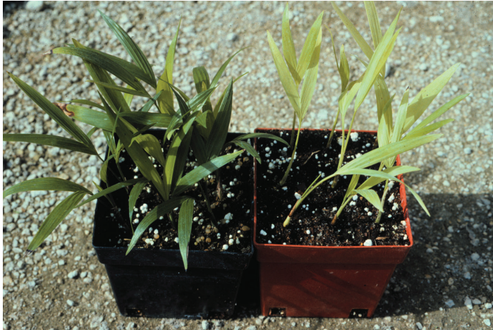
Figure 2. Nitrogen deficiency in Chamaedorea seifrizii (bamboo palm) seedlings on right.

on the oldest leaves (Figure 3). As symptoms become more severe, marginal and/or tip necrosis of the distal leaflets on the oldest leaves may also occur (Figure 4). In some species there is no spotting, and leaflet marginal or tip necrosis will be the only symptom. In many of these species, these necrotic leaflet tips will be curled or frizzled in appearance. Potassium deficiency symptoms are always more severe towards the tip of a leaf and least so towards the leaf base. Similarly, symptoms decrease in severity from oldest to youngest leaves.