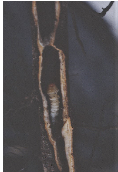
Figure 14. Tree borer inside the root.