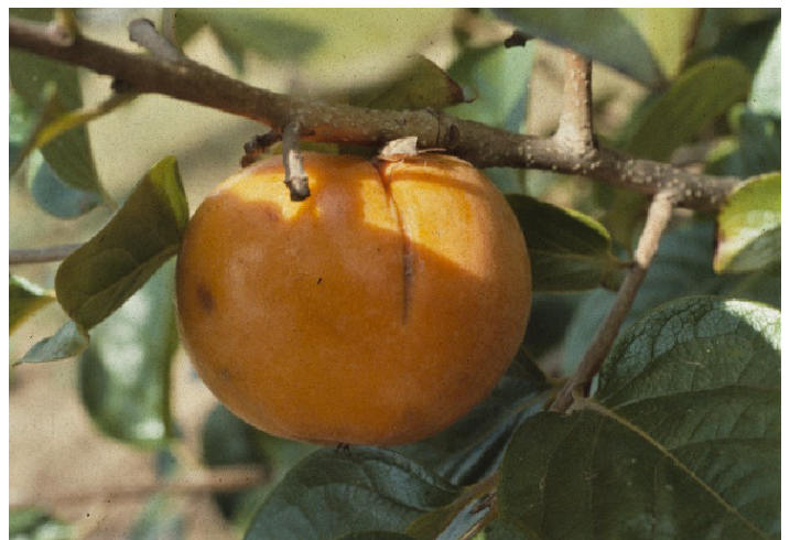
Figure 15. Stink bug on persimmon fruit.