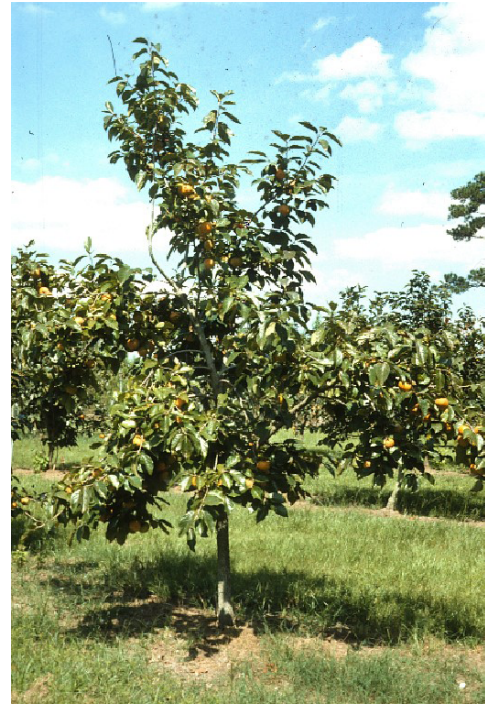
Figure 3. Modified central leader system.

laterals every 8–12 inches to keep. The goal is to have 4–6 well-spaced branches radiating from the trunk. Once this is achieved, the central leader is then “modified” by cutting it back to the final lateral branch, which will limit significant height increases in the future (Figure 3).