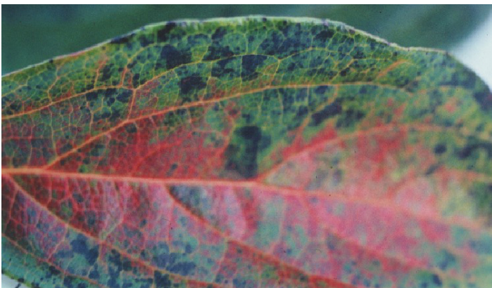
Figure 21. Alternaria spotting on persimmon leaf.