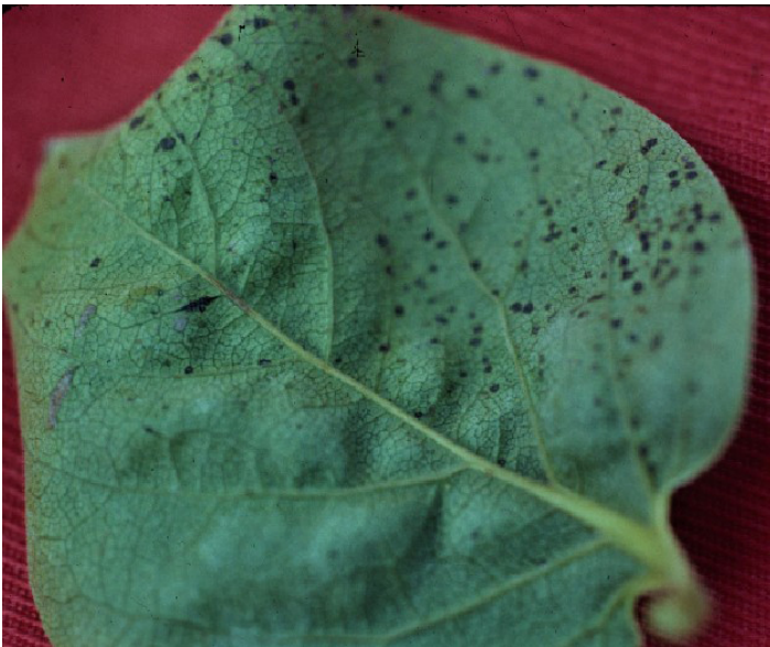
Figure 19. Persimmon leaf spotting.