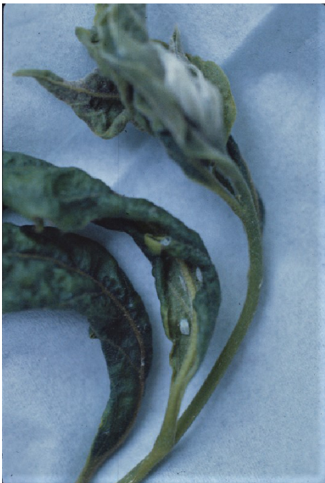
Figure 12. Psylla nymphs on distorted leaves.