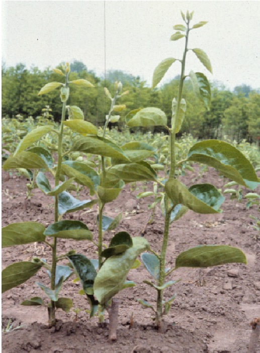
Figure 1. Chip-budded trees.

orchard but is typically performed on much older trees. If rootstocks are available, but scion bud wood happens to be limited, one temporary strategy would be to establish the rootstock in the field, and to bud or graft the scion in situ when material is available.