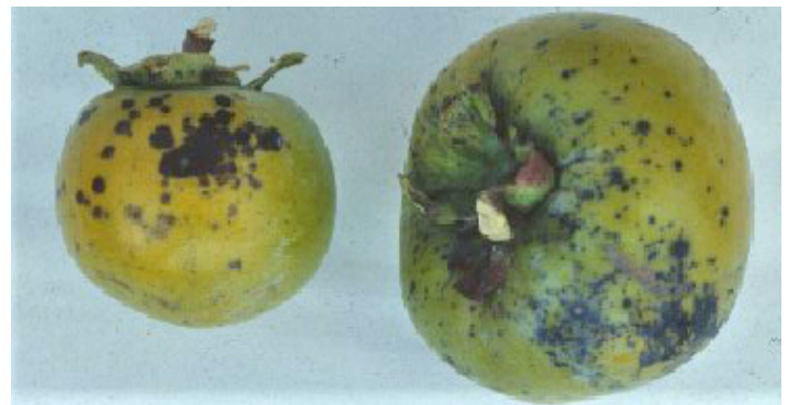
Figure 18. Anthracnose on persimmon fruit.