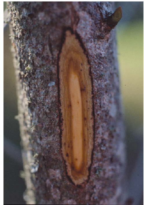
Figure 10. Damage from scale under the bark.