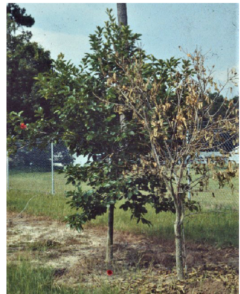
Figure 23. Whole persimmon tree decline.