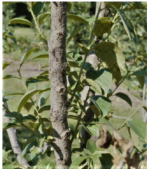
Figure 24. Persimmon decline canker on the trunk.