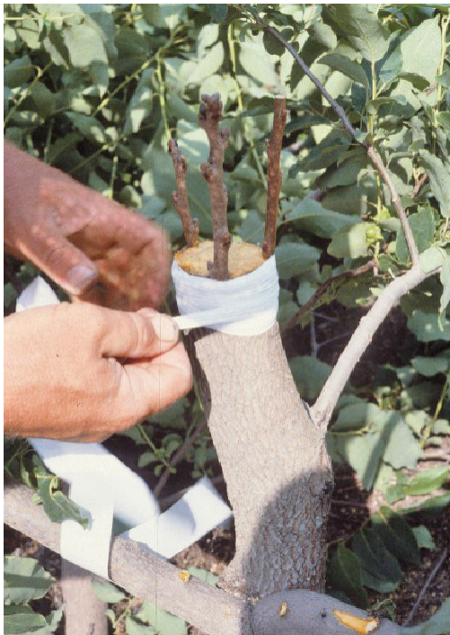
Figure 2. Top-grafting scions.