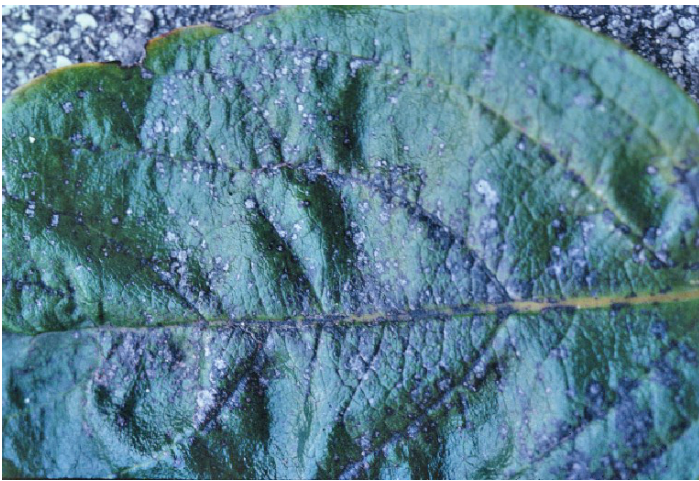
Figure 20. Phyllosticta spotting on persimmon leaf.