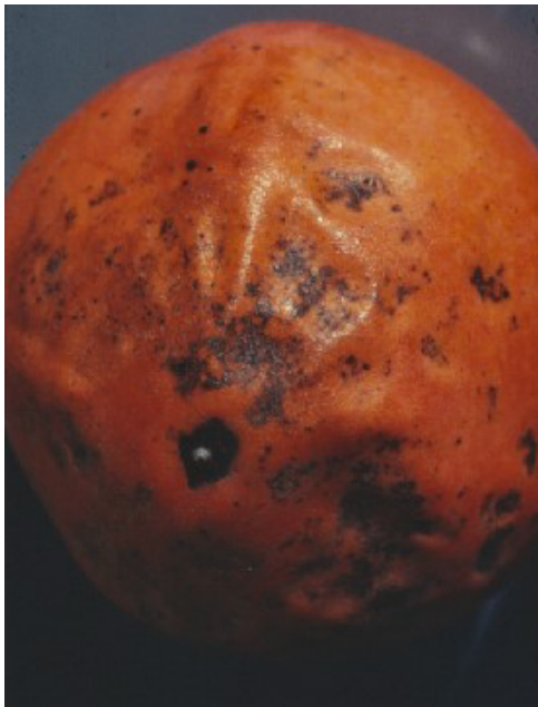
Figure 16. Fruit spotting on persimmon.