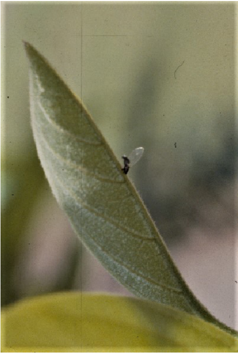
Figure 11. Adult persimmon psylla on leaf. Credits: UF/IFAS