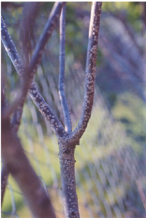
Figure 9. Scale on persimmon.