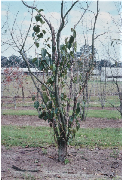
Figure 8. Freeze damage and regrowth from dormant buds.