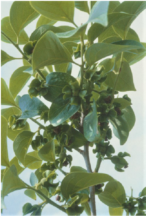
Figure 6. Persimmon shoots with flowers.