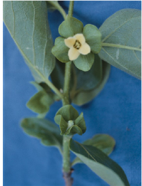
Figure 4. Female persimmon flower.

level, because persimmons tend toward biennial bearing if fruit load is high. Mature trees of smaller-fruited cultivars may reasonably support 250–300 fruit per tree at maturity, whereas larger-fruited cultivars could handle 150–200 fruit per tree. Trees will begin bearing fruit by the third year, with 8–10 years required for full production. Recent production data from 2013–2014 in California shows the average persimmon yield is 5.4 tons per acre. Estimates of production in south Florida are in the 3.6–5.4 tons per acre range, and north Florida is likely on the higher end. Yields are generally lower for the nonastringent varieties.