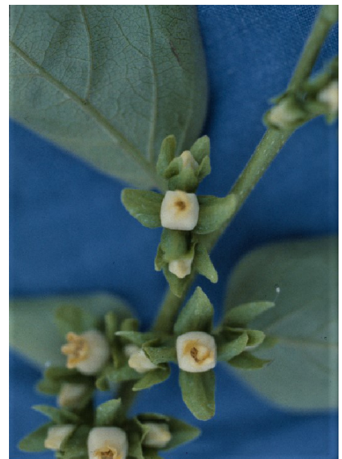
Figure 5. Male persimmon flowers.