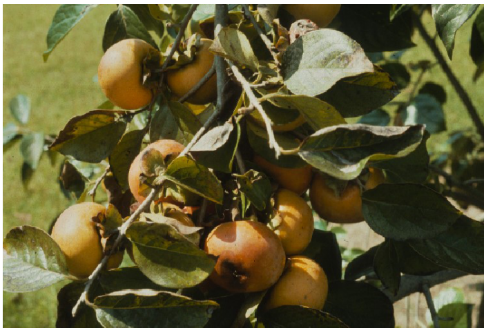
Figure 7. Very heavy crop load, unthinned.

Thinning persimmon fruit is often needed to regulate the crop load (Figure 7) and to help limit the alternate bearing tendency. Some regulation of crop load can be made through judicious pruning during the winter. Most flower buds will grow from the few end buds on a branch tip. By leaving some of these unpruned, some tipped a bud or two, and other weak branches pruned back further, less thinning of fruit is required. Hand thinning is done just after the first natural fruit drop, or about 3 weeks after flowering. Fruit should be spaced 6 inches apart on a branch to prevent rubbing damage to adjacent fruit. Remove any deformed or damaged fruit, and leave the fruit with the largest calyxes for the best fruit quality at harvest.