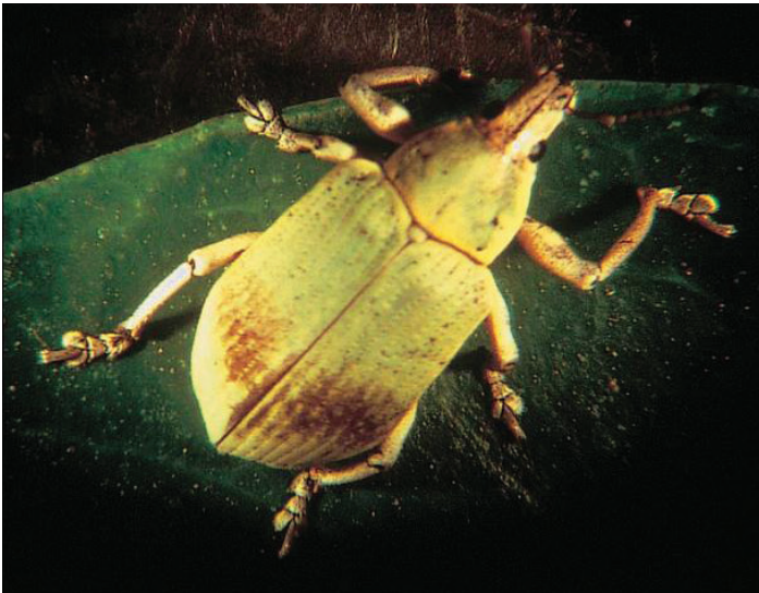
Figure 7. Southern citrus root weevil.

The species are closely related and overlap in central Florida and are very similar in appearance and behavior. They are bright blue-green to aqua in color.