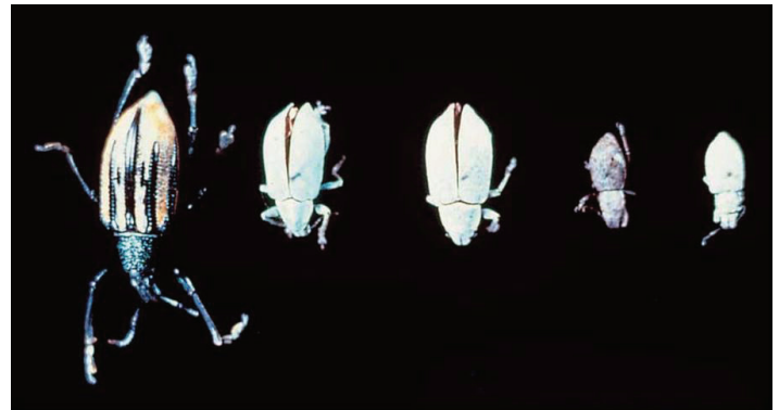
Figure 1. Photo of all 5 weevils allows size differences to be seen. From left to right, Diaprepes, Citrus root weevil, Northern citrus root weevil, Fuller rose beetle, Little leaf notcher.

Adult citrus root weevils vary widely in size and color among species and sometimes within species. Most species can fly short distances which aids dispersal over a limited geographical area. The little leaf notcher and Fuller rose beetle are flightless.