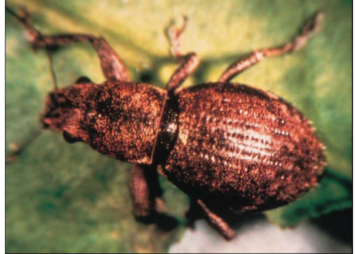
Figure 8. Fuller rose beetle.

Adults are brownish to grey in color, about 0.33 inch long and can be found throughout the year (Figure 8).