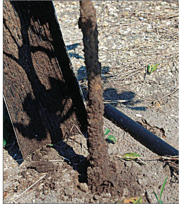
Figure 13. Fire ant damage to young citrus tree.

For more information on soil insect pests, you may wish to consult the annual Florida Citrus Production Guide published by the University of Florida Institute of Food and Agricultural Sciences, Gainesville, Florida.