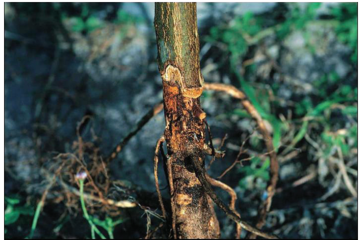
Figure 11. Termite damage to tree.

When groves have been developed from pine and palmetto woodlands harboring a natural termite infestation, problems have developed when land clearing operations have left wood in the soil which provided a food source for termites. When the food supply becomes limited, termites may feed on the bark of the live tree trunk in a ring between the soil line and crown roots causing girdling and possible tree death. Feeding may advance above the soil line (Figure 11).