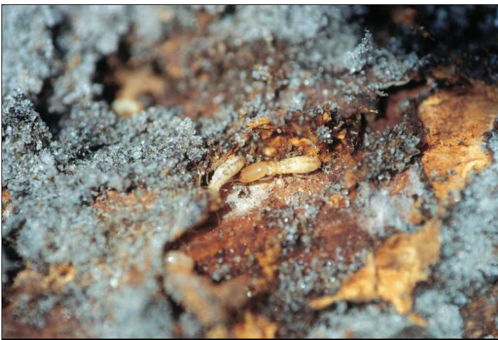
Figure 10. Termites.

Subterranean termites generally do not feed on living plants and can be found on dead and decaying woody plant material. Subterranean termites are 0.20 inch in length and white to yellow in color. They are similar in appearance to ants (Figure 10).