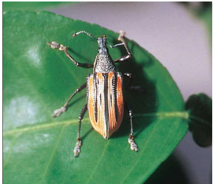
Figure 5. Diaprepes root weevil adult.

This is the largest and most devastating weevil found in Florida citrus. The adult weevil is 0.37 to 0.75 inch in length. The adult wing covers have a black background with orange, gray or white bands (Figure 5).