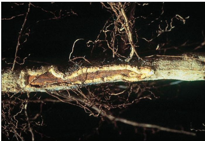
Figure 3. Root system damaged by Diaprepes larvae feeding.

Feeding damage by older larvae may be seen on major lateral roots (Figure 3) and in the crown region when a tree is removed from the soil.