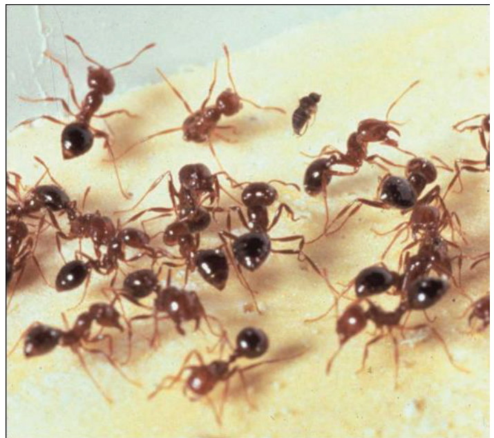
Figure 12. Fire ants.

Many different species of ants are found in citrus groves. Some ants are beneficial, feeding on other pests of citrus, whereas others may be quite disruptive of biological control agents that attack citrus pests. Ants range in size from as small as 0.13 to 0.5 inch (Figure 12).