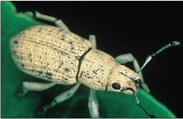
Figure 9. Little leaf notcher.