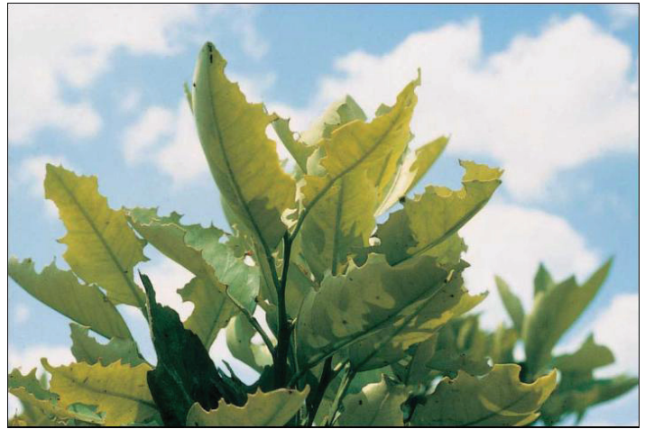
Figure 4. Leaf damaged by Diaprepes adult feeding.

The Diaprepes root weevil, also referred to as the sugarcane rootstalk borer weevil, was first reported in Florida in 1964 near Apopka. It is a major pest of citrus as well as many other plants (crops and ornamentals) grown in Florida and the Caribbean area.