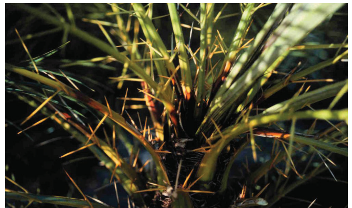
Figure 4. Note dark lesions caused by Pestalotiopsis on petioles of this Phoenix roebelenii , especially at base of young leaves emerging from bud.

While all palms are probably susceptible to diseases caused by this fungus, pgymy date palm ( Phoenix roebelenii ) appears to be affected quite often in Florida, especially during the winter months. With these palms, a bud rot has been observed that can kill the palm (Figure 4). This has been observed on juvenile and mature palms.