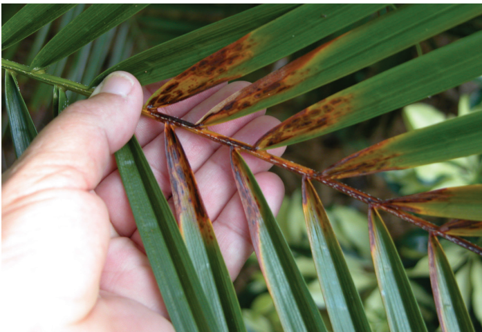
Figure 2. Spots have expanded to affect both leaflets and rachis of Phoenix roebelenii .

If the pathogen is restricted to only causing leaf spots, the disease may not be very damaging to the palm, especially a mature palm in the landscape. However, with juvenile palms that have no trunk and only a few leaves, the palm could be severely affected by the leaf spots.