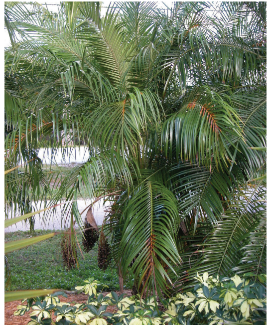
Figure 3. Note that multiple leaves of this Phoenix roebelenii have expanding lesions due to Pestalotiopsis .

If the pathogen is restricted to only causing leaf spots, the disease may not be very damaging to the palm, especially a mature palm in the landscape. However, with juvenile palms that have no trunk and only a few leaves, the palm could be severely affected by the leaf spots.