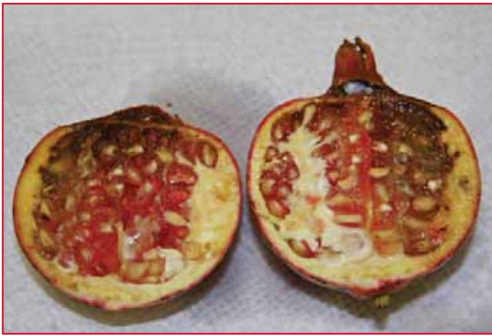
Figure 6. Heart rot.

If you use drip irrigation, use one 1-gallon-per-hour emitter per tree for the first year or two; gradually increase to at least four emitters per tree when the plants are 4 to 5 years old.