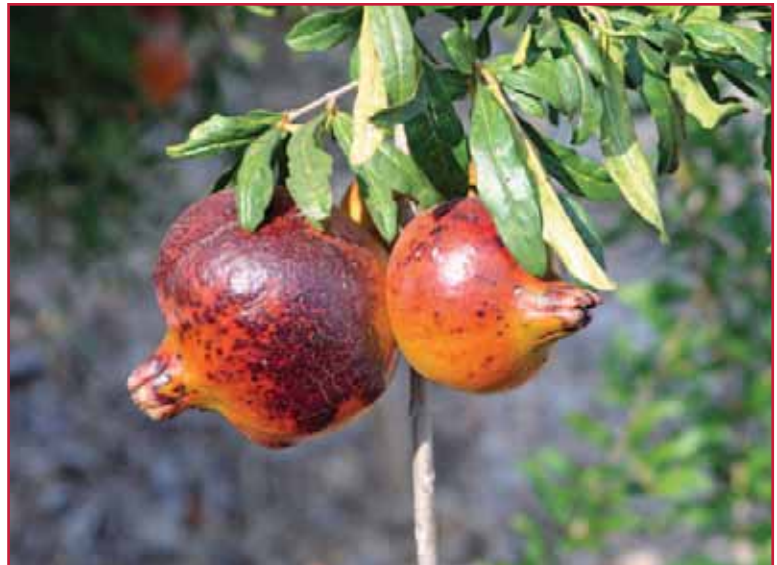
Figure 7. Pomegranate fruit discolored by sunscald.

Appearance is important for pomegranates, especially if they are bought primarily for fall decorations such as table arrangements. If the fruit receives too much sun, it can develop sunscald (Fig. 7), roughened rinds, and brown, russeted blemishes. To prevent sun damage, you may need to apply a sunburn material such as kaolinite clay.