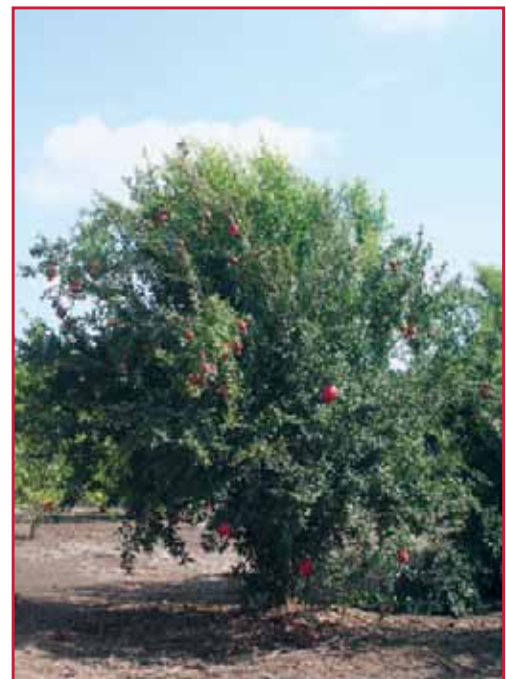
Figure 5. A pomegranate planted in full sun.

Organic mulch or weed barrier fabric can be used to conserve soil moisture and to prevent weed and grass competition.