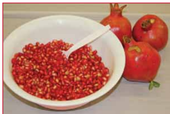
Figure 2. Bright red pomegranates and the sweet, red, juicy, edible arils.