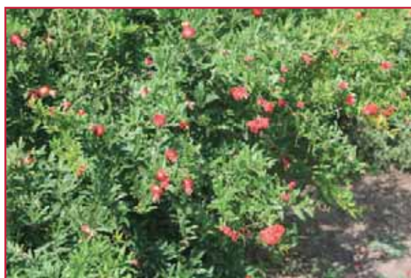
Figure 1. A pomegranate shrub.

Pomegranates grow well in areas with hot, dry summers. Some varieties can tolerate temperatures as low