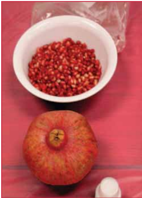
Figure 3. Fruit and arils of the 'Wonderful' pomegranate variety.

as 10°F; others are damaged at 18°F. They are grown as far north as Zone 7b of the U.S. Department of Agriculture Hardiness Zone Map (Fig. 4).