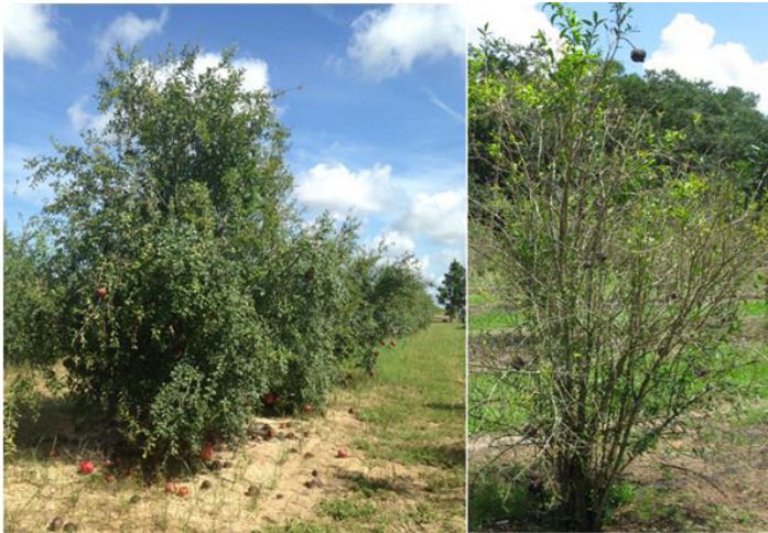
Figure 10. Fruit drop, fruit mummification, and defoliation of pomegranate in Florida orchards caused by combination of different pathogen species.