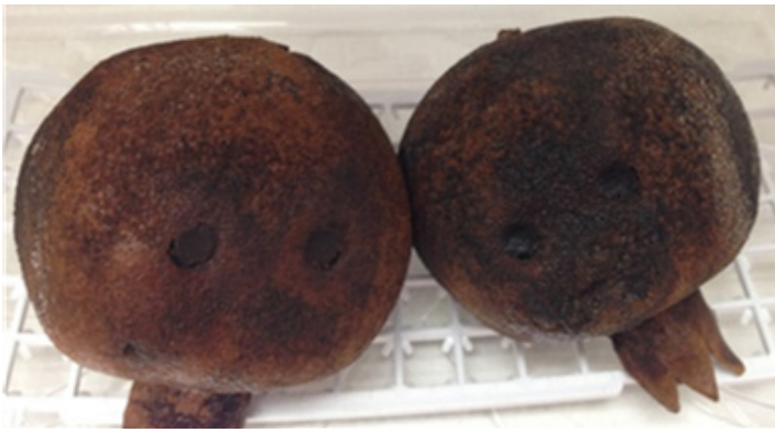
Figure 9. Fruit rot caused by Pilidiella granati . Black dots are the pycnidia on fruit surface.