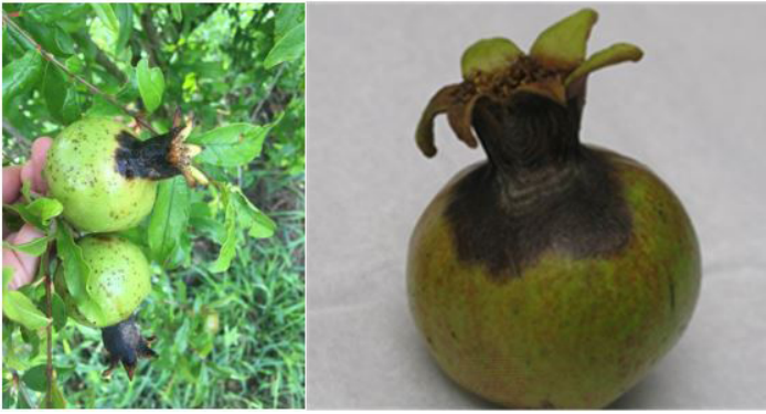
Figure 1. Fruit tip dieback of pomegranate caused by Colletotrichum spp.