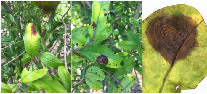
Figure 6. Leaf spots caused by Dwiroopa punicae with a close up on the lesion showing pycnidia as black dots on its center.

Dwiroopa punicae , a novel fungal species belonging to the order Diaporthales, is also associated with leaf spot and fruit rot on pomegranate (Xavier et al. 2019b). Leaf spots associated with this fungus are oval and brown, vary from 0.1 to 1.5 cm in diameter, and appear scattered on the leaf surface (Figure 6). Abundant black pycnidia (resembling little black dots) become visible on the lesion center (Figure 6, last on the right). The symptoms caused by D. punicae on the fruit start as small brown lesions on the fruit calyx at different stages (Figure 7).