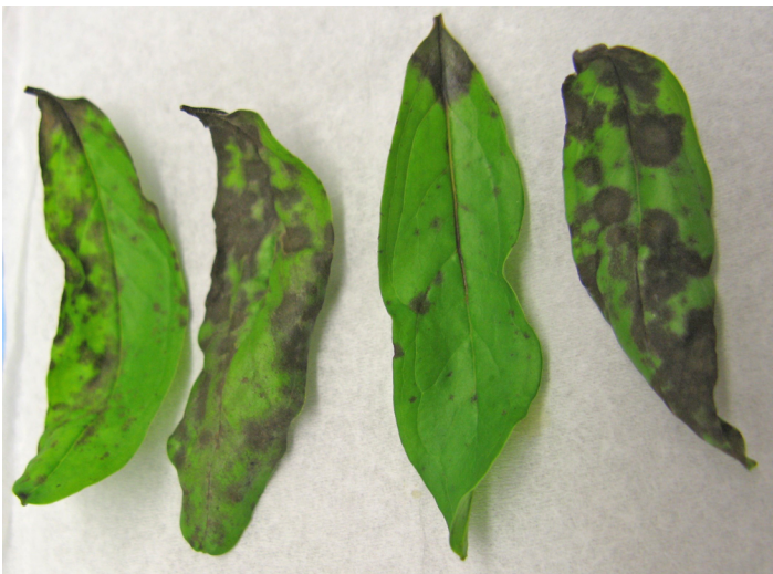
Figure 3. Anthracnose leaf spot of pomegranate caused by Colletotrichum spp.