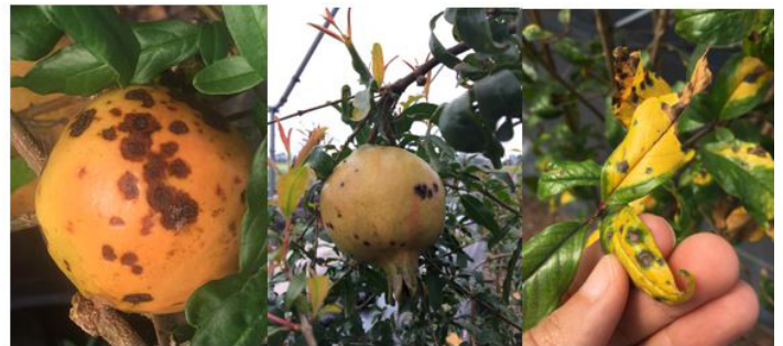
Figure 5. Fruit and leaf spot caused by P. punicae . Credits: K. V. Xavier