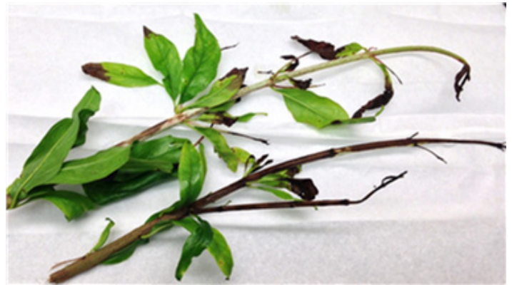
Figure 4. Stem tip dieback of pomegranate caused by Colletotrichum spp.