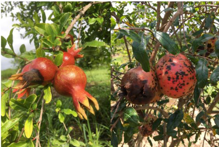
Figure 2. Fruit rot of pomegranate caused by Colletotrichum spp.

Pseudocercospora punicae causes another very common disease on pomegranate in Florida, which has also been associated with leaf or fruit spots. On the leaves, the symptoms start as small (0.1–0.3 cm), irregularly shaped dark brown lesions. These lesions can expand (0.5–1.2 cm) and develop a distinct, dark brown margin with gray coloration. Sometimes the lesions are large enough to observe concentric rings of alternating dark and light gray in the lesion center (Figure 5). A greenish halo often forms around the lesions and becomes very pronounced as the leaves yellow from chlorosis. Eventually leaves senesce, leading to severe defoliation, which can reduce yields. Symptoms on the fruit are small irregular black lesions that can later coalesce into bigger blotches (Figure 5). Lesions caused by P. punicae on the fruits are superficial only, contrary to Colletotrichum and other fungal pathogens, which affect the rind and arils. The symptoms on leaves and fruits can vary among the different pomegranate varieties.