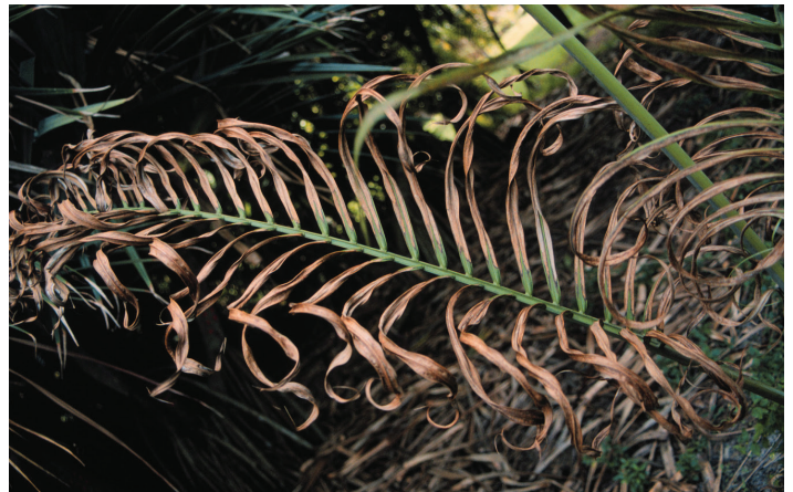
Figure 2. Potassium-deficient older leaf of Dypsis cabadae showing necrosis and curling of leaflet tips.