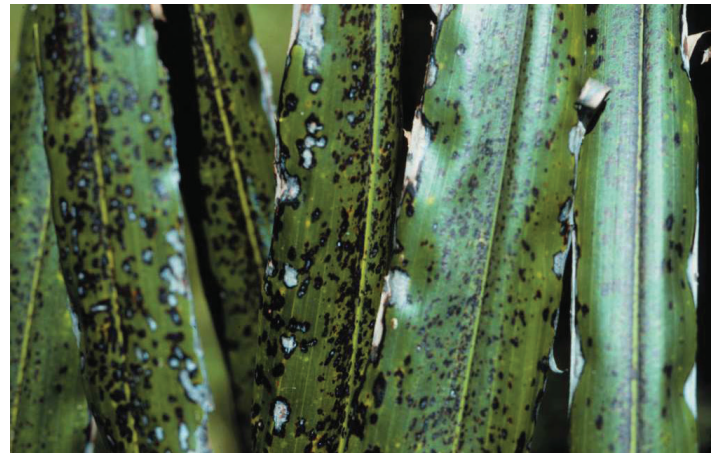
Figure 7. Potassium-deficient older leaf of Arenga sp.

In Caryota spp. (fishtail palms) and Arenga spp. (sugar palms), chlorotic mottling is minimal or non-existent, but early symptoms appear as irregular necrotic spotting within the leaflets (Figures 7 and 8). In most other palms, including Cocos nucifera (coconut palm), Elaeis guineensis (African oil palm), Dypsis lutescens (areca palm), Chamaerops humilis (European fan palm) Hyophorbe verschaffeltii (spindle palm), and others, early symptoms appear as translucent yellow or orange spotting on the leaflets and may be accompanied by necrotic spotting as well. As the deficiency progresses, marginal and tip necrosis will also be present. The most severely affected leaves or leaflets will be completely necrotic and frizzled except for the base of the leaflets and the rachis (Figures 9–11).