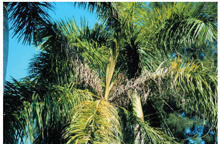
Figure 16. Manganese-deficient Roystonea regia .

Visual symptoms alone may be sufficient for diagnosis of this disorder although leaf nutrient analysis may be helpful in distinguishing late stage K deficiency from manganese (Mn) deficiency (see ENH-1015 Manganese Deficiency in Palms http://edis.ifas.ufl.edu/ep267 ). These two deficiencies can be extremely similar from a distance, but close examination should reveal characteristic spotting and marginal necrosis in K deficiency or necrotic streaking for Mn deficiency (Figures 16 and 17). Potassium deficiency symptoms are also more severe toward the leaf tip and are less so at the leaf base. The reverse is true for Mn deficiency.