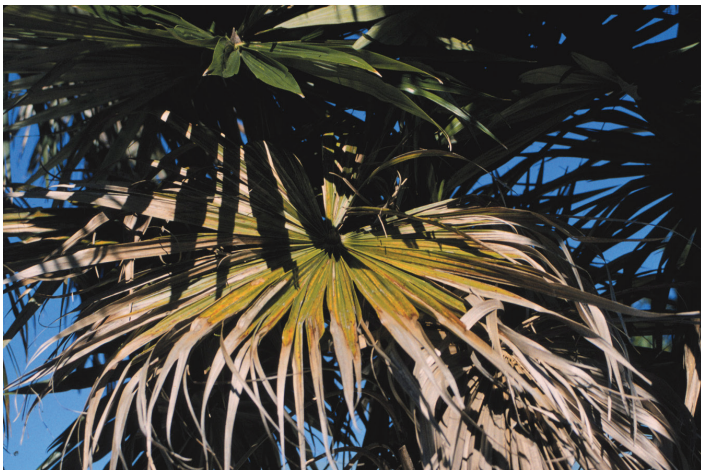
Figure 5. Potassium-deficient older leaf of Livistona chinensis showing leaf discoloration.

In Phoenix canariensis (Canary Island date palm), leaflets show fine (1–2 mm) necrotic and translucent yellow spotting and extensive tip necrosis. These necrotic leaflet tips in most Phoenix spp. are brittle and often break off, leaving the margins of affected leaves irregular.