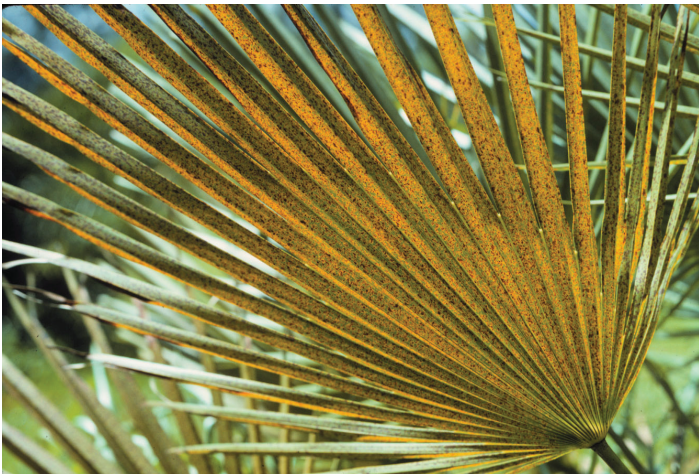
Figure 10. Potassium-deficient older leaf of Chamaerops humilis showing translucent orange and necrotic spotting.