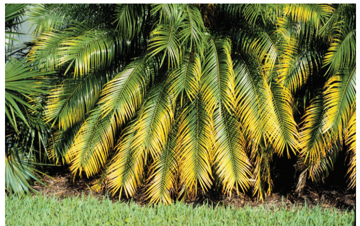
Figure 17. Magnesium deficiency in Phoenix roebelenii .