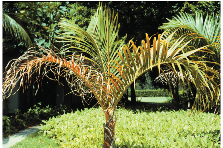
Figure 13. Potassium-deficient Hyophorbe verschafeltii showing the increase in severity of symptoms from new to old leaves.