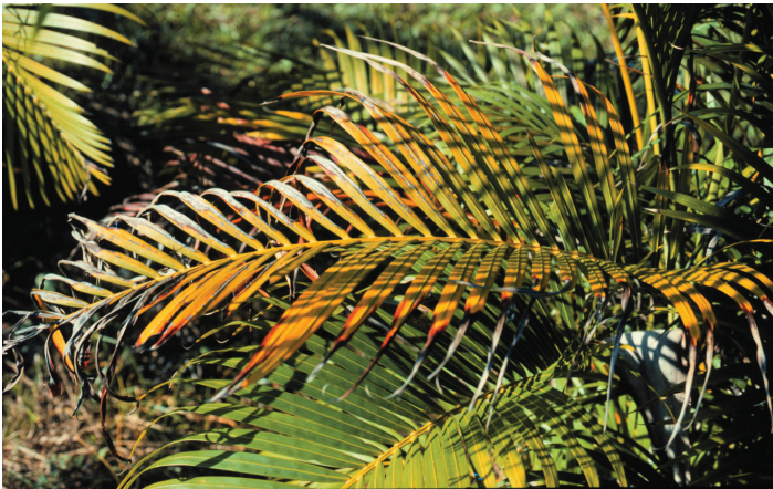
Figure 9. Potassium-deficient older leaf of Dypsis lutescens showing leaf discoloration and extensive necrosis of the leaflet margins and tips.