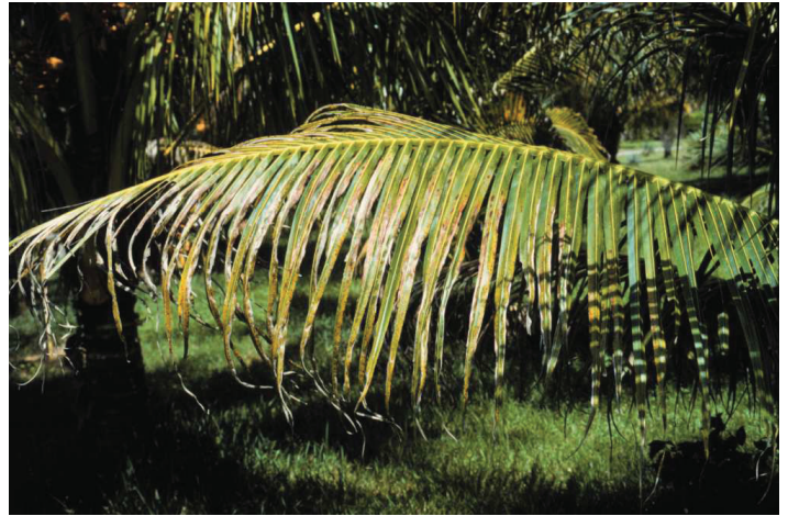
Figure 12. Potassium-deficient older leaf of Cocos nucifera showing progression of symptoms from the base to the tip of the leaf.