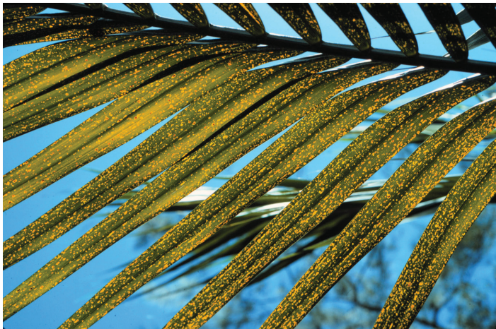
Figure 1. Older K-deficient leaf of Dictyosperma album showing translucent yellow-orange spotting when held up to the light.

Symptoms of potassium (K) deficiency vary among species, but always appear first on the oldest leaves. Older leaflets of some palms such as Dictyosperma album (hurricane palm) are mottled with yellowish spots that are translucent when viewed from below (Figure 1). In other palms such as Dypsis cabadae (cabada palm), Howea spp. (kentia palms) and Roystonea spp. (royal palms), symptoms appear on older leaves as marginal or tip necrosis with little or no yellowish spotting present (Figures 2 and 3). The leaflets in Roystonea , Dypsis , and other pinnate-leaved species showing marginal or tip necrosis often appear withered and frizzled.