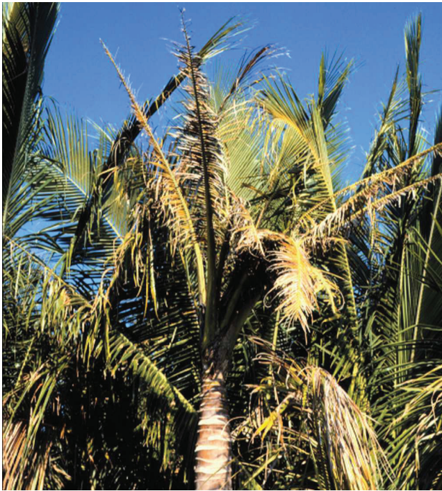
Figure 14. Late-stage K deficiency in Cocos nucifera showing small chlorotic and necrotic new leaves and trunk tapering. This palm died shortly after the photo was taken.