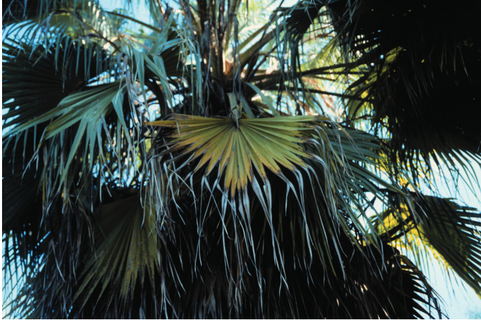
Figure 4. Potassium-deficient older leaf of Washingtonia robusta showing extensive leaflet tip necrosis.

In fan palms such as Livistona chinensis (Chinese fan palm), Corypha spp. (talipot palm), Washingtonia spp. (Washington palms), and Bismarckia nobilis (Bismarck palm), necrosis is not marginal, but is confined largely to tips of the leaflets (Figures 4 and 5). In Phoenix roebelenii (pygmy date palm), the distal parts of the oldest leaves are typically orange with leaflet tips becoming necrotic (Figure 6). The rachis and petiole of the leaves usually remains green, however, and the orange and green are not sharply delimited as with magnesium (Mg) deficiency . This pattern of discoloration holds for most palm species that show discoloration as a symptom.