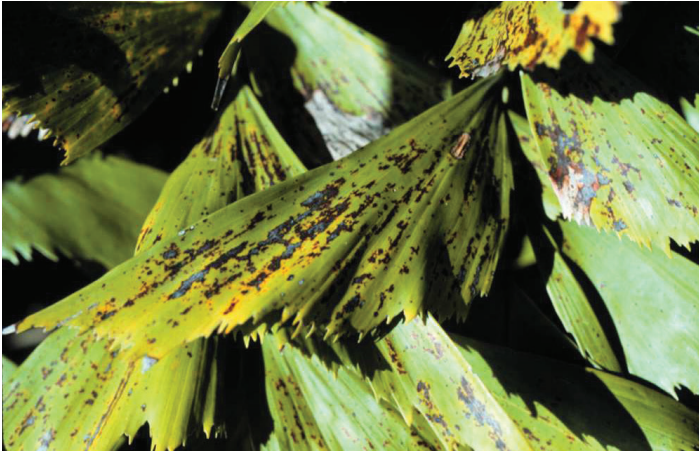
Figure 8. Potassium-deficient older leaf of Caryota mitis .

canopy will contain only a few leaves, all of which will be chlorotic, frizzled, and stunted (Figures 14 and 15). The trunk will begin to taper (pencil-pointing) and death of the palm often follows.