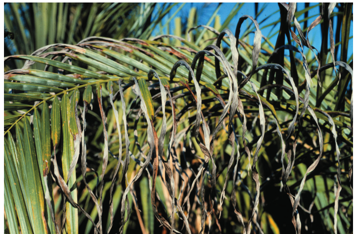
Figure 3. Potassium-deficient older leaf of Roystonea regia showing leaflet tip necrosis and curling.