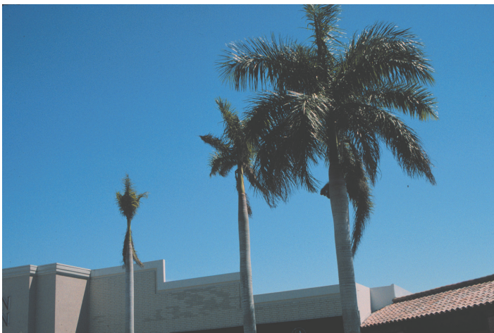
Figure 15. Late stage K deficiency in Roystonea regia showing small necrotic leaves and tapering trunk (pencil-pointing)