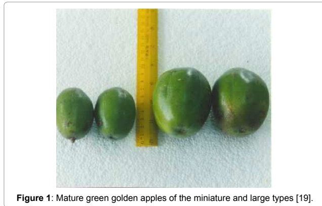
Figure 1: Mature green golden apples of the miniature and large types [19].