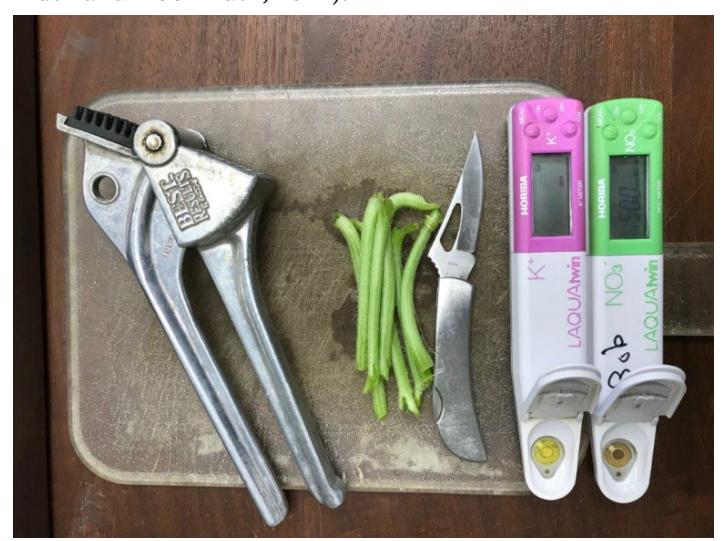
Figure 2. Plant sap nitrate and potassium meters and tools for petiole sap testing.

Making a timely analysis of plant tissue N and K can help optimize N and K injection and can aid farmers in making quick decisions on how much N and K to inject. Using data from research studies and commercial strawberry farms, extension scientists developed petiole sap testing procedures (Figure 2). The petiole sap sufficiency ranges for N and K for strawberry are presented in Table 3. More information on petiole sap testing can be found in "Guide for Plant Petiole Sap-Testing for Vegetable Crops" (Hochmuth and Hochmuth, 2022).