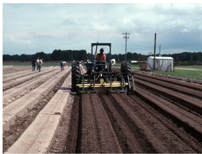
Figure 1. Preparing beds with a rototiller and bed shaper.

al., 1994). Similarly, a portion of the recommended P and magnesium (Mg) amounts can be incorporated through a preplant application. It has been observed that strawberries can be grown successfully only with post-planting fertigation. To minimize the risk of nutrient leaching or runoff, growers are encouraged to use controlled-release or slow-release fertilizers for pre-plant fertilization. Typically, calcium (Ca) fertilization is not needed because the soil holds enough Ca at recommended pH levels, and irrigation water contains Ca that plants can use.