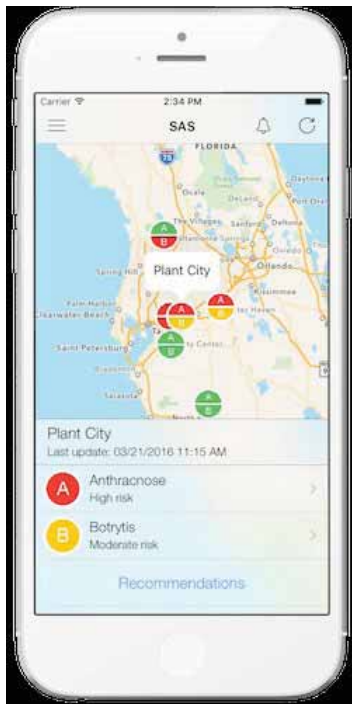
Figure 6. Short Message Service (SMS) with disease alert.

E-mail and Short Message Service (SMS) technologies are available during the strawberry season to provide information to growers and Extension agents rapidly. The system automatically sends SMS messages (Figure 6) and e-mails to registered users whenever the infection index calculated crosses an established threshold.