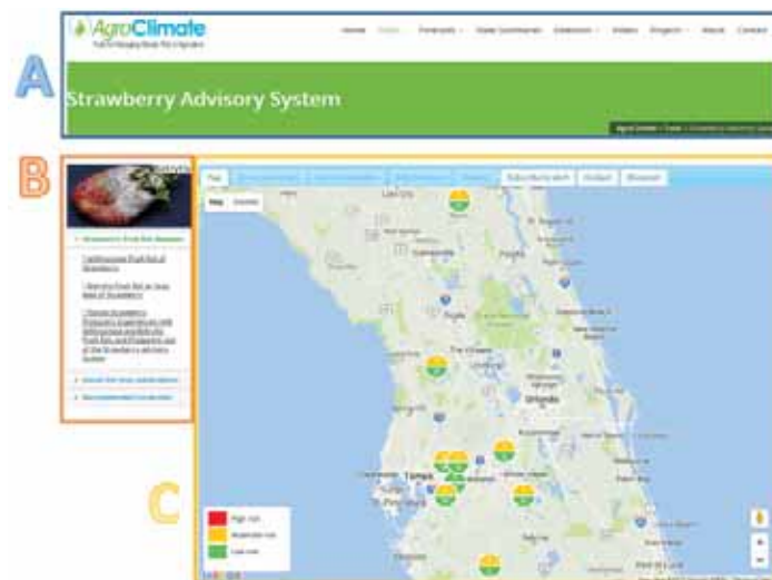
Figure 1. The main web page for the Strawberry Advisory System.

The Strawberry Advisory System, when loaded, displays to the user a page divided in three different sections (Figure 1). Section A (Figure 1A) shows information about the AgroClimate portal, extension materials, contact information, the gate to the administration page, and other tools. In section B (Figure 1B), the user can easily find the current news and important articles prepared by extension specialists. When a specific weather station is selected, the map in section C (Figure 1C) is moved to the corresponding location, showing information related to the selected station. The user can then click on the “click for recommendations” button to access local specific recommendations for that area. The core of the system is found in section C on the map (Figure 1C). All functions developed for the system are presented in this area.