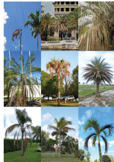
Figure 4. Various ornamental palms displaying symptoms of LB.