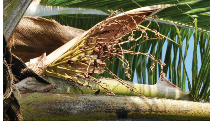
Figure 2. Necrotic inflorescence on a Coconut palm infected with LB.

the northernmost limit and the Florida Keys being the southernmost record. The disease has also been reported in Louisiana.