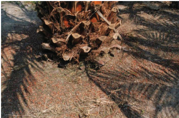
Figure 1. Premature fruit drop is an early symptom of LB.

The first symptoms of LB are variable. However, if fruit is present, the first symptom is generally premature fruit drop (Figure 1). If fruit has not set but inflorescences are present, they will become necrotic (Figure 2). Note that if the palm is not old enough to produce fruit, if it is not putting out an inflorescence at the time of infection, or if the inflorescences are trimmed, then these will not be reliable indicators for infection status. Inflorescence necrosis/fruit drop progresses to discoloration of the oldest leaves (closest to the ground) that gradually advances to younger leaves (Figure 3). The final stage of the disease is the collapse of the spear leaf, indicating that the heart or bud of the palm (apical meristem) has died and the palm has completely declined with no chance of saving it. The length of time between infection and symptom development (latent period) appears to be about four to five months. From symptom development to collapse of spear leaf is about two to three months, but this is highly variable. In some cases, no leaf discoloration is observed, but the spear leaf will collapse and the palm will test positive. Symptom progression occurs at different rates in different palm species.