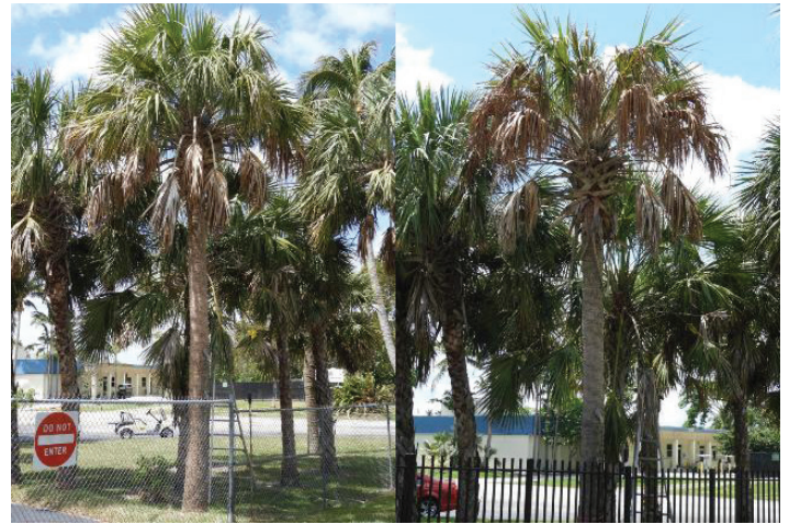
Figure 3. Symptom progression of LB in a Sabal palmetto demonstrating discoloration of older leaves first, March 2018 (left); then three months later where more, younger leaves are affected and spear leaf has collapsed (right).