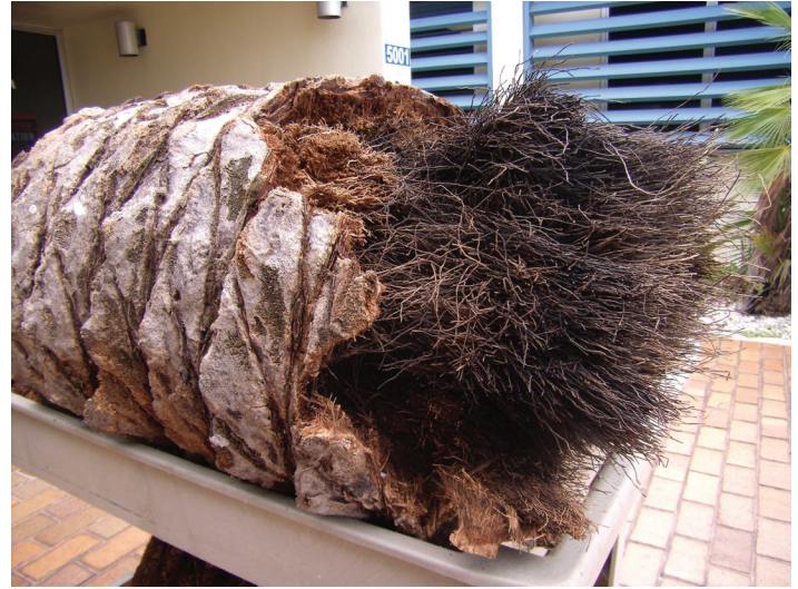
Figure 7. The only tissues remaining in this Phoenix dactylifera trunk section are the fibers (strings). The fungus has degraded the rest of the trunk tissue.