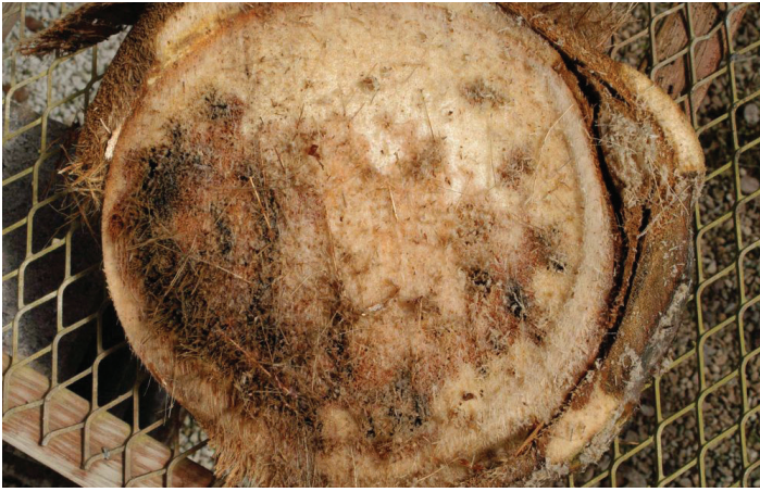
Figure 5. Cross-section of Cocos nucifera trunk illustrating that the rot caused by Thielaviopsis paradoxa occurs on only one side of the trunk and moves from the outside to the inside of the trunk.

Stem bleeding is a common symptom of Thielaviopsis trunk rot observed on Cocos nucifera (coconut). This stem bleeding is a reddish-brown or brown or black stain that runs down the trunk from the point of infection (Figure 6). Since any trunk wound may result in stem bleeding, close examination of the point of infection is required. If the stem bleeding is due to Thielaviopsis paradoxa and the disease has progressed significantly, the tissue immediately surrounding the wound (infection point) will be quite soft in comparison to surrounding trunk tissue. You will be able to push your finger past the pseudobark and into the trunk tissue. Palms other than coconuts, especially those with a smooth trunk, may also exhibit stem bleeding, but it seems to be most common in coconut. Eventually, the trunk will collapse on itself at the point of infection. Because the fungus cannot degrade lignin, the trunk fibers are left nearly intact, while the tissue surrounding the fibers is degraded, resulting in “stringy” black tissue (Figure 7).