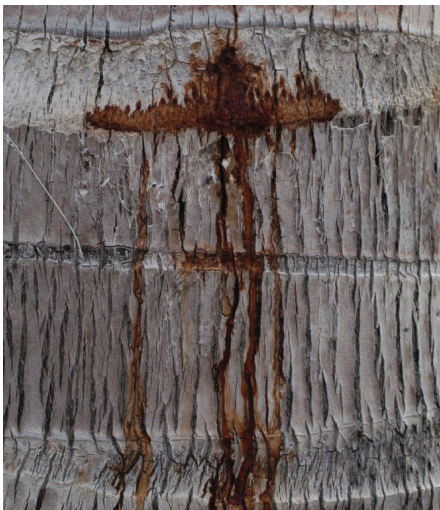
Figure 6. Stem bleeding on a Cocos nucifera due to infection from Thielaviopsis paradoxa .

Stem bleeding is a common symptom of Thielaviopsis trunk rot observed on Cocos nucifera (coconut). This stem bleeding is a reddish-brown or brown or black stain that runs down the trunk from the point of infection (Figure 6). Since any trunk wound may result in stem bleeding, close examination of the point of infection is required. If the stem bleeding is due to Thielaviopsis paradoxa and the disease has progressed significantly, the tissue immediately surrounding the wound (infection point) will be quite soft in comparison to surrounding trunk tissue. You will be able to push your finger past the pseudobark and into the trunk tissue. Palms other than coconuts, especially those with a smooth trunk, may also exhibit stem bleeding, but it seems to be most common in coconut. Eventually, the trunk will collapse on itself at the point of infection. Because the fungus cannot degrade lignin, the trunk fibers are left nearly intact, while the tissue surrounding the fibers is degraded, resulting in “stringy” black tissue (Figure 7).