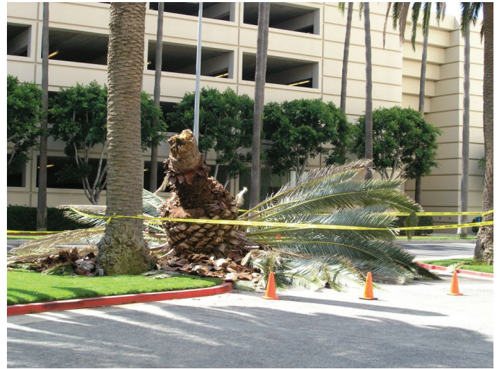
Figure 3. The canopy of this Phoenix canariensis fell off of the trunk due to Thielaviopsis trunk rot. Credits: H. Donselman

In the situation where the canopy falls off the trunk, the rot occurs below the bud at the base of the canopy in the woody tissue. This is also an area with little, if any, lignified plant tissue. When the trunk rot is farther down the trunk, this means that the fungus has rotted the trunk tissue until the palm can no longer structurally support itself. Examination of a cross-section through a diseased trunk illustrates that the rot is located only on one side of the trunk (Figures 4 and 5). This is in contrast to Ganoderma butt rot, in which the fungus is at the trunk base and rots from the center of the trunk to the outside. Ganoderma butt rot is discussed at http://edis.ifas.ufl.edu/pp100 .