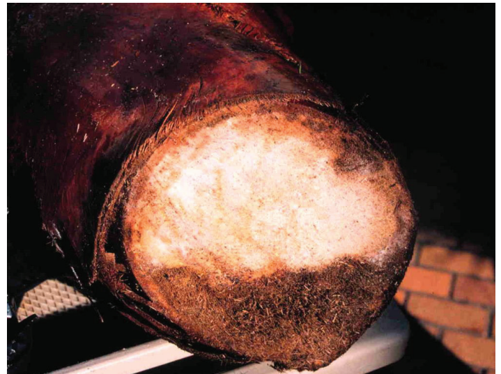
Figure 4. Cross-section of Washingtonia robusta trunk illustrating that the rot caused by Thielaviopsis paradoxa occurs on only one side of the trunk and moves from the outside to the inside of the trunk.

In the situation where the canopy falls off the trunk, the rot occurs below the bud at the base of the canopy in the woody tissue. This is also an area with little, if any, lignified plant tissue. When the trunk rot is farther down the trunk, this means that the fungus has rotted the trunk tissue until the palm can no longer structurally support itself. Examination of a cross-section through a diseased trunk illustrates that the rot is located only on one side of the trunk (Figures 4 and 5). This is in contrast to Ganoderma butt rot, in which the fungus is at the trunk base and rots from the center of the trunk to the outside. Ganoderma butt rot is discussed at http://edis.ifas.ufl.edu/pp100 .