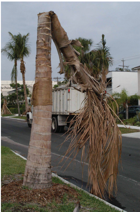
Figure 2. Cocos nucifera trunk collapsed upon itself due to Thielaviopsis trunk rot.