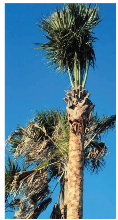
Figure 5. The lower leaves of this palm have been removed, and the remaining ones tied into a bundle for transport.

Since water stress appears to be the primary physiological problem associated with transplanted palms, any practice that reduces water stress in transplanted palms should improve palm survival rates. Typically, one-half to two-thirds of the oldest leaves are removed at the time of digging to facilitate handling and to reduce leaf surface area, from which water loss occurs (Figure 5).