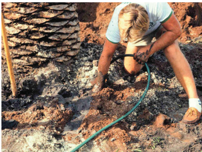
Figure 10. Using water to force sand under and around the rootball.

Gliocladium blight (pink rot) (Broschat 1994; Hodel et al. 2003; 2006).