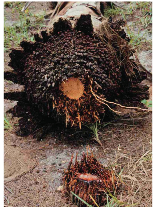
Figure 3. This palm had been planted too shallowly from a container and eventually fell over from its own weight.

If shallowly planted palms are encountered in the landscape, stabilize the palms by mounding up soil to cover the root-initiation zone. This mound of soil will allow the root initials to continue their growth down into the soil, firmly anchoring the palm.