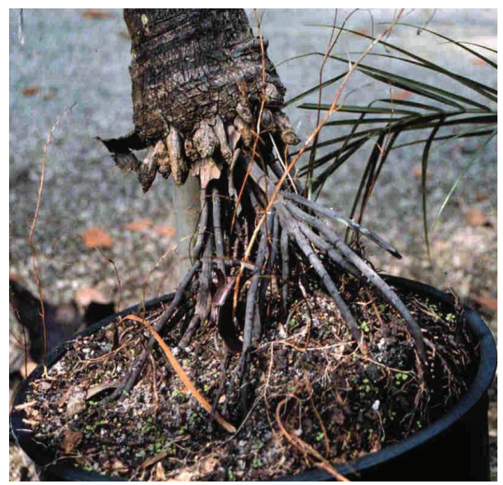
Figure 2. Container substrate subsidence and shallow planting resulted in the root- initiation zone of this palm being above the current soil line. These new root initials will probably never enter the soil.

surface (Figure 2). Planting such palms at the same level as the top of the rootball will result in a poorly-anchored palm that is susceptible to toppling over (Figure 3). Containergrown palms should always be planted so that the top of the root-shoot interface is about one inch below the surface of the soil.