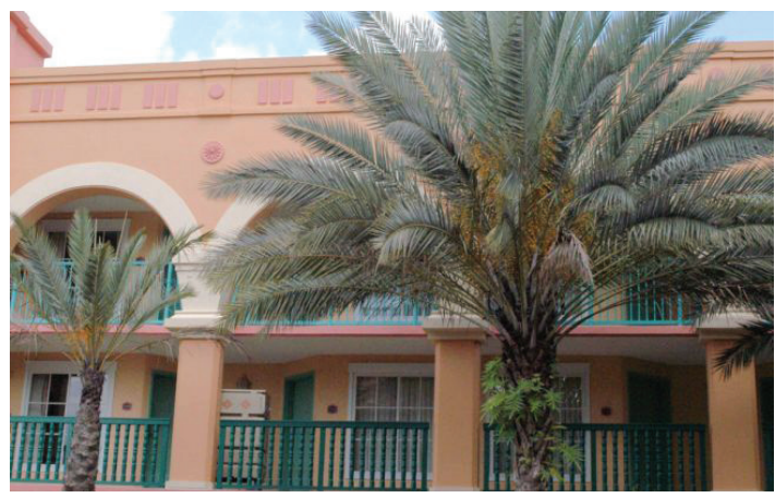
Figure 9. The palm on the left was planted too deeply. At the time of planting, these two palms were similar in size.

properly planted palms (Figure 9). In addition to nutrient deficiencies, deeply planted palms may also suffer from water stress. As a result of these palms' weakened condition, they may attract secondary pests, such as palm weevils ( Rhychophorus sp.). Palms that are planted too deeply may also develop secondary root rots due to the suffocation of deeply buried roots. Deeply planted palms may linger in a state of poor health for many years, or they may die at any time.