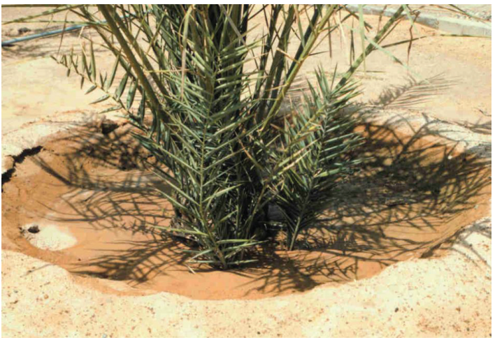
Figure 11. Mounding up soil around the rootball forces water into the rootball, where it is needed.