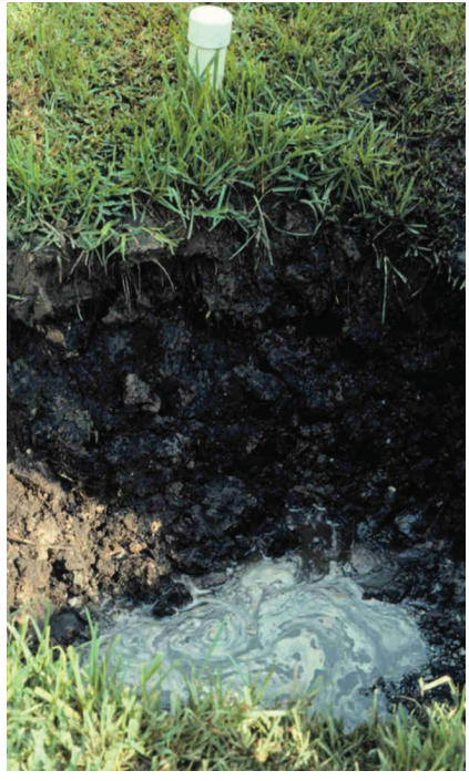
Figure 8. This planting site has a high water table, which is unsuitable for palm installation.

Palms should not be planted into sites with high water tables or poor drainage (Figure 8). Such sites can be planted if mounds or berms are used to build up the area to be planted. Clay hardpans, where they occur, should be drilled through to improve drainage. Planting holes should be roughly twice the diameter of the rootball to facilitate backfilling, but need not be any deeper than the rootball.