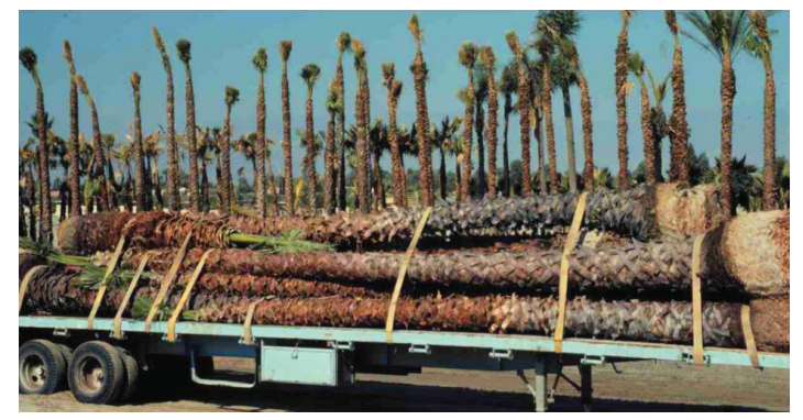
Figure 7. These palms are well supported on the trailer bed for transportation.

During transport on truck or trailer, palms should be well supported along their entire length (Figure 7). Unsupported crowns may crack or damage the bud, resulting in reduced survival rates.