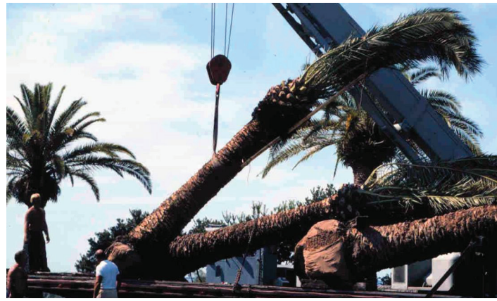
Figure 6. A palm being lifted in a nylon sling. The splint attached to the crown provides support.

Palms should be lifted only by means of nylon slings wrapped around the trunk (Figure 6). Never attach chain, cables, or ropes directly to palm trunks; such practices can result in injury and possibly fatal diseases, such as Thielavi opsis trunk. (For more on that topic, see EDIS Publication PP219, Thielaviopsis Trunk Rot of Palm , http://edis.ifas.ufl. edu/pp143.)