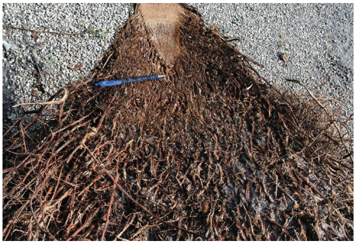
Figure 1. The inverted-cone-shaped tissue at the bottom of the trunk an area from which all primary palm roots arise - is called the rootinitiation zone. The pen marks the soil line.

Palms, when compared to similar-sized broadleaf trees, are relatively easy to transplant into the landscape. Many of the problems encountered when transplanting broadleaf trees, such as wrapping roots, are never a problem in palms due to their different root morphology and architecture. While broadleaf trees typically have only a few large primary roots originating from the base of the trunk, palm root systems are entirely adventitious. In palms, large numbers of roots of a relatively small diameter are continually being initiated from a region at the base of the trunk, a region called the root-initiation zone (Figure 1). And while the roots of broadleaf trees continually increase in diameter, palm roots remain the same diameter as when they first emerged from the root-initiation zone.