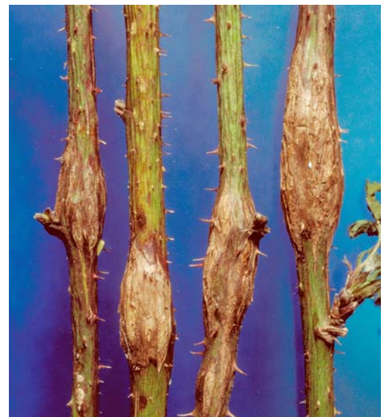
Rednecked cane borer ( Agrilus ruficollis ) damage on raspberry canes.

There are several species of borer that affect blackberries and raspberries, including the raspberry