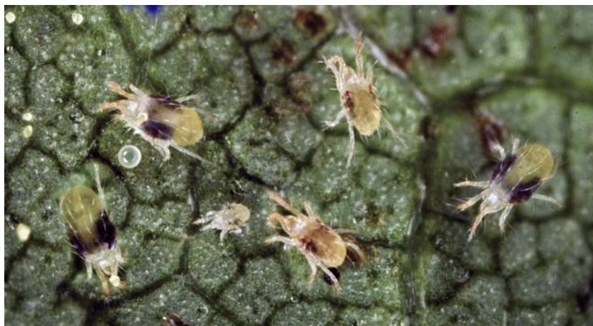
Twospotted spider mite adults, juveniles, and eggs seen with magnification.

Mites are very small arachnids that are barely visible to the naked eye, but they can become a big problem on bramble crops. The twospotted spider mite will infest the underside of bramble leaves and suck juices from the leaf, causing a light gray stippling on the leaf surface. At high enough populations, the spider mites will produce a light webbing that covers the leaf. Spider-mite feeding can cause defoliation, reduced plant