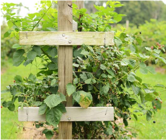
A wooden T-trellis with two sets of wires to support blackberry canes.