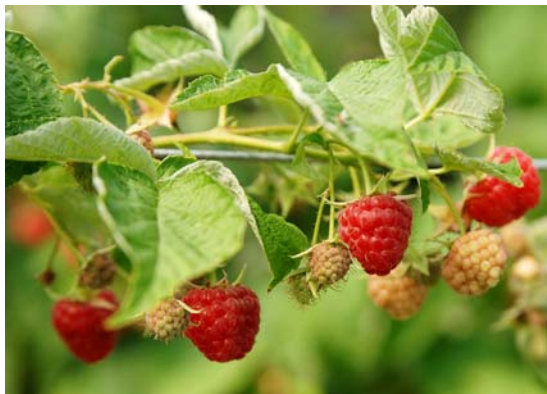
Josephine raspberries at the University of Arkansas research farm.