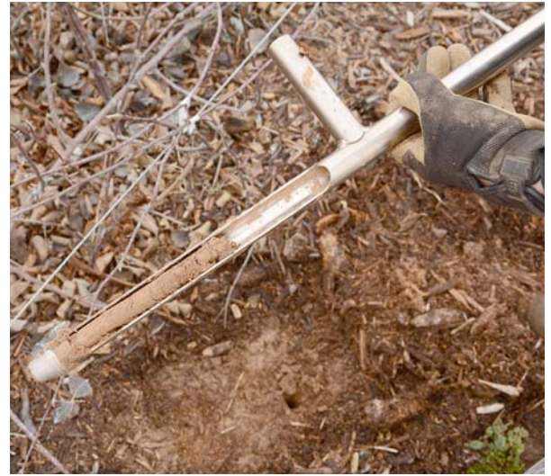
Use a soil probe or shovel to collect multiple 6-inch soil cores from your field for testing.

prevent primocanes from emerging within the planted row if an opening is not provided. Plantings have been made using the fabric solely as an in-row cover, and also as a seamless mulch sheet, extending row-to-row across the middles. Though the initial cost is high, it may prove reasonable when amortized over the expected lifetime of five to 10 years, especially when labor savings are taken into account. Available fabric mulches include Sunbelt™ by DeWitt Co. and Lumite by Shaw Fabrics, which are available through most farm and garden supply companies. The heavy-grade options are recommended because they will have a longer life span.