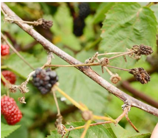
Anthracnose symptoms on blackberry include shriveled fruit and lesions on cane.

Anthracnose, Elsinoe veneta , is a fungal disease that can become a serious problem on blackberries and black raspberries and on some susceptible red raspberry cultivars. The disease causes sunken lesions on canes, with infected fruit becoming prematurely shriveled and dry. Sanitation procedures and management practices to improve air circulation play major roles in disease suppression. Additionally, a spray of liquid lime-sulfur applied to canes during the late dormant season