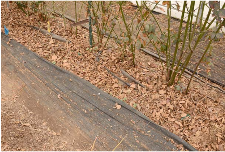
A heavy-duty weed-barrier fabric is used on either side of a high tunnel blackberry planting to suppress weeds. Note how the row center is left open to allow for fertilization.