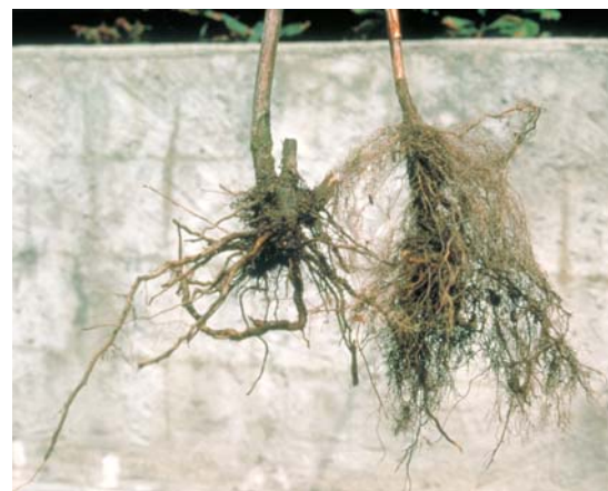
Healthy raspberry roots (right) and roots infected by Phytophthora fragariae var. rubii (left).

Sites that are slow to drain, or exhibit standing water, should not be planted to brambles without improvements that allow for efficient drainage. Heavy soils can be amended with large amounts of organic matter and worked with a subsoiler to improve drainage, or raised beds can be created to help water drain away from bramble roots.