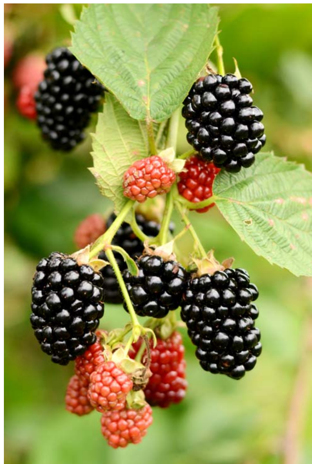
Blackberries make a great addition to a diversified market farm or can be the main focus of a berry farm.

Although anyone can choose to grow organically, federal regulations control the labeling and marketing of all organic products. If you grow on a commercial scale and plan to market your produce as organic, you will need to be certified. To learn more about organic certification and the steps involved, read ATTRA's Organic Farm Certification and Tipsheet: Transitioning to Organic Management of Orchards .