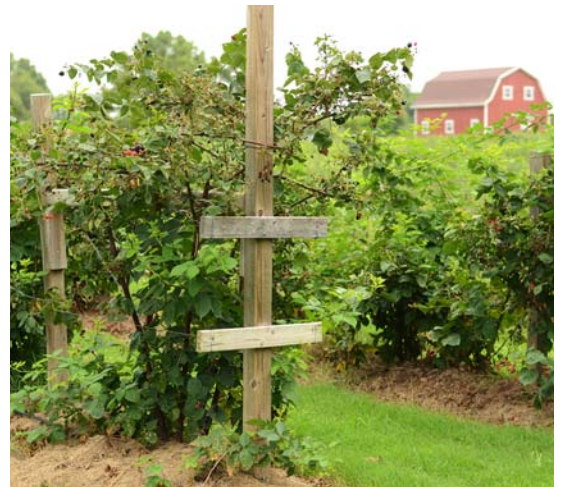
Sta-n-Step Blueberry Farm in Fayetteville, Arkansas, grows u-pick blackberries, raspberries, and blueberries.

A bramble planting is typically managed as a hedgerow, with plant spacing and selective cane removal used to maintain a specific cane density, depending on the species and trellising system. The row spacing for commercial plantings varies from nine to 12 feet with a closer spacing leading to higher yields per acre, and a wider spacing