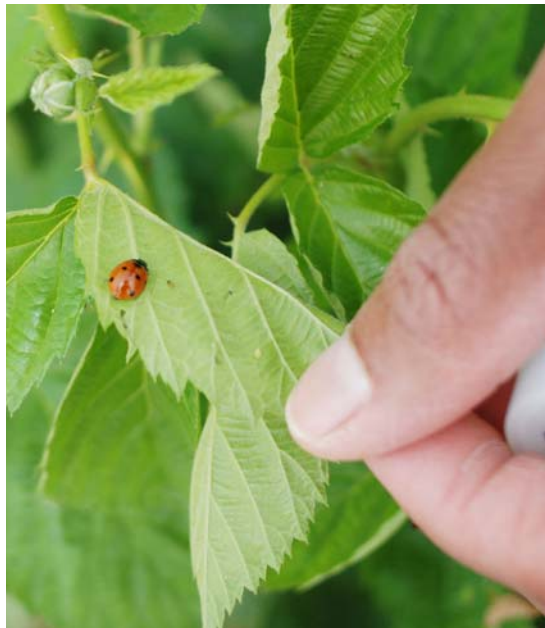
Lady beetles can provide biological control of aphids.

environments, these predators can be added to control aphids successfully. In cases of outbreaks, there are several organic insecticides that are effective, including insecticidal soaps, horticultural oils, and neem (Koester and Pritts, 2003).