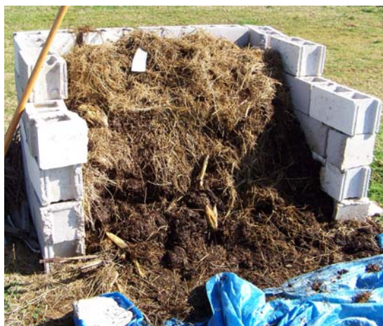
Compost can be used to increase soil organic matter, improve soil quality, and provide some plant-available nutrients.

Be especially cautious to avoid nitrogen over-application and nutrient imbalances when using