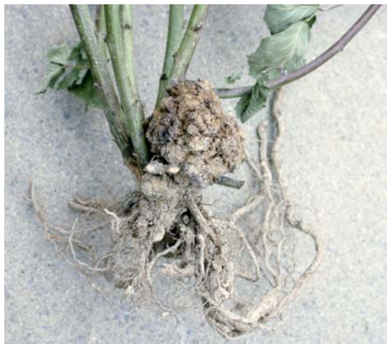
Crown gall on blackberry.