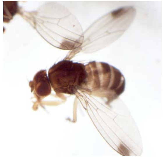
Spotted wing drosophila adults.

consumption, most customers are very uncomfortable with buying blackberries or raspberries that contain fly larvae.