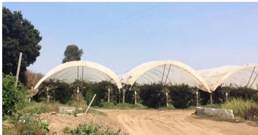
Multi-bay high tunnels are commonly used for bramble production in California.

The Shift Trellis and Rotating-Cross-Arm Trellis are new trellis systems that have been designed for floricanefruiting blackberries to increase productivity and ease of harvest, and allow for protection from winter injury in northern climates. The trellis arms pivot on an axis that allows for cane manipulation to induce fruit formation on one side of the trellis arm, which permits fruit to ripen in the shade. These systems are costly to install and require additional labor for management, but the current results appear promising (Takeda et al., 2013).