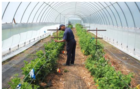
Lady beetles are released inside a screened high tunnel to provide biological control of aphids on blackberries and raspberries.