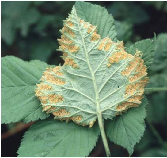
Orange rust ( Arthuriomyces peckianus) on blackberry.