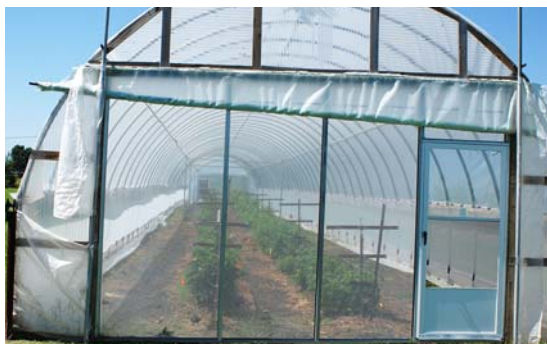
Primocane-fruiting blackberries and raspberries within a high tunnel at the University of Arkansas research farm.

R esearchers at Cornell have found that greenhouse-grown raspberries are larger, firmer, and less prone to fruit rot compared to field-grown raspberries, and that consumers are willing to pay premium prices for off-season local raspberries.