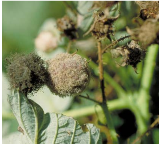
Raspberry fruit covered with fungal growth of gray mold ( Botrytis cinerea ) (right).

found that exhibit activity against B. cinerea (Vos et al., 2015), but no products have been approved yet for use on bramble crops.