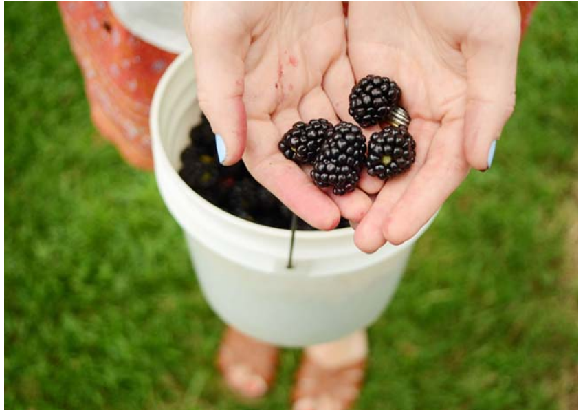
Bramble growers can capitalize on marketing the health benefits of blackberries and raspberries to consumers.

The demand for nutritionally enhanced foods continues to grow. Beyond their vitamin and mineral content, bramble fruits are now known to contain important phytochemicals (naturally occurring compounds). The term nutraceutical refers to a phytochemical substance that may be considered food (or part of a food) and that provides medical or health benefits, such as prevention and treatment of disease. Nutraceuticals represent one of the most important food-industry trends for marketing to an increasingly knowledgeable and health-conscious consumer. Information on nutraceutical properties of bramble fruits can be found at http://berryhealth.fst.oregonstate.edu/ .