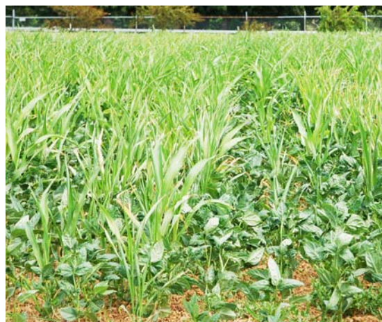
Cover crops can be planted before establishing brambles to improve soil quality, suppress weeds, and increase fertility.

If using landscape fabric or plastic mulch for weed control, consider how this barrier will affect your fertilization strategy. Some landscape fabric materials are permeable and can allow soluble fertilizers to pass through, but plastic mulch and many other weed barriers are not permeable. In the case of non-permeable mulches, liquid fertilizers will need to be injected through the drip line underneath the mulch, or the material will need to be slit or removed to allow for granular fertilizers to be applied in bands. Liquid fish hydrolysate is an organic fertilizer that can be injected through a drip irrigation line, though care must be taken to ensure that the material does not clog drip emitters.