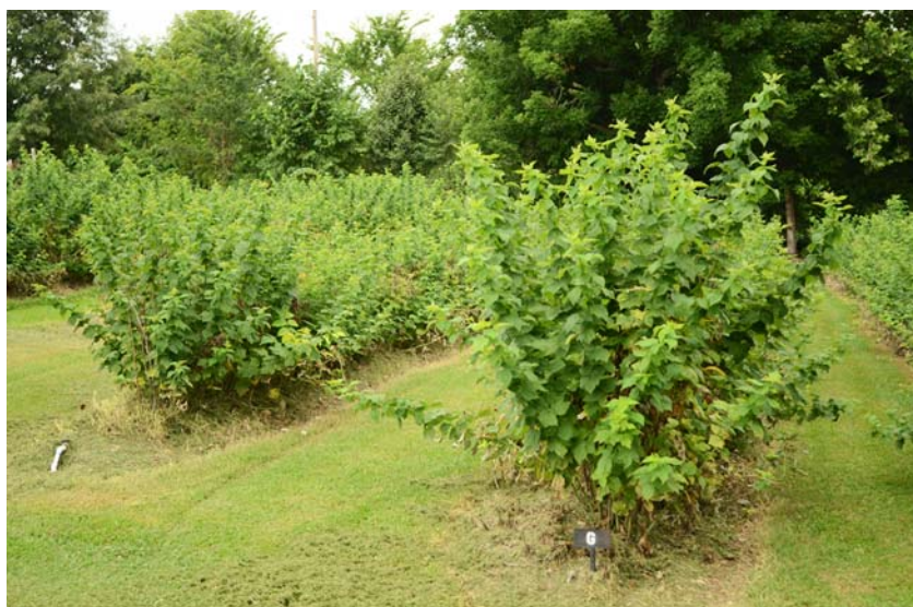
Stay-n-Step Blueberry Farm manages sodded alleyways by mowing.

Legume ground covers can be grown on their own or as a companion to grass species in sodded alleyways. Because they fix nitrogen, legumes will not compete with the bramble crop for soil nitrogen and can potentially contribute nitrogen that becomes available to the bramble crop after the legume ground cover is mowed.