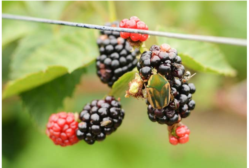
June beetle feeding on blackberries.

Commercial traps use an attractive pheromone that acts as a scent beacon for the beetles, luring them into the trapping container. These lure traps are widely available, but growers and researchers caution that they can end up attracting more beetles than the traps can handle, making the problem even worse.