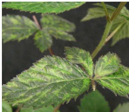
Tobacco Ringspot Virus symptoms on 'Arapaho' blackberry.

There are several bramble viruses of economic importance. Planting virus-free, tissue-culture stock in addition to roguing out and destroying infected plants are important practices in limiting virus spread. In addition, ensuring the site is free of dagger nematode populations before planting will help prevent infection and the spread of viruses. Raspberries can be particularly hard-hit