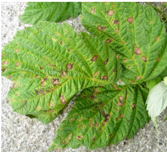
Raspberry leaf spot ( Sphaerulina rubi ).

The incidence of gray mold can be reduced by avoiding and reducing free moisture on plant leaves and flowers. Good management practices such as proper training, trellising, pruning, fertilization, and weed management will improve air flow through the plant canopy to reduce humidity and allow for faster drying of plant leaves. Also, frequent harvests (at least three times per week) will prevent over-ripe fruit from becoming infected and spreading the pathogen. Growing bramble crops under cover in a high tunnel or similar structure in conjunction with drip irrigation will greatly reduce incidence of gray mold by eliminating rainfall on the plant.