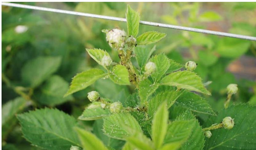
Aphids tend to feed and reproduce near the apical tip of bramble canes and are often associated with ants, which feed on the aphid honeydew.

There are many natural predators of aphids, such as lady beetles and lacewing larvae, which usually keep aphid populations in check. In controlled