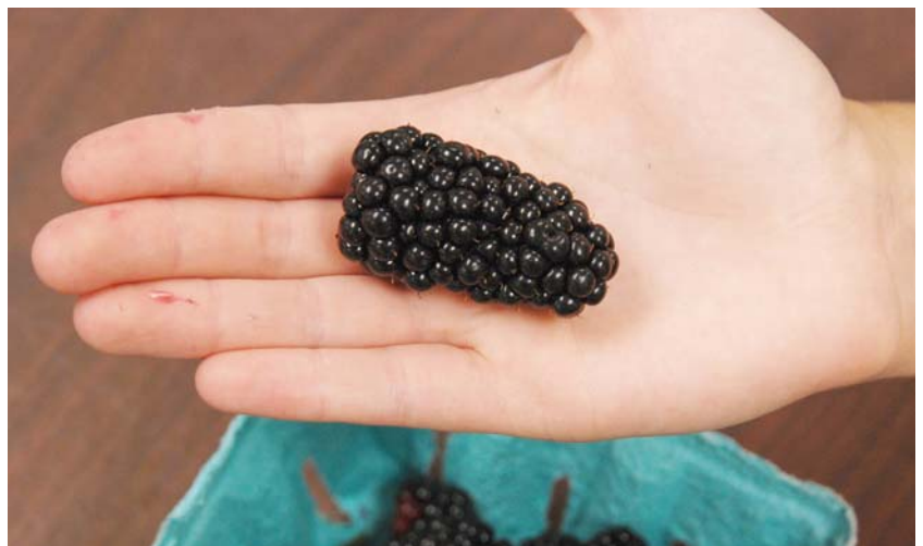
Natchez blackberry can produce very large fruit, which can be a marketing advantage.

When purchasing your plants, it is very important to buy from a reputable supplier to ensure quality planting stock that is disease- and virus-free. There are few restrictions on proximity when planting different varieties and species of brambles on the same farm. One is that black and purple raspberries are much more susceptible to damage from mosaic and leaf curl viruses than are red and yellow cultivars. Because these diseases are vectored by aphids, black and purple varieties should be separated as much as possible and located upwind from red and yellow raspberries (Funt et al., 1999).