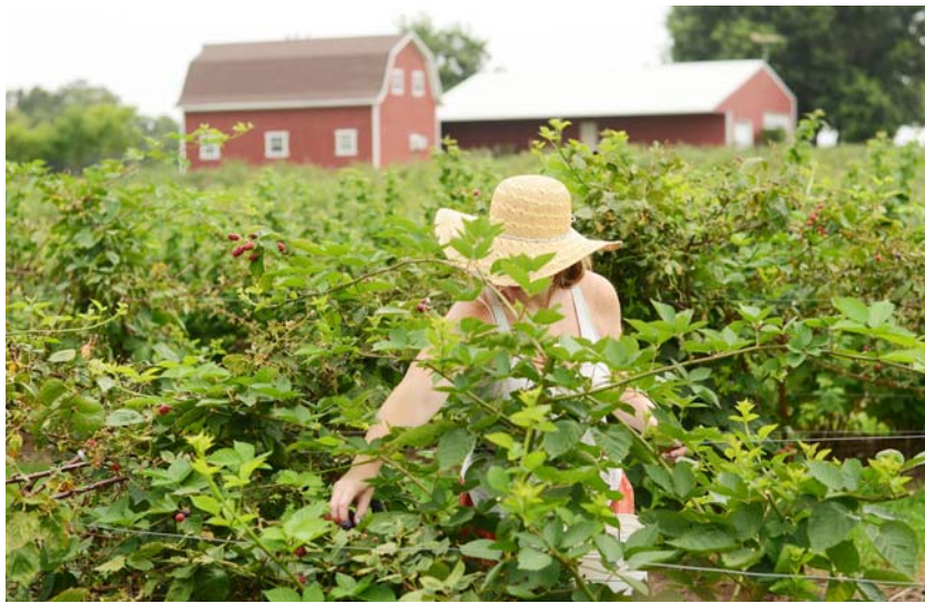
A pick-your-own berry farm can be a good option for berry growers who live close to large populations.

Can you make money growing organic blackberries and raspberries? Brambles can be a very profitable crop, but how profitable they will be for you depends on several factors. To begin with, your market will determine the price you receive for your berries. You will get premium prices selling directly to consumers at farmers markets, roadside stands, or a pick-your-own (PYO) operation. Other options will allow you to sell larger volumes of berries, but at a lower profit margin. These outlets include wholesalers, cooperatives, and local retailers. Small-acreage growers usually find direct marketing a good fit because it can maximize the returns from their limited production. If you are a small-scale grower interested in expanding production, you may find that a mixed model including both retail and wholesale markets would be a good fit for you. For more information on marketing options, see ATTRA's series of Marketing Tip Sheets at https://attra.ncat.org/attra-pub/summaries/summary.php?pub=440 .