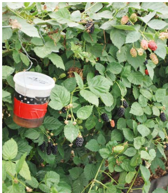
A SWD trap hanging in a blackberry planting.

There are two organic materials effective against SWD: pyrethrin (e.g., PyGanic) and spinosad (e.g., Entrust). However, the OMRI-listed formulations of these materials are very expensive and will not provide 100% control. In addition, the materials must be applied at least once per week and need to be rotated to prevent resistance from developing in SWD populations (Demchak, 2013; Johnson, 2016).