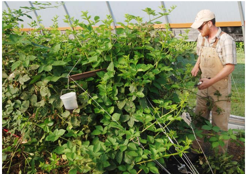
Spent floricanes are being pruned out of the high tunnel blackberry planting at the University of Arkansas research farm.

Mowing can be used in larger-scale plantings to reduce the labor costs of pruning. Primocane-fruiting cultivars that are managed for a single fall crop can be mowed in late winter or early spring,