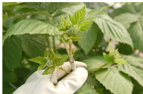
Tipping this raspberry cane has induced lateral branching.

Pruning management will depend on the species and cultivar being grown, in addition to your production region. More detailed information can be found through your Cooperative Extension Service and in the resources listed at the end