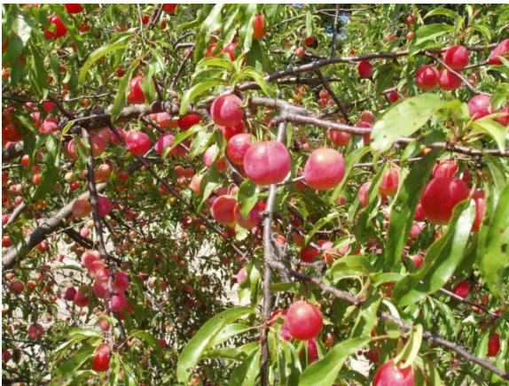
Figure 1. Chickasaw plum in full fruit.

Contributed by: USDA NRCS Manhattan Plant Materials Center & Kansas State University, Forestry Research