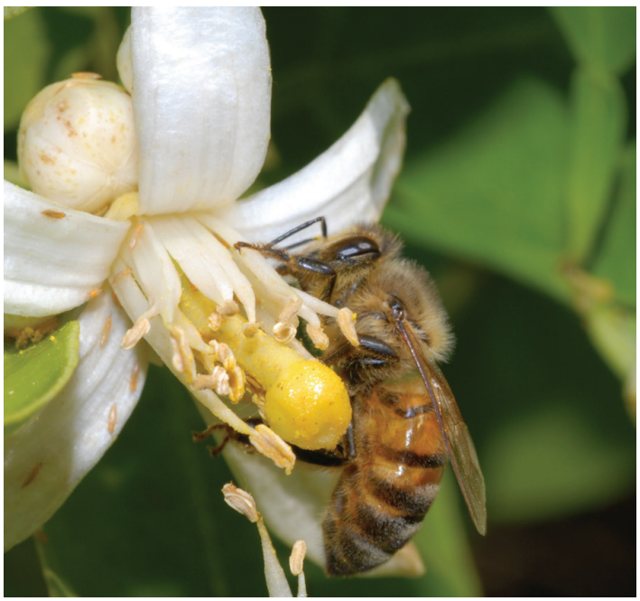
Figure 1. Honey bee on an orange blossom.

Honey bees consume processed nectar (honey) and pollen (bee bread), both of which are provided by flowers (Figure 1). Nectar, which bees convert to honey, serves as the primary source of carbohydrates for the bees. It provides energy for flight, colony maintenance, and general daily activities. Without a source or surplus of carbohydrates, bees will perish within a few days. This is why it is important to make sure that colonies have sufficient honey stores during the winter months. Colonies can starve quickly! Nectar also is a source of various minerals, such as calcium, copper, potassium, magnesium, and sodium, but the presence and concentration of minerals in nectar varies by floral source.