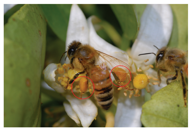
Figure 3. Worker bee carrying pollen in her pollen baskets.

It has been observed that honey bee workers choose pollen based on the odor and physical configuration of the pollen grains rather than based on nutritive value. A typical-size honey bee colony (approximately 20,000 bees) collects about 57 kg of pollen per year. On average, 15%-30% of a colony's foragers are collecting pollen. A single bee can bring back a pollen load that weighs about 35% of the bee's body weight. Bees carry this pollen on their hind legs on specialized structures commonly called "pollen baskets," or corbicula (Figure 3).