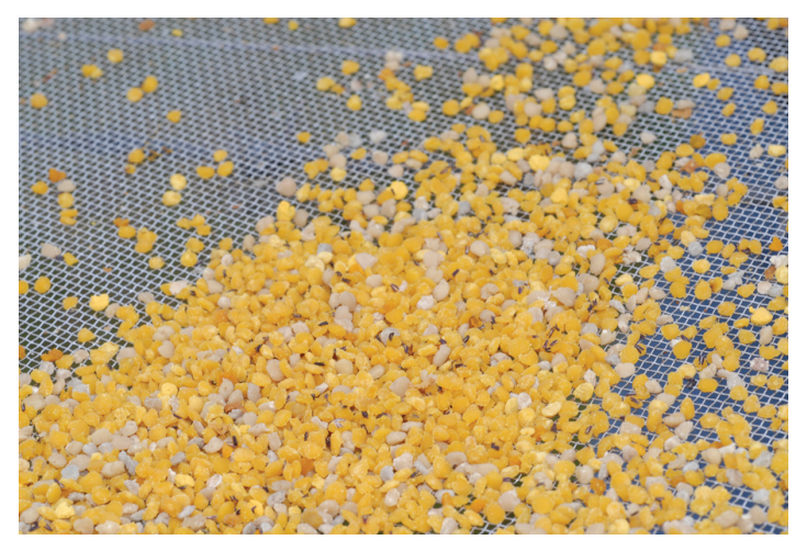
Figure 4. Pollen that has been collected from a pollen trap placed on the bottom board of a bee hive.

microbes to the pollen and they produce enzymes that help the pollen release nutrients and amino acids. Bee bread is consumed by a colony relatively quickly and only stored for a couple of months if there is a surplus. A colony's annual requirement for pollen has been estimated to range from 15 to 55 kg.