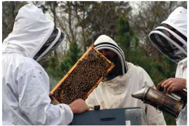
Figure 3. Scientists are trying to determine the source of Colony Collapse Disorder.

http://www.freshfromflorida.com/Divisions-Offices/Plant-Industry/Pests-Diseases/Colony-Collapse-Disorder