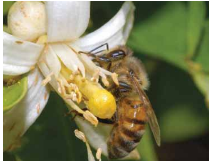
Figure 2. Honey bees are important pollinators of the nation's crops. Pollen adheres to bees' bodies when they visit flowers (like this citrus flower in picture a). As they go from flower to flower, they transport the pollen between flowers, thus pollinating the flowers. Flowers that are adequately pollinated produce fruit, vegetables, or nuts. Higher fruit set, larger fruit, uniformly-shaped fruit, and better taste are all indications of successful pollination.

Honey bees are important pollinators of the nation's crops. Pollen adheres to bees' bodies when they visit flowers (like this citrus flower in Figure 2). As they go from flower to flower, they transport the pollen between flowers, thus pollinating the flower. Flowers that are adequately pollinated produce fruit, vegetables, or nuts. Higher fruit set, larger fruit, uniformly-shaped fruit, and better taste are all indications of successful pollination.