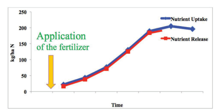
Figure 3. The ideal fertilizer: the nutrient release is synchronized with the crop's nutrient requirements. Credits: Adapted from Lammel 2005

To match crop nutrient requirements, the ideal fertilizer should have this characteristic: the nutrient release matches the nutrient requirements of the crop throughout all of the plant growth stages (Figure 3). Obviously, QRFs do not have this characteristic, and they cannot meet such requirements without repeat applications. Fortunately, using deliberate applications of CRFs and SRFs in specific circumstances where they are appropriate can accommodate timely plant nutrient demand requirements, maximize nutrient use efficiency, and minimize environmental concerns. There is a close relationship between CRFs and BMPs. Section 32 of Water Quality/Quantity Best Management Practices for Florida Vegetable and Agronomic Crops (2005 edition) discusses CRFs and BMPs including planning and application of CRFs.