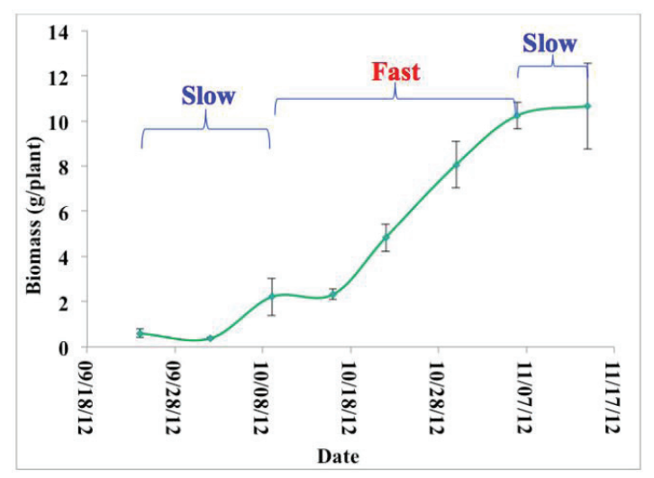
Figure 1. Growth curve of snap bean (variety: Bronco) in fall 2012. Credits: Guodong Liu, UF/IFAS

fertilizer is applied, a one-time or seasonal application of conventional fertilizers has the potential to lose much more nitrogen than would be lost with multiple split-applications of fertilizer (Figure 2). Split applications of convention fertilizer are recommended (Hochmuth and Hanlon 2013).