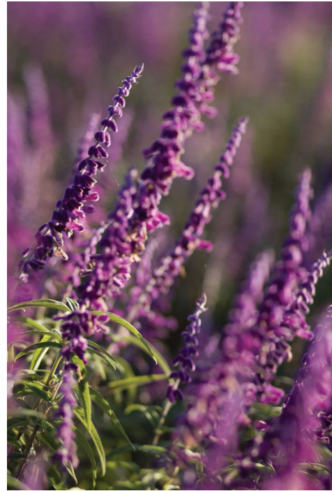
Figure 8. Mexican sage.

Poinsettias: Pinch back poinsettias and mums before the end of the month to allow time for buds to form for winter bloom. See Poinsettias : https://edis.ifas.ufl.edu/topic_poinsettia