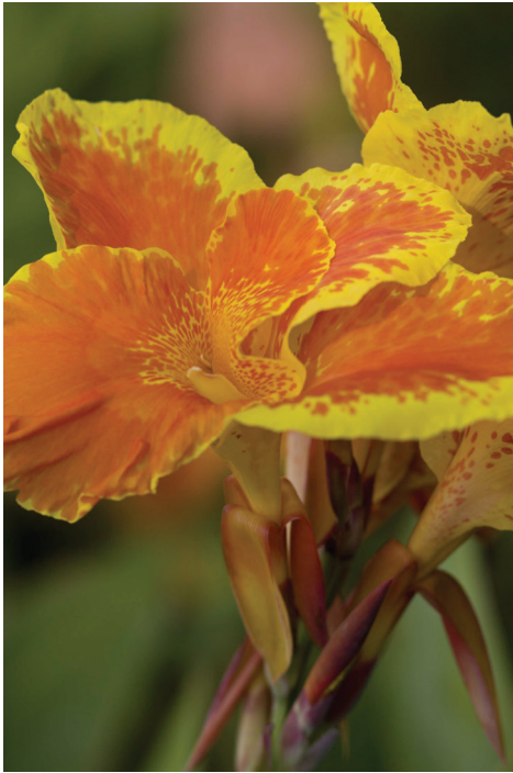
Figure 5. Canna.

Oleanders: Inspect chewed or ragged leaves for oleander caterpillars at work. See Oleander Pest Management : https://edis.ifas.ufl.edu/topic_oleander_ipm