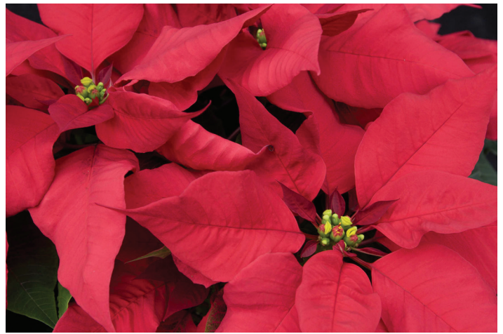
Figure 12. Poinsettia.

Poinsettias: Enjoy one of the most popular holiday plants. Protect it from cold until spring, and then plant it in the garden for next year. See Poinsettias : https://edis.ifas.ufl.edu/topic_poinsettia