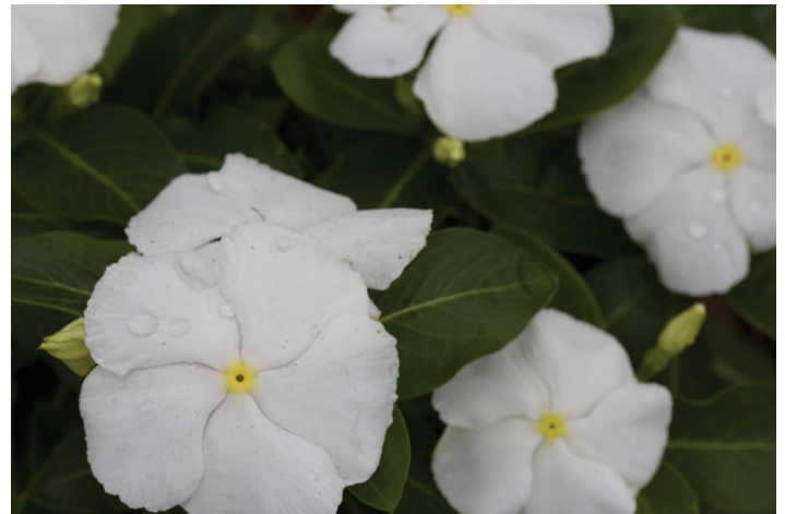
Figure 6. Vinca.

Vegetables: Plant tropical vegetables, such as boniato, calabaza, and chayote this month. See South Florida Tropicals : https://edis.ifas.ufl.edu/topic_series_south_florida_tropicals and Chayote : https://edis.ifas.ufl.edu/topic_chayote