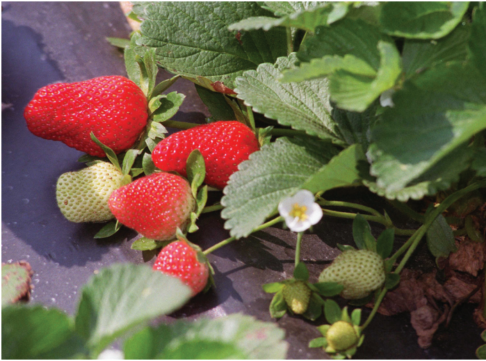
Figure 10. Strawberries.