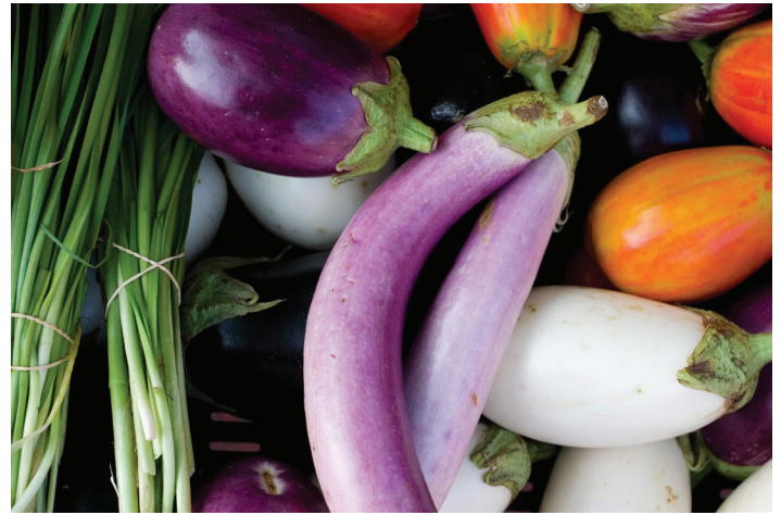
Figure 2. Eggplant.

Vegetables: Winter vegetable gardening is in full swing. Last month to plant cantaloupes, cucumbers, eggplant, lettuce, peppers, spinach, and tomatoes for a late spring harvest. Protect crops in the unlikely event of a frost or freeze. See Vegetable Gardening in Florida : https://edis.ifas.ufl.edu/topic_vegetable_gardening