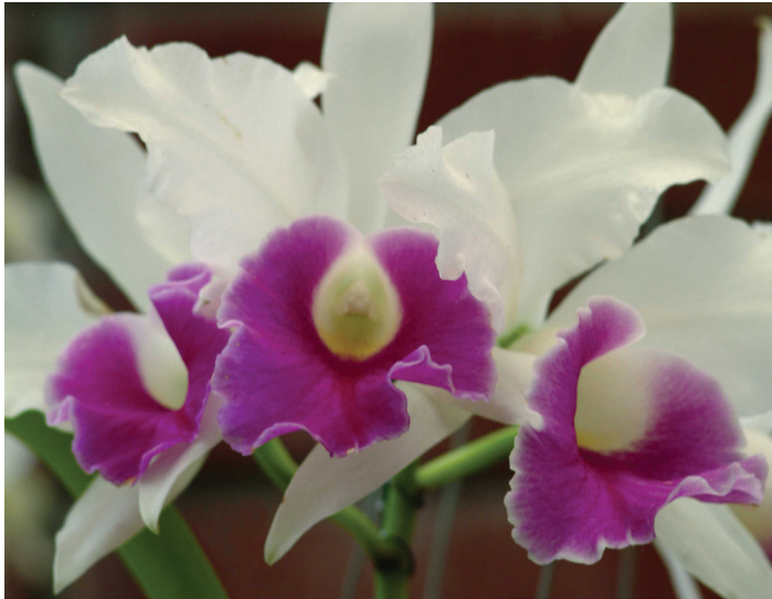
Figure 1. Cattleya orchid.

Pests: Apply horticultural oil to citrus, shrubs, and deciduous fruit trees while plants are dormant to control scale. Apply copper spray to mangoes after bloom. See Landscape Pest Management : https://edis.ifas.ufl.edu/topic_landscape_pests