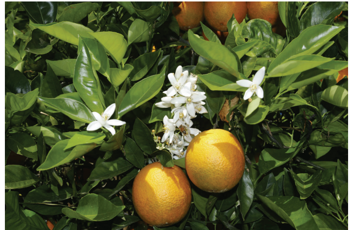
Figure 7. Oranges.

Palms: Continue planting palms while the rainy season is in full swing. Support large palms with braces for 6–8 months after planting. Do not drive nails directly into a palm trunk. See Palms : https://edis.ifas.ufl.edu/topic_palms