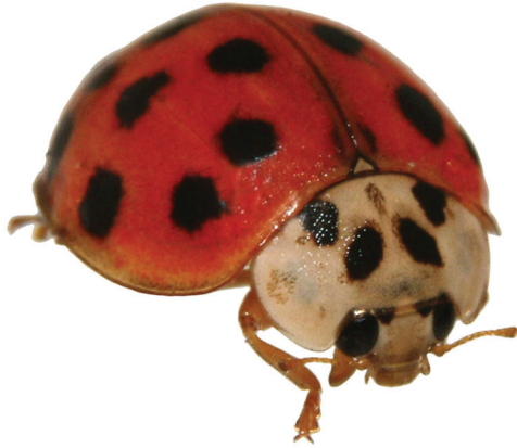
Figure 4. Lady beetle.

Vegetables: Beans, Chinese cabbage, Southern peas, and sweet potatoes can still be planted. Mulch beds well and monitor irrigation if the weather is dry. See Vegetable Gardening in Florida : https://edis.ifas.ufl.edu/topic_vegetable_gardening