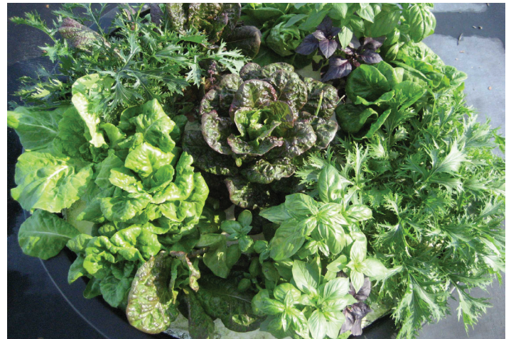
Figure 11. Hydroponic lettuce and herbs.

Vegetables: Lots of choices exist for November including beans, broccoli, kale, snow/English peas, and strawberries. See Vegetable Gardening in Florida : https://edis.ifas.ufl.edu/topic_vegetable_gardening