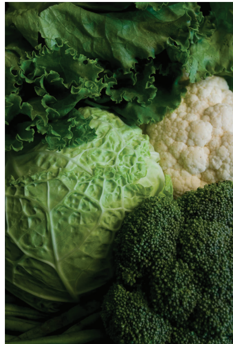
Figure 9. Cabbage, cauliflower, and broccoli.

Irrigation: Check that irrigation systems are providing good coverage and operating properly before summer rains taper off. See Landscape Irrigation : https://edis.ifas.ufl.edu/topic_landscape_irrigation