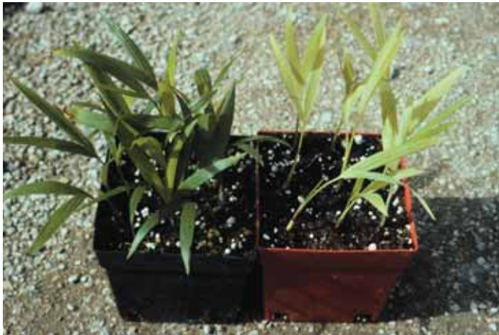
Figure 2. Nitrogen deficiency in Chamaedorea seifrizii (bamboo palm) seedlings on right.

on the oldest leaves (Figure 3). As symptoms become more severe, marginal and/or tip necrosis of the distal leaflets on the oldest leaves may also occur (Figure 4). In some species there is no spotting, and leaflet marginal or tip necrosis will be the only symptom. In many of these species, these necrotic leaflet tips will be curled or frizzled in appearance. Potassium deficiency symptoms are always more severe towards the tip of a leaf and least so towards the leaf base. Similarly, symptoms decrease in severity from oldest to youngest leaves.