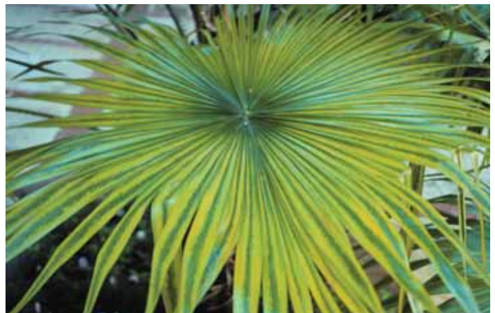
Figure 5. Magnesium-deficient older leaf of Livistona rotundifolia showing broad yellow bands along the margins of individual leaflets.

Iron deficiency is relatively common in container-grown palms, especially those grown in the same container for long periods of time. Over time, most organic substrate components such as bark or peat decompose to poorly aerated muck. It is poor soil aeration that is responsible for the vast majority of Fe deficiency, since under anaerobic conditions, roots cannot respire and produce the energy needed to actively take up Fe from the soil. Root rot diseases or soluble salts injury, which reduce root surface area, are also commonly expressed above ground as Fe chlorosis.