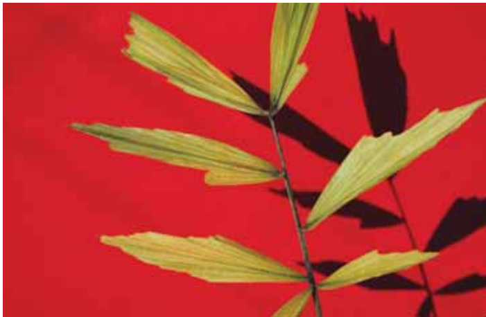
Figure 7. Iron-deficient new leaf of Caryota mitis (clustering fishtail palm) seedling.

The only other nutrient deficiency occasionally encountered in container production of palms is Mn deficiency. In mild form, its symptoms are identical to those of Fe deficiency except that interveinal or longitudinal necrotic streaking will be superimposed on the chlorotic leaflets of new leaves (Figure 9). As the deficiency increases in severity, the distal parts of affected leaflets will become completely necrotic and curled. Manganese deficiency symptoms are most severe towards the bases of new leaves and least so towards the tip (Figure 10).