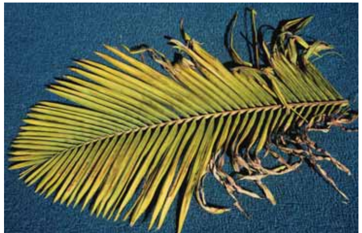
Figure 10. Manganese-deficient new leaf of Archontophoenix alexandrae showing most severe symptoms towards the leaf base.