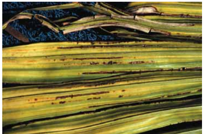
Figure 9. Leaflets on youngest leaf of Mn-deficient Archontophoenix alexandrae (Alexandra palm) showing longitudinal necrosis.