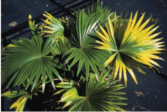
Figure 6. Magnesium deficiency in Livistona rotundifolia showing broad yellow bands around the periphery of entire leaves.

Symptoms of Fe deficiency occur only on the youngest leaves, but in a chronic state, the entire palm crown may be chlorotic. Newly emerging Fe-deficient leaves are either uniformly yellow-green to nearly white, or may have slightly greener veins (Figure 7). In a few species, such as Syagrus romanzoffiana , Rhapis spp., and some Licuala spp., these chlorotic new leaves may have diffuse 1/8-inch green spots scattered throughout the leaf (Figure 8).