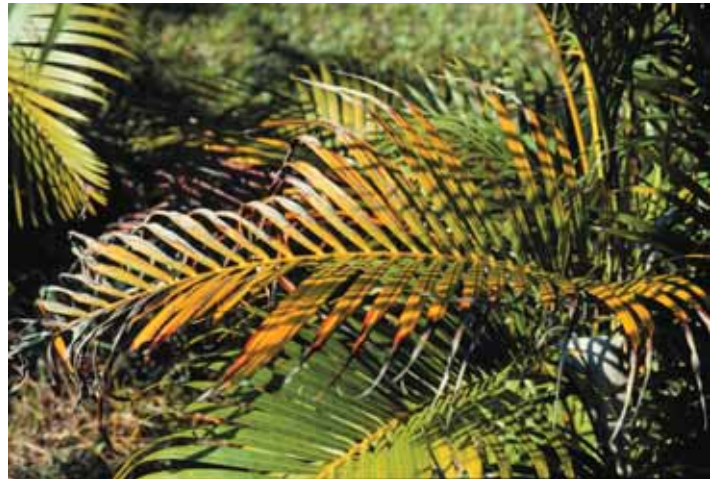
Figure 4. Potassium-deficient older leaf of Dypsis lutescens (areca palm) showing discoloration and marginal and tip necrosis.

the central portion of the leaf or leaflet remains distinctly green. Potassium deficiency differs from Mg deficiency in that with K deficiency there is a gradual transition from green at the base of an old leaf, through yellow or orange discoloration in the middle, and finally to leaflet tip necrosis at the end of the leaf. Magnesium deficiency never causes leaflet tip necrosis and, if this is observed on an obviously Mg-deficient leaf, it is because K deficiency is also present on that leaf.