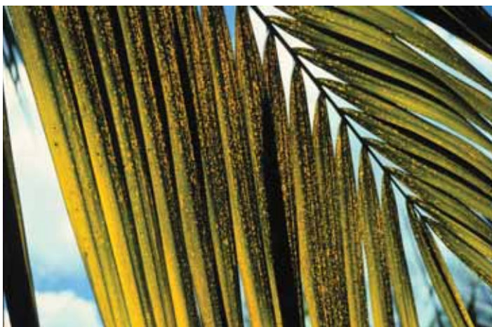
Figure 3. Potassium-deficient older leaf of Dictyosperma alba (hurricane palm) showing translucent yellow-orange spotting.

Magnesium deficiency may occur on palms held for long periods of time in the same container, since the dolomite incorporated into the potting substrate initially is usually exhausted after about six months. It will also be seen on palms growing in substrates to which insufficient dolomite has been added. Symptoms of Mg deficiency are most severe on the oldest leaves and appear as broad yellow bands along the periphery of the entire leaf, or in some fan palms, around each leaflet (Figures 5 and 6). In all cases,