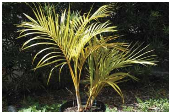
Figure 1. Nitrogen-deficient container-grown Dypsis lutescens (areca palm) showing typical discolored leaflets and golden petioles and leaf bases.

Nitrogen deficiency symptoms in palms begin first on the oldest leaves as a uniform light green coloration. The golden-colored petioles and leaf bases commonly observed on container-grown Dypsis lutescens are caused by N deficiency (Figure 1). As symptoms progress, the entire canopy except for the spear leaf becomes uniformly chlorotic (sometimes nearly white in color) and growth rate is reduced sharply (Figure 2). Palms can linger in a chronic N-deficient state for some time.