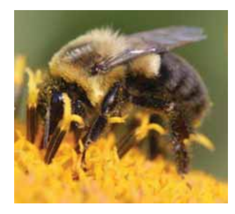
Eastern Bumble Bee

Even our most important managed pollinator, the European honey bee, is not faring well with increased incidence of disease and stress from pesticides and inadequate food supplies.