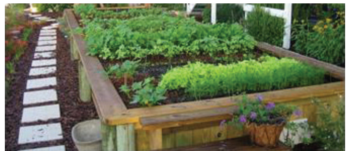
Figure 2. Raised beds can be elaborate and esthetically pleasing.

Next, determine the size and height of the raised bed. It should be no wider than 4' because most people can only comfortably reach 2' to the center. The length varies and depends on the site. A common size is 4' wide x 8' long x 16"–24" deep. The height really depends on the level that is most comfortable for you and the investment you want to make in materials. The site may lend itself to multiple beds but make sure to give yourself ample room between beds—about 18"–24". Beds can be various shapes (e.g., square, rectangle, L shaped, triangle). Raised beds can be basic or very elaborate and esthetically pleasing in the landscape (Figure 2).