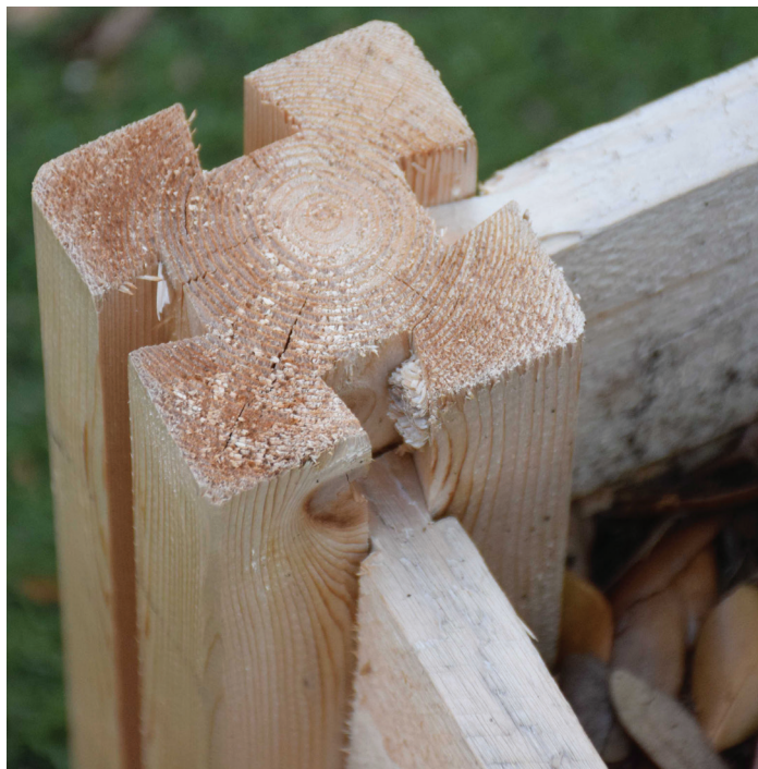
Figure 4. Example of corner post with grooves that allow 2" wood sides to slide in which makes it easy to construct and dismantle. Credits: Terry DelValle, UF/IFAS

long sides). Purchase ninety 3" long deck screws. Stainless steel screws are preferred when using ACQ treated lumber. However, if you are on a limited budget, look for screws with a coated finish guaranteed not to corrode when used with ACQ treated lumber.