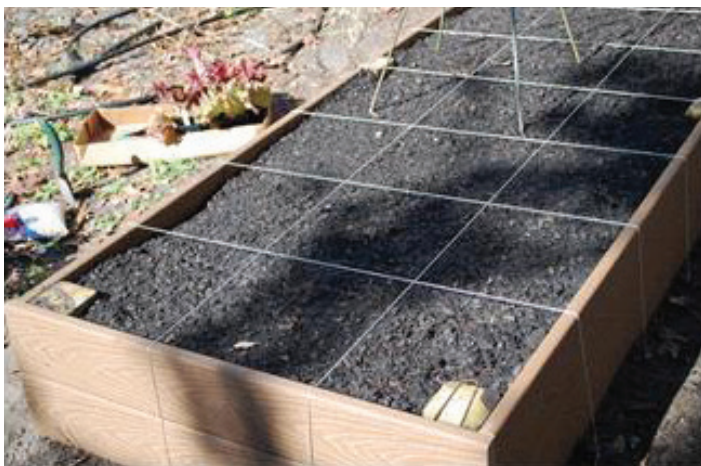
Figure 3. A raised bed using synthetic wood is more expensive than ACQ treated lumber but will last longer.

Options for building materials include stone, bricks, concrete blocks, synthetic/recycled materials, or wood. If using concrete, pre-cast concrete blocks are acceptable to use for creating raised beds for edibles. But if using poured-in-place concrete, there are potential problems associated with some of the curing compounds, stains and sealers that are sometimes used, and with the release agents typically used on the wood forms. Wood is the most common material and is relatively inexpensive, but untreated lumber starts to rot within a year. For longevity and cost effectiveness, use ACQ Ground Contact treated lumber, which is treated with new copper preservatives and approved by the Food and Drug Administration for food production. Cedar, redwood, and synthetic wood (Figure 3) are also durable, but they are more expensive than ACQ treated lumber. Avoid using railroad ties or old pressure-treated lumber purchased prior to 2004 for edibles because of the potential for food contamination from creosote and arsenic.