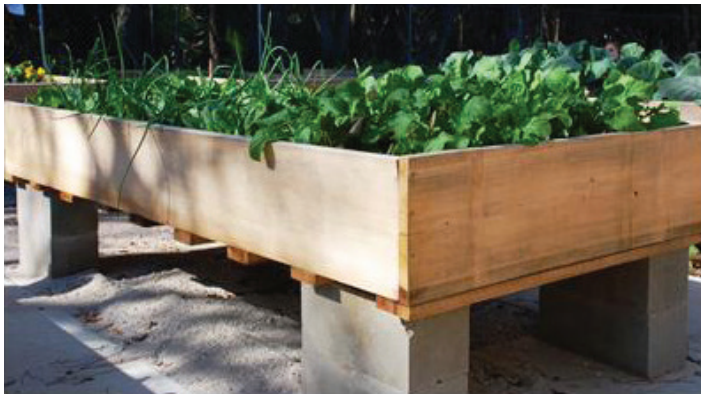
Figure 1. Example of an elevated raised bed ideal for individuals in wheel chairs or for those who cannot bend over.

Raised beds offer many advantages. Traditional gardening takes a toll on knees and backs, whereas gardening in raised beds helps save the joints (Figure 1). Many gardeners cannot grow vegetables in traditional gardens because soils are poor, too wet, compacted, or plagued with nematodes and other soilborne pests. Raised beds allow you to control the soil to avoid these issues. Another plus is that soils aboveground heat up more quickly so you can get a jump on the spring gardening season. Also, raised beds are typically more productive than in-ground vegetable gardens because the planting medium is easier to improve and there is no wasted space for walkways between rows.