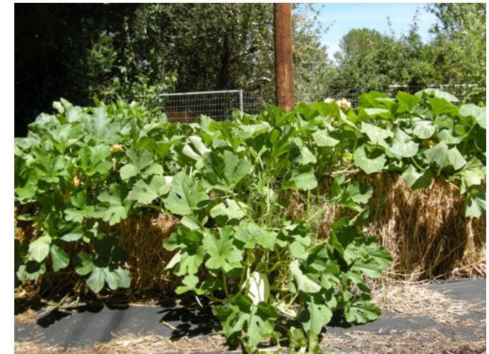
Straw bales in midseason.

Straw is baled from the dry stalks (culms) that remain after seed heads have been harvested from a grass crop such as wheat. They are not intended for consumption by animals. Ideally, straw bales come from a clean, weed-free field and will be free of seeds.