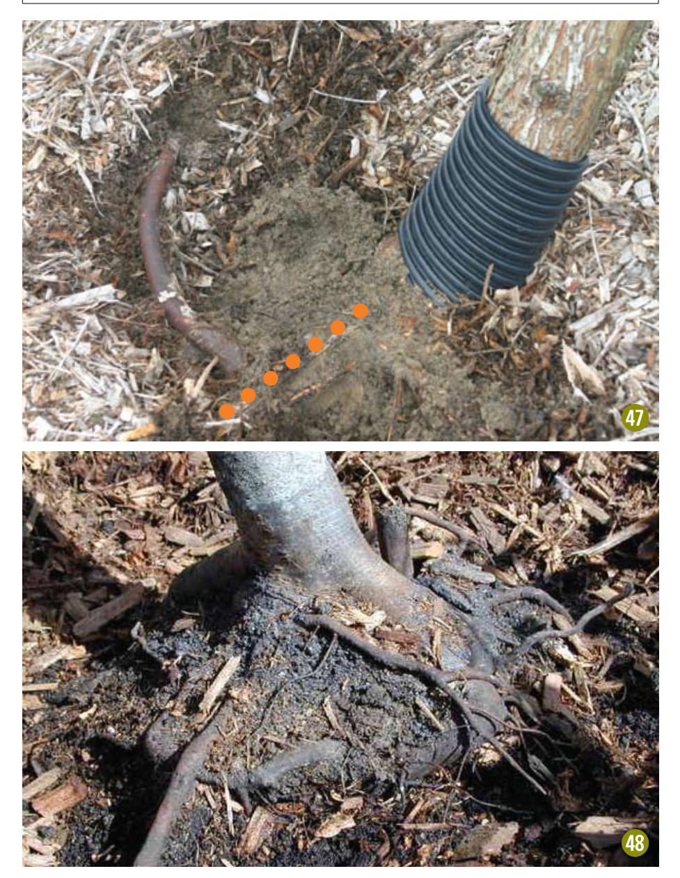
Figure 4 7

Before deciding whether to stand small leaning or downed trees up, look for the presence of circling roots. Some circling roots can be removed and the tree will respond with increased vigor (Figure 47). Other trees will need to be removed (Figure 48). If roots circle around most of the tree trunk, the tree is not restorable because girdling roots inhibit secondary growth and the movement of water and photosynthates.