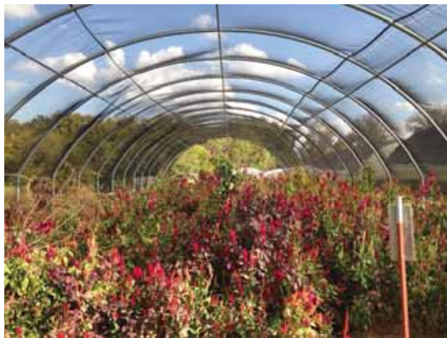
Figure 3: High tunnel with only a shade cloth covering.

dimensions for high tunnel size, they typically range from 14 feet x 30 feet up to 30 feet x 96 feet and can vary in design (Figure 5). Some growers elect to construct their high tunnels on skids so they can move the structure for crop rotational purposes.