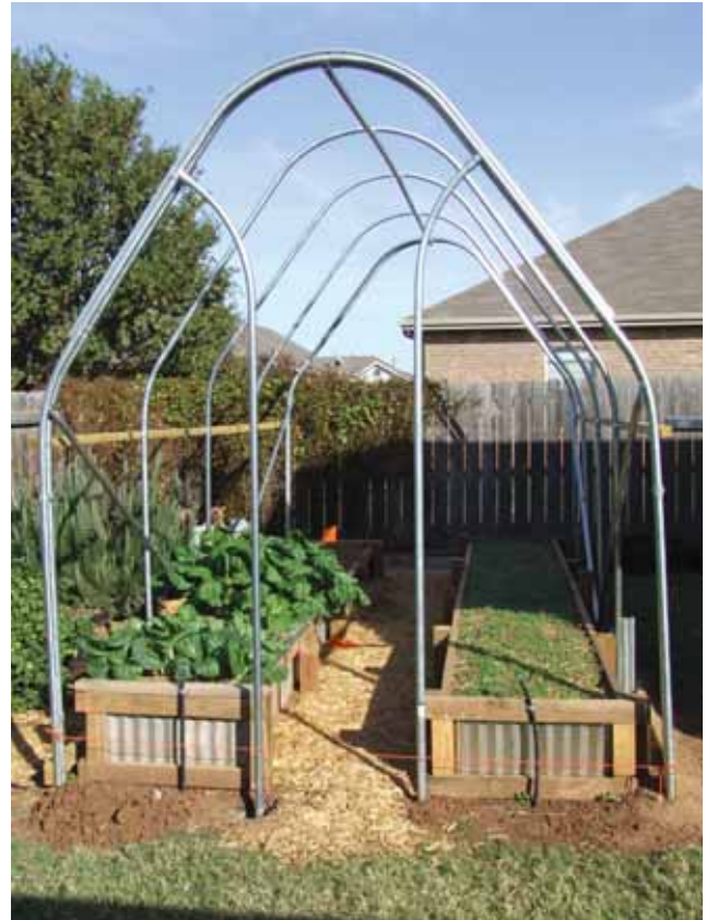
Figure 4. A small hobby high tunnel.

Because high tunnels are lightweight structures that lack a solid foundation, the poles must be well anchored in the soil. For non-movable high tunnels, the frame poles should be sunk 2 feet to 3 feet into the ground to provide support during storms and high winds (Figure 6). For movable high tunnels, anchor posts must be sunk, and the structure attached to