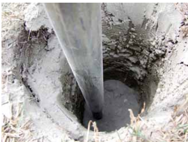
Figure 6. High tunnel poles set in concrete.

are generally from the southwest in the summer and from the north in the winter, but specifics must be determined for each site by accessing Oklahoma climatology data ( http://climate.ok.gov/index.php/climate ). High tunnels placed perpendicular to prevailing winds typically receive the most damage.