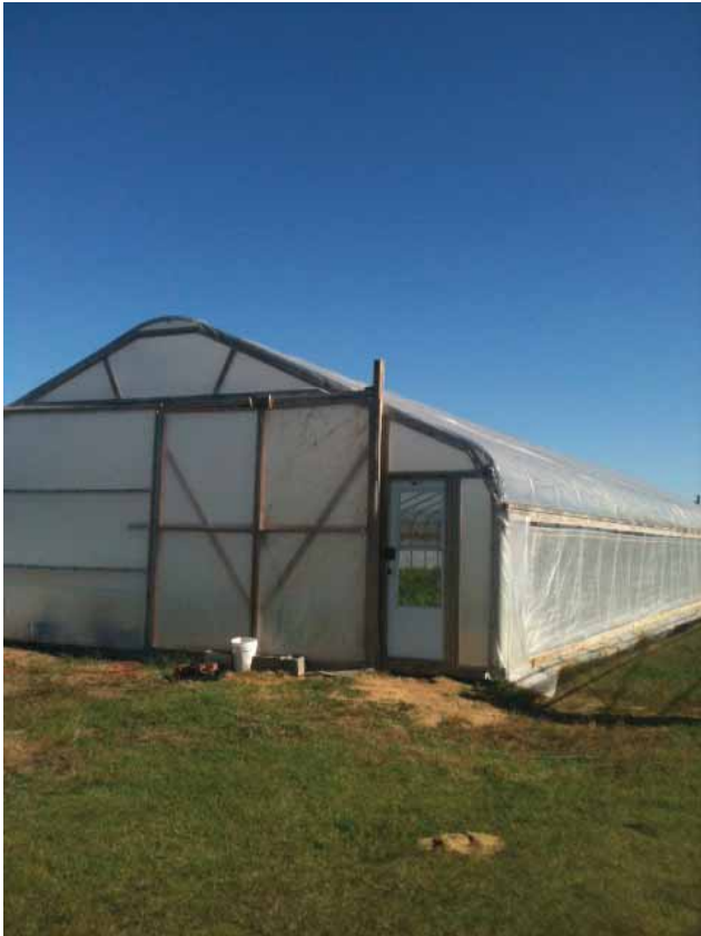
Figure 2. High tunnel with plastic covering.