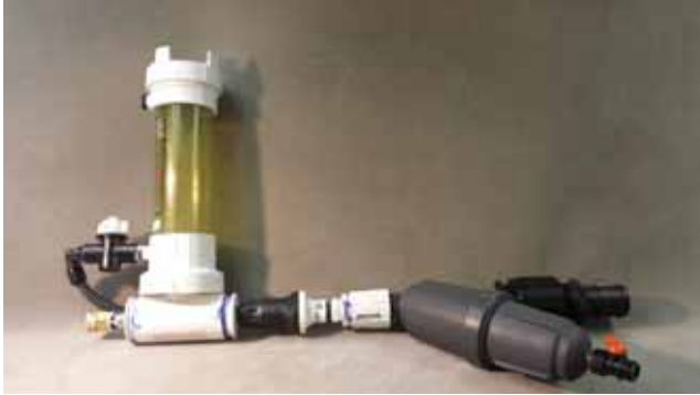
Figure 7. Injector system to add fertilizer through irrigation lines.

becomes a persistent problem, consider incorporating organic matter or other soil amendments to help improve overall soil drainage.