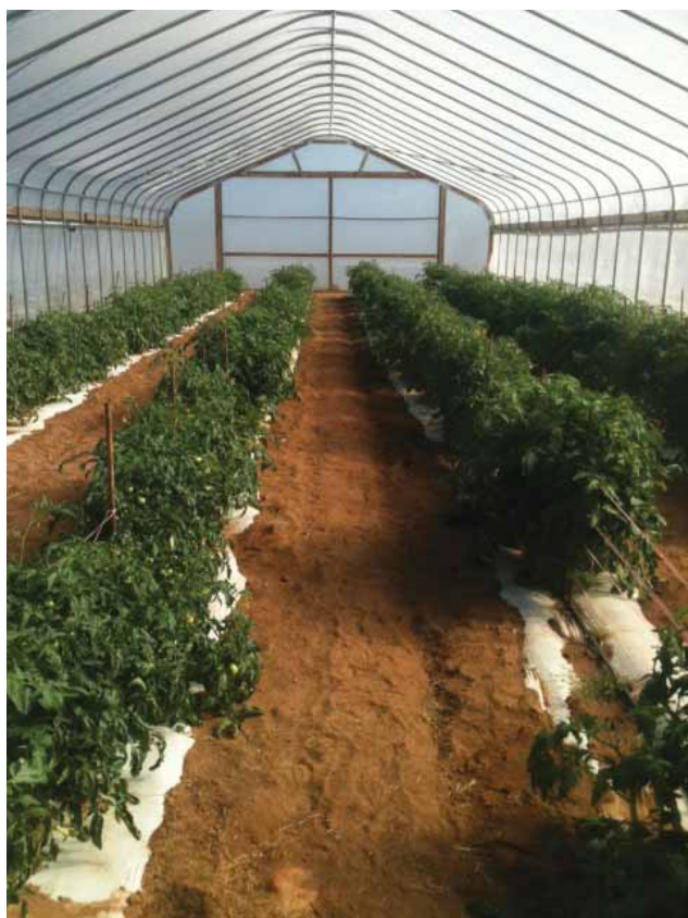
Figure 8. Tomato production in a high tunnel.

Warm-season crops such as tomatoes are almost exclusively grown in high tunnels in certain parts of the country (Figure 8). In New England, farmers have been using high tunnels for tomato production for more than a decade. Unpredictable summer weather and wind-transferred fungal diseases were the primary drivers behind this practice. High tunnels allow tomatoes to be staked or trellised, which can help increase tomato production and limit waste from soil