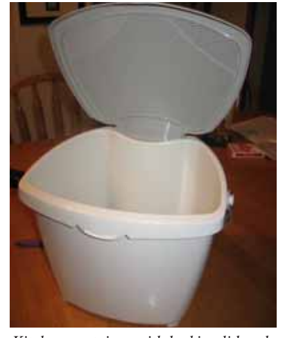
Kitchen container with locking lid and aeration holes.