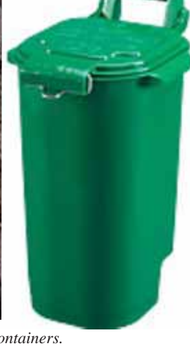
Reusable curbside collection containers.