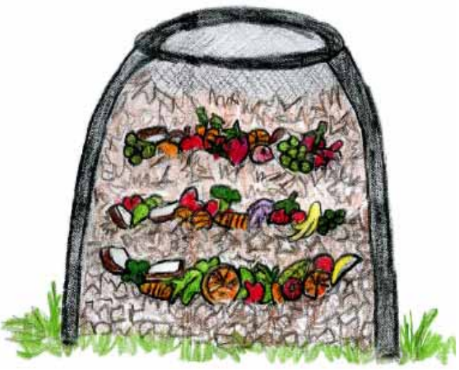
Cross-section of layered browns and greens.

Layering and choosing the right organic material creates the right environment for compost to "happen". Start with a layer of coarse "browns" in contact with the soil. Make a well or depression in this layer and put the "greens" into the well. Keep the food scraps away from the outside edges of the pile (only brown material should be visible). Cover your "greens" with a generous layer of "browns" so that no food is showing. This will keep insect and animal pests out of the pile and filter any odor. Keep adding layers of greens and browns (like making lasagna). Keep layering the feedstock until the mass reaches a height of 3 to