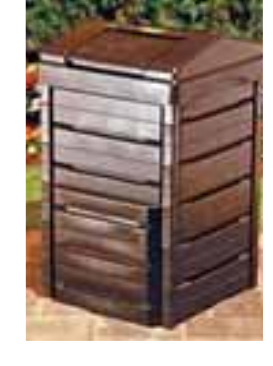
Manufactured on-ground compost units.

a product more quickly, turning will help to speed the process. The pile can be turned with a pitch fork or shovel, which helps to break up material and better homogenize the mass.