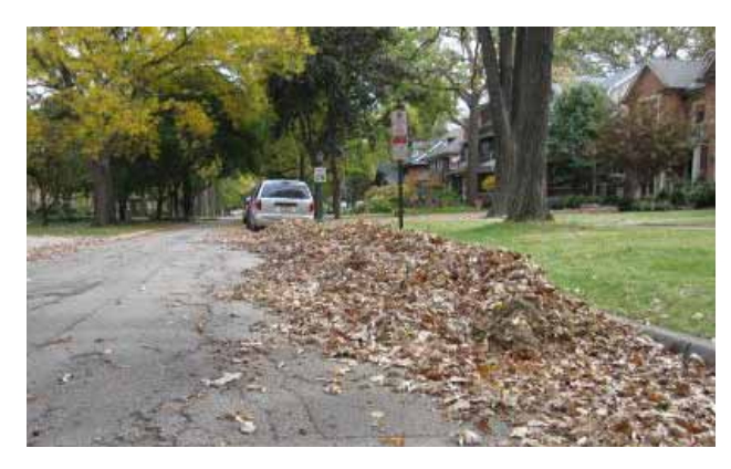
Loose leaves curbside.