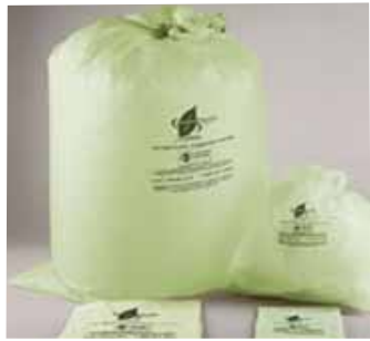
Compostable plastic bags.

more expensive than the petroleum-based bags but may save in labor.