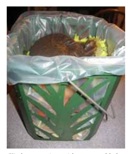
Kitchen container with compostable bag.

There are several kitchen collection containers on the market, but you can also use a recycled container or pail with or without a lid. Containers should allow air to flow through your scraps so that they will not smell before incorporation into the compost bin. Placing your food scraps in layers with crumpled newspaper can also help with odor by absorbing some of the moisture in the food. Some manufactured kitchen collection containers include a charcoal filter or have holes in the bucket to help with potential odors. Some require the use of liners (paper or compostable bags) to hold the scraps inside the bucket. As with fresh fruit sitting on your counter, collection containers may attract fruit flies in warm weather.