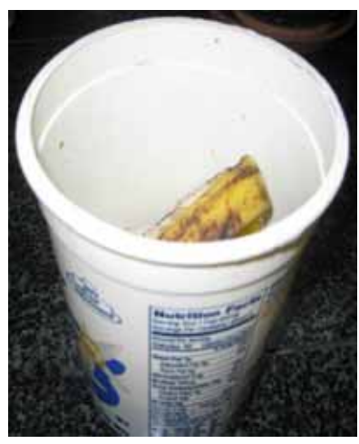
Recycled kitchen container.