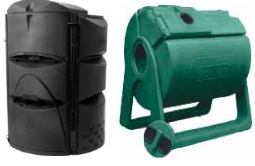
Manufactured continuous feed compost units.

• Continuous Feed Compost Units: These composters are designed to be fed daily. Feedstocks go in one end and compost comes out the other. These include rotating drum and bin composters that are designed specially to push waste through the system, and also include indoor, electric composters.