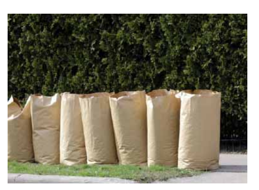
Paper leaf bags.

• Paper bags: Paper leaf bags can be a good choice since they have a base that allows them to stand up while loading, and can be incorporated into the compost along with the leaves which avoids the debagging process. However, they can be more expensive to purchase.