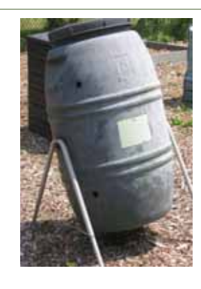
Manufactured rotating drum compost units.

• Rotating Drum Compost Units: These units are off the ground on stands or bases. They are turned either with a handle or by pushing the drum. Most drums are batch compost units in which you add feedstocks as they are generated, but with each green addition, the process is interrupted, lengthening the composting time. For best results, the drum should be full to create a batch; compost activity occurs while you are filling but conditions are not optimal until it is full. To improve processing, 2 drums can be used consecutively, or a holding bin and drum can complement each other. Some are designed with side-by-side drums for this purpose. Once the drum is full, turn it as directed to mix the feedstocks until you have a finished product.