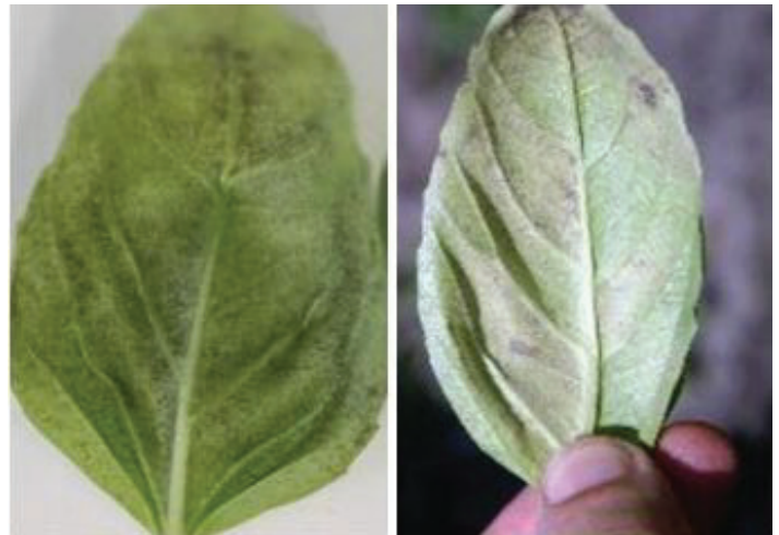
Figure 3. Sporulation evident on underside of the basil leaf.