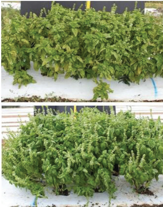
Figure 1. Symptoms of downy mildew on field-grown basil (top) compared with healthy basil plants (bottom).

leaf surface and chlorosis of the adaxial (upper) leaf surface make basil leaves unacceptable for the marketplace.