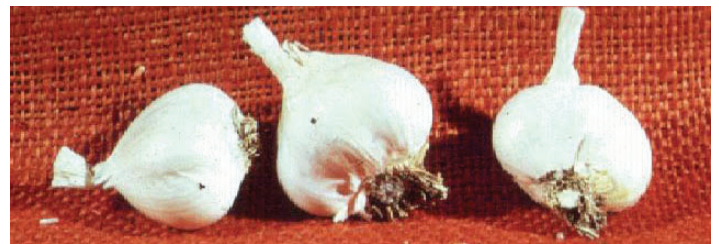
Figure 1. Garlic bulbs

Garlic must be well dried and cured after harvest before being stored. This can be accomplished outdoors if no rain occurs or indoors in a dry shed.