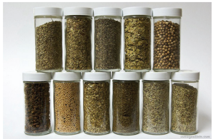
Figure 5. Herbs and spices in clear containers should be stored in the dark.

As soon as leaves or seeds are dry, they should be cleaned by separating them from stems and other foreign matter and packed in air-tight containers to prevent loss of the essential oils that give herbs and spices their delicate flavor. Clear glass or plastic containers (Figure 5) should be painted or kept in a dark place to prevent light from bleaching the leaves. Tip: Fresh herbs can also be stored in the freezer. First clean, de-stem, and chop them. Then add them to ice cube trays with a small amount of water. Once frozen, remove the cubes from the tray and place them in a labeled freezer bag for later use in soups and stews.