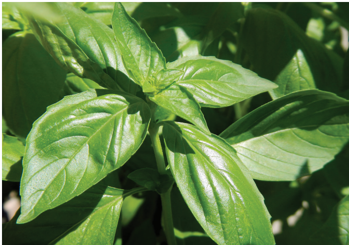
Figure 6. Basil.

Basil ( Ocimum spp.) is a fragrant warm-season herb with a spicy taste (Figure 6). There are many types of basil ranging in size, color, and taste. While sweet basil is the most commonly grown, varieties like Thai, purple, cinnamon, lemon, and others also exist. African blue basil produces abundant flowers that attract bees, but the plant's flavor is unappealing. Plant basil transplants or seeds from early spring through fall and pinch off and use the flavorful stem tips as it grows. This will encourage branching and more foliage. Remove any flower spikes that form or the leaves will lose flavor. The tender leaves may be used fresh at any time or dried. Basil prefers moist (not soggy) soil and occasional light applications of fertilizer. It is easy to root from cuttings. Basil Downy Mildew is a devastating fungus disease in Florida. Select disease-resistant cultivars such as 'Amazel Basil', 'Pesto Besto', and others.