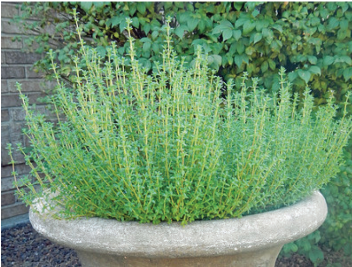
Figure 16. Thyme growing in a container.

Thyme ( Thymus vulgaris ) is a shrubby perennial herb with tiny gray-green leaves (Figure 16). Purplish flowers are formed at the ends of the stems. Some varieties are creeping while others grow upright to 18 inches. Lemon thyme is a variety that adds lemon flavor and aroma. Plant in full sun and well-drained soil. Thyme is drought tolerant. Replant thyme every three to four years for best growth because it tends to get woody. Thyme leaves and flowers can be used fresh or dried.