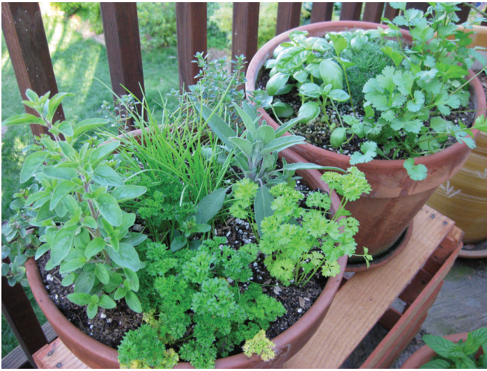
Figure 2. Potted herbs growing on a balcony.

In general, most herbs/spices will grow satisfactorily under the same conditions as vegetables, that is, ample sunlight and well-drained soil. However, some herbs have different fertilizer and watering needs than vegetables. For example, sage, rosemary, and thyme require soil on the drier side, whereas parsley, chervil, and mint grow best with considerable moisture. Group herbs with similar water needs together. The addition of organic matter to sandy soil is particularly beneficial to herbs that prefer moist soil. Refer to the Florida Vegetable Gardening Guide for additional cultural information: https://edis.ifas.ufl.edu/publication/vh021 .