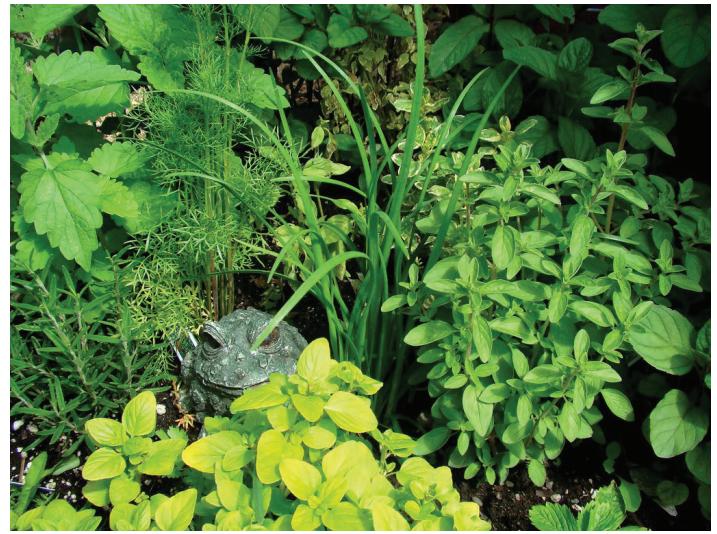
Figure 1. Herb garden.

Locate herbs and spices where they can be conveniently accessed for use. Herbs and spices are often grown in a vegetable or herb garden (Figure 1). However, the appealing foliage and flowers of many herbs and spices also make them attractive additions to flower beds and containers. Herbs in the Apiaceae plant family (e.g., dill, parsley, fennel) are good additions to butterfly gardens because they provide food for the caterpillars of black swallowtail butterflies (see Table 1). Note that some herbs, especially mints, tend to proliferate and become weedy if allowed to grow unchecked.