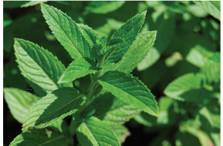
Figure 12. Mint.

or small potted plants. In Florida, mints grow profusely in shade or full sun and like plenty of moisture. The leaves and flowering tops are used, both fresh and dried. Mint is an aggressive spreader and is best grown where it can be contained.