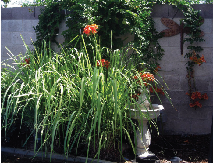
Figure 11. Lemongrass.

in rich soil with regular irrigation, because it does not like to dry out. Propagation is by division.