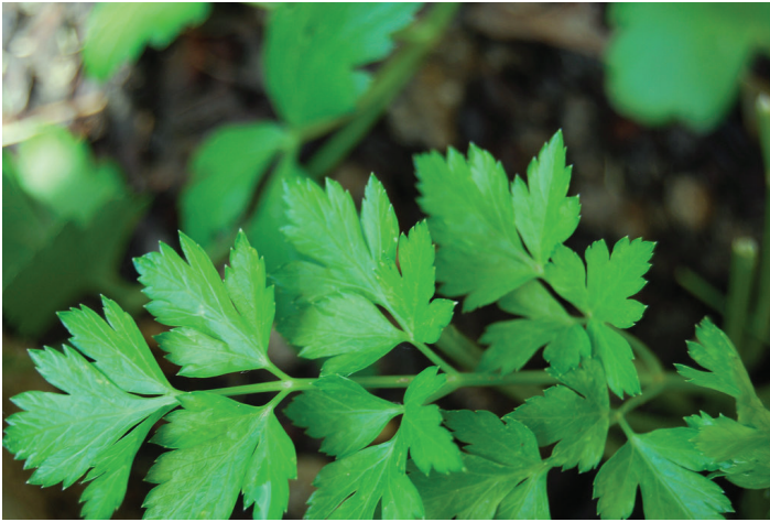
Figure 13. Italian flat-leaf parsley.