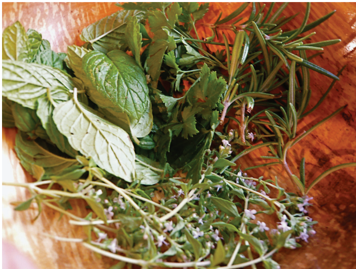
Figure 4. Harvested herbs.

The flavor of herbs and spices arises from the volatile or essential oils contained in them. The flavor is retained longer if the herbs are harvested at the right time and properly cured and stored. Young, tender leaves should be picked as needed (Figure 4) and used immediately. For later use, gather leaves in the morning and keep them moist and refrigerated.