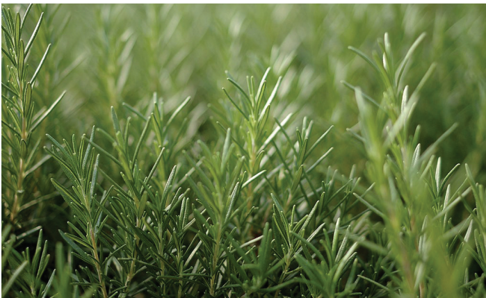
Figure 14. Rosemary.

Rosemary ( Rosmarinus officinalis ) (Figure 14) is a perennial, 2'–3', evergreen shrub with a spicy aroma. The small, narrow, green leaves are used fresh or dried in many cuisines. Small lavender flowers form in the second or third year. Rosemary is difficult to propagate from seeds, so it is best to start with cuttings or a purchased plant. Once established, rosemary is drought and salt tolerant and grows well in sunny, dry locations. It will suffer from overwatering and shade. Rosemary can be enjoyed as an attractive low-maintenance shrub in a water-wise or coastal landscape.