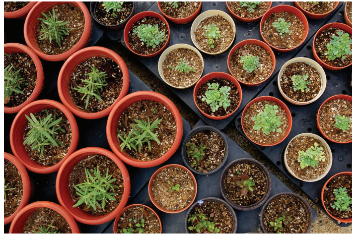
Figure 3. Propagating herbs from cuttings (left) and seeds (right).

Starting herbs from seed allows the herb gardener to grow varieties that are not readily available in local garden centers. The planting depth is usually listed on the seed packet, or you can use this rule of thumb: plant no deeper than twice the diameter of the seed. Tiny seeds can be pressed into the soil and lightly covered. Seeds can be directly seeded into the garden or started in containers; plant at 2–3 week intervals to ensure a continuous harvest.