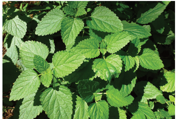
Figure 10. Lemon balm.

Lemon balm ( Melissa officinalis ) is a lemon-scented perennial herb belonging to the mint family. The plants grow in clumps 2 feet high with bright-green leaves (Figure 10). Plants are started from seeds or cuttings. Sow seeds shallowly in moist, fertile soil in early spring in a sunny location; space plants 18 inches apart. It may take two years before the plant forms a well-sized clump. Leaves and tender stems are used fresh or dried to flavor drinks, salads, or other dishes.