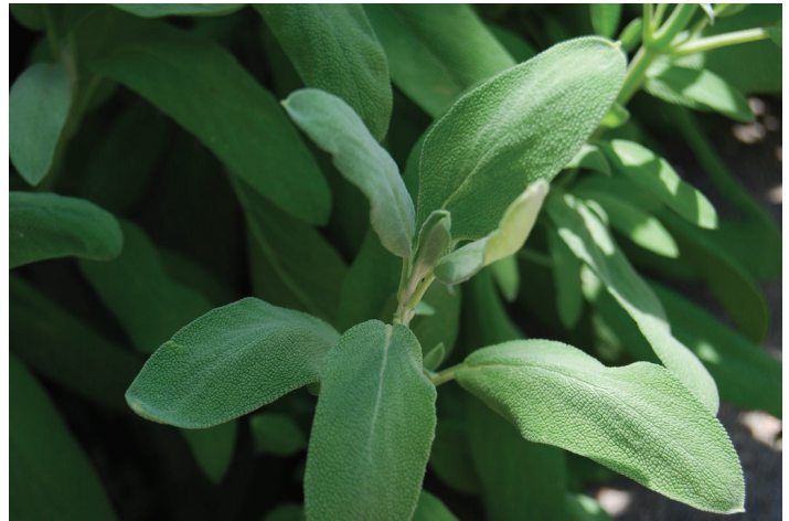
Figure 15. Sage.

the branches to prevent flowering, which will maintain the optimal flavor of the leaves. Leaves are used fresh or dried. In the landscape, sage is an attractive, low-growing border plant. Plant sage in full sun in well-drained soil.