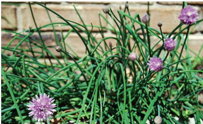
Figure 7. Chives.

encourage new growth. Divide clumps every few years to revitalize them. Chives can also make an attractive addition to landscape beds.