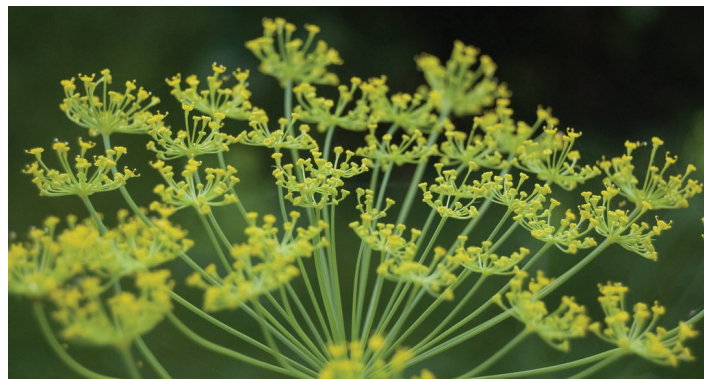
Figure 8. Dill flower head.

The young leaves and seeds of dill ( Anethum graveolens ) give dill pickles their name. It is an erect, strong-smelling, annual plant reaching a height of 4 feet. The yellow flowers (Figure 8) develop into fruits that can be used fresh or dried. Dill does best in mild weather, not too hot or cold, so plant in early fall and spring. Provide a sunny location and rich, well-drained soil. Fruiting tops may be used fresh or dried along with young leaves and portions of the stems. Be aware that the caterpillars of the black swallowtail butterfly feed on dill, fennel, and parsley, so you may want to plant a little extra.