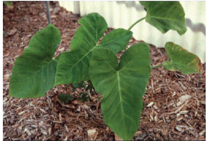
Figure 1. Malanga plant.

Malanga is widely grown and used in the tropics. In South Florida, it has been grown in small patches for many years, and on a limited commercial sale since 1963 to meet the demands of Latin Americans living here. There were about 2,500 acres of malanga grown in Dade County, Florida, in 1985. Malanga, along with calabaza and boniato, made up most of the 14,000 acres of tropical vegetables grown in Dade County in 1991.