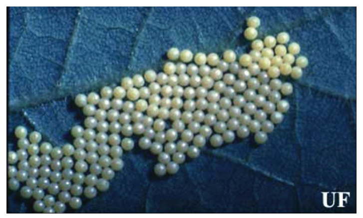
Figure 2. Eggs of the saltmarsh caterpillar, Estigmene acrea (Drury).