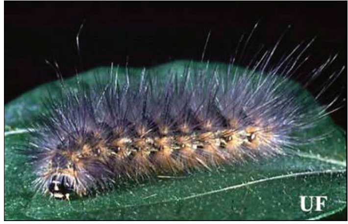
Figure 6. Mature saltmarsh caterpillar, Estigmene acrea (Drury).