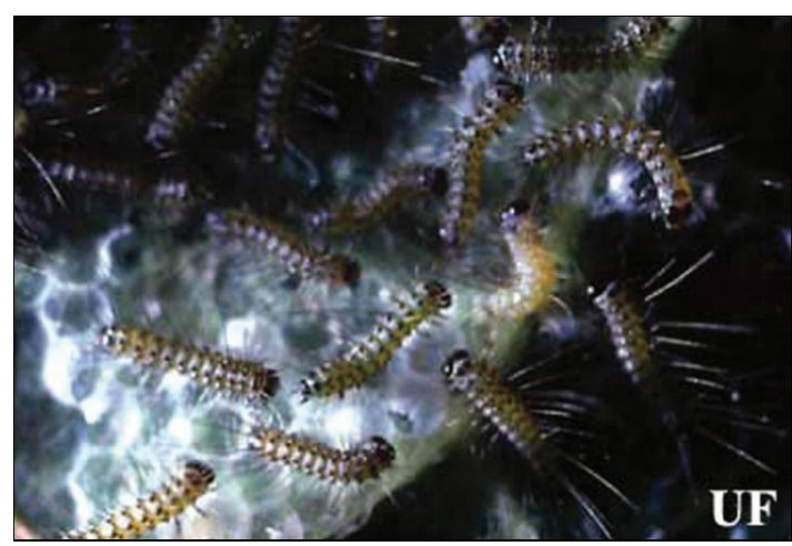
Figure 3. Aggregation of young saltmarsh caterpillars, Estigmene acrea (Drury).

spin a strand of silk, and are blown considerable distances by wind. Frequency of distribution by wind is unknown.