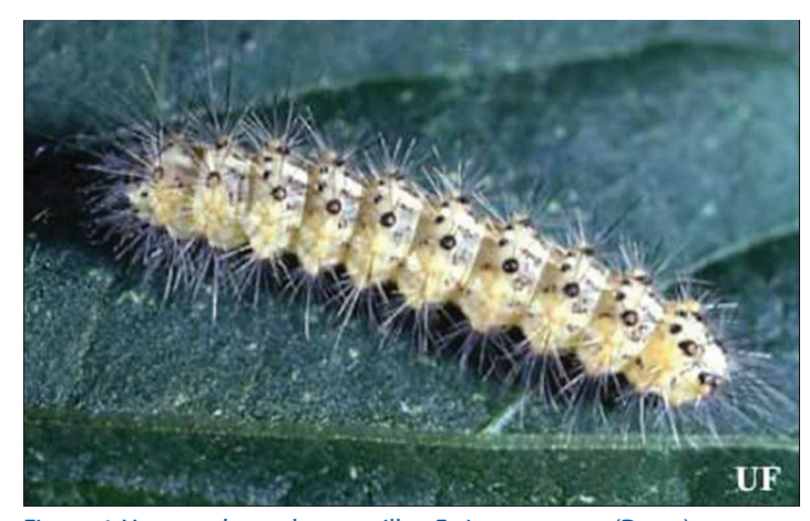
Figure 4. Young saltmarsh caterpillar, Estigmene acrea (Drury).