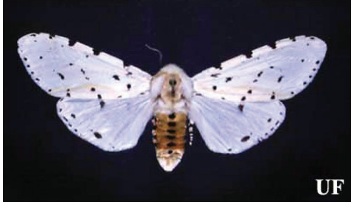
Figure 8. Adult female saltmarsh caterpillar, Estigmene acrea (Drury).

Adults are fairly large moths, measuring 3.5 to 4.5 cm in wingspan, and are distinctive in appearance. They are predominantly white in color, although generally the wings bear numerous, small, irregular black spots. The hind wings of the male are yellow; those of the female are white. The underside of the male's front wings may also be tinted yellowish. Most of the abdominal segments are yellow and bear a series of large black spots dorsally. Mating occurs the evening following emergence, and egg deposition the next evening. Females usually live only four to five days but may produce more than one cluster of eggs.