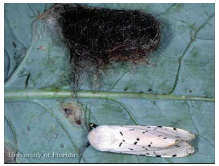
Figure 7. Pupa (above) and adult of the saltmarsh caterpillar, Estigmene acrea (Drury).

Pupation occurs on the soil among leaf debris, in a thin cocoon formed from silken hairs interwoven with caterpillar body hairs. The dark brown pupae measures about 30 mm in length. Duration of the pupal stage is about 12 to 14 days.