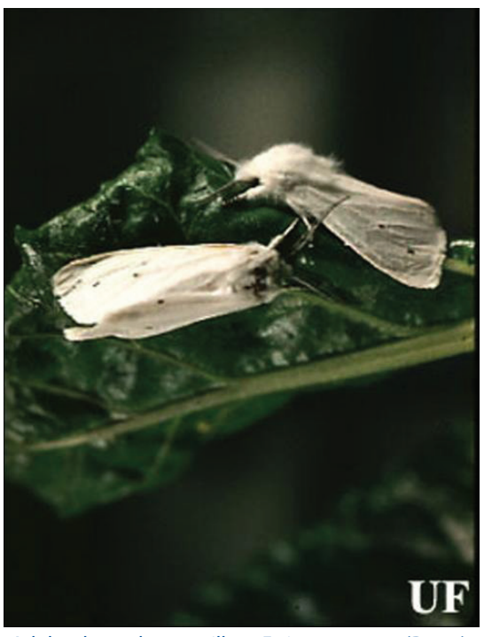
Figure 1. Adult saltmarsh caterpillars, Estigmene acrea (Drury).

A generation can be completed in 35 to 40 days under ideal conditions, but most reports from the field suggest about six weeks between generations. The number of generations per year is estimated at one in the northern states to three to four in the south. Overwintering reportedly occurs in the mature larval stage, with pupation early in the spring. Saltmarsh caterpillars usually are infrequent early in the season but may attain high numbers by autumn.