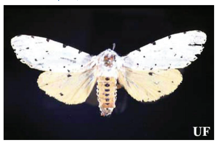
Figure 9. Adult male saltmarsh caterpillar, Estigmene acrea (Drury).