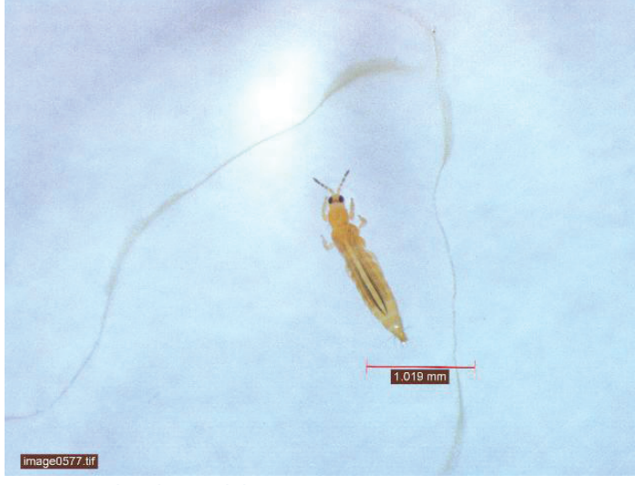
Figure 8. Melon thrips adult.

Melon thrips arrived in Miami-Dade Country in 1990 and caused defoliation of squash, cucumber, beans, pepper, eggplants, and okra. Later, it spread to Broward, Palm Beach, and Collier Counties. Melon thrips occur in all seasons when a proper host crop is available. However, peak abundance of melon thrips is usually observed from December to May. Larvae and adults on the undersurface of the leaves feed on the epidermal layer. Adults of melon thrips and other species can also be found in blooms. Melon thrips developed resistance to various groups of chemical insecticides. Management of melon thrips is based on cultural practices meant to increase predatory bugs (minute pirate bugs, lady beetles, lace wing bugs) and proper use of effective chemicals, such asspinetoram (Radiant), cyazypyr (Exirel), and abamectin (Agrimek).