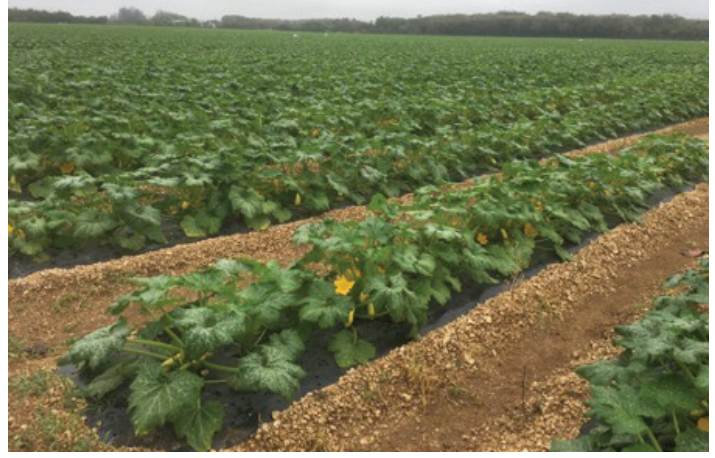
Figure 2. Yellow squash grown on plastic mulch in Miami-Dade County.

Irrigation is applied to squash using sprinkler systems such as lateral move/center pivot or big guns. Some growers are using plastic mulch to save irrigation water and suppress weeds (Figure 2). Principles and practices of irrigation management are discussed in Chapter 3 of the Vegetable Production Handbook for Florida https://edis.ifas.ufl.edu/ entity/topic/vph.