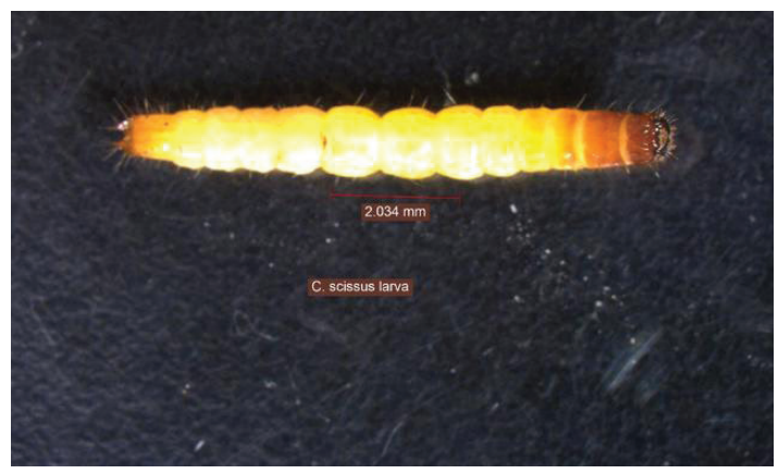
Figure 10. Conoderus scissus wireworm larva.

significant economic loss to the host crops in the absence of proper cultural control.