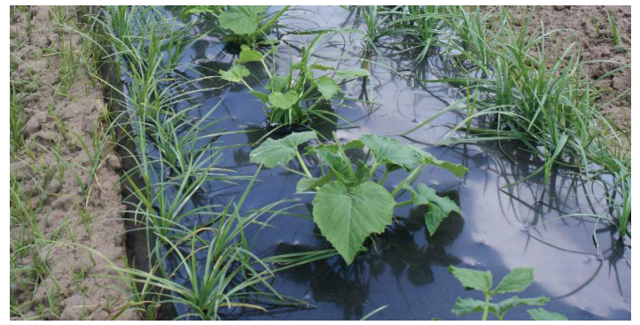
Figure 11. Purple nutsedge emergence through plastic mulch in squash.

grasses can be achieved with clethodim (Arrow®, Clethodim<sup>™</sup>, Select Max®, others) or clethodim (Poast®). These herbicides control only grass weeds and will not injure the squash plants. If injury does occur, this is the result of using a crop oil concentrate. During periods of extreme heat or high humidity use a nonionic surfactant or no surfactant according to the label recommendations.