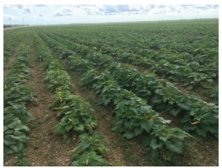
Figure 1. Overview of a yellow squash field in calcareous gravely soils of Miami-Dade County.

Summer squash is an important vegetable crop in Miami-Dade County (Figure 1). Summer squash is grown annually on about 6,000 acres and sold nationwide during the winter in the fresh market. Production costs range from $14.51 to $11.47 per bushel or $4,353 to $5,162/acre for an acceptable yield of 300 to 450 ($9.67 to 17.20/bushel), 42-pound bushels/acre, respectively.