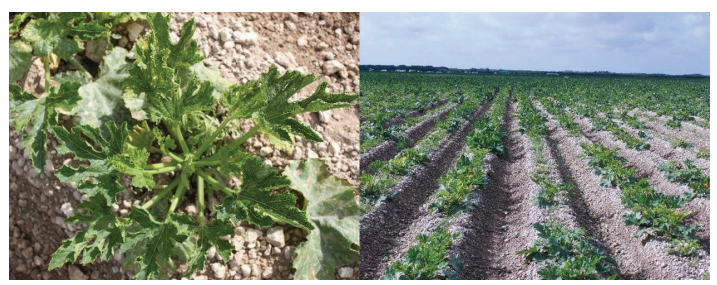
Figure 5. Symptoms of Tobacco streak virus (TSV), on zucchini squash (left), and a severely infected field of squash in Homestead, FL (right).

TSV is efficiently transmitted in fields by thrips such as Frankliniella occidentalis and Thrips tabaci by mechanical means, and could be seed transmitted in some plant species. The existence of diverse genotypes of TSV with distinct serological reactivity and variable symptom expression makes it difficult to accurately diagnose the disease.