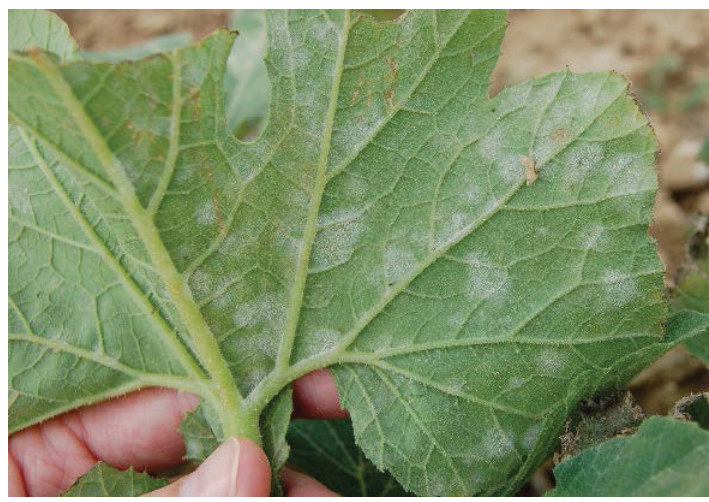
Figure 4. Powdery mildew on the lower surface of squash leaves.

powdery masses are spread by wind to nearby plants causing further infections. Severely infected leaves eventually turn yellow, then brown, and may eventually die, leaving fruits exposed to sunburn. The fungus does not infect the fruit directly. However, if the disease is severe, premature ripening may occur, and yield could be significantly reduced.