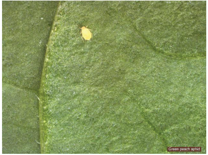
Figure 9. Green peach aphid.

In a severe case, up to 90% of squash plants can be infected with the virus.