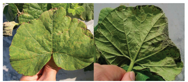
Figure 3. Symptoms of downy mildew on upper side (left) and underside (right) of butternut squash leaves. Note the gray-brown to purplish-black 'down' on the underside of the infected leaves.

when the leaf is wet, such as in the morning. The severely infected leaves will turn brown and die prematurely.