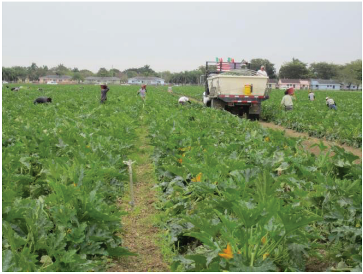
Figure 12. Overview of a zucchini production in calcareous soils in Miami-Dade County.

The harvest season extends from October into April. Squash is hand-picked.